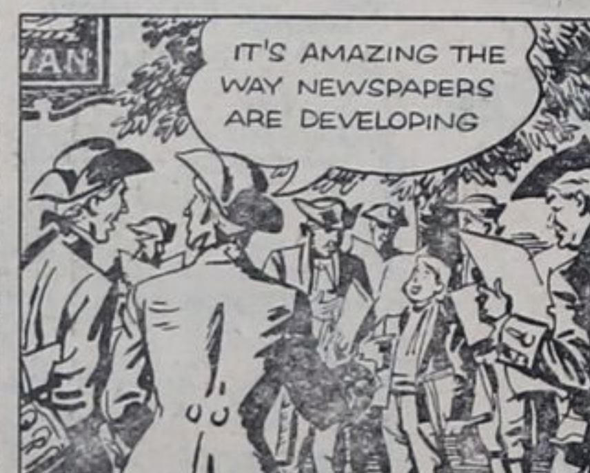
Soon, newspapers were everywhere. Government support was no longer necessary, for newspapers attracted private financial backing.