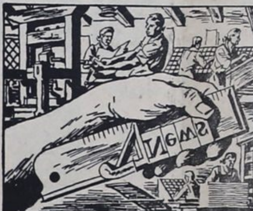
Meanwhile, other newspapers were rising—meeting the growing public demand for news, opinion, entertainment.