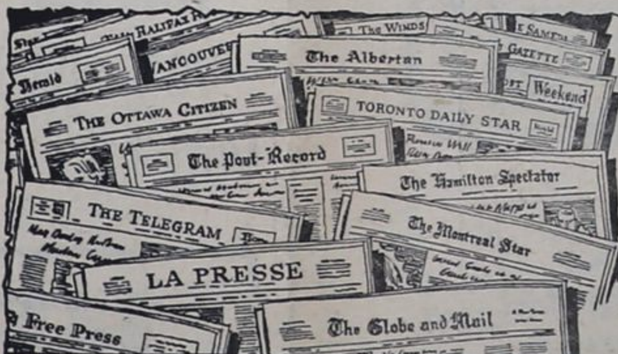
Today there are over 1,000 newspapers in Canada—in English, French, and many other languages! Free, strong, serving Canadians well, they owe much to pioneers like Anthony Henry.

Men like Anthony Henry depended upon their all-important associates—the far-sighted lending institutions and banks of Canada. They are always ready to help men of sound resolve... to help create the achievements that make Canada great. When you deposit your savings or do business with your Bank, you contribute to its power for progress. You become a partner with your Bank in the many enterprises which shape the future of our country. Drop in for a chat with your Bank of Nova Scotia manager. Your initiative can profit from his sound financial advice and assistance. You'll find him a good man to know.