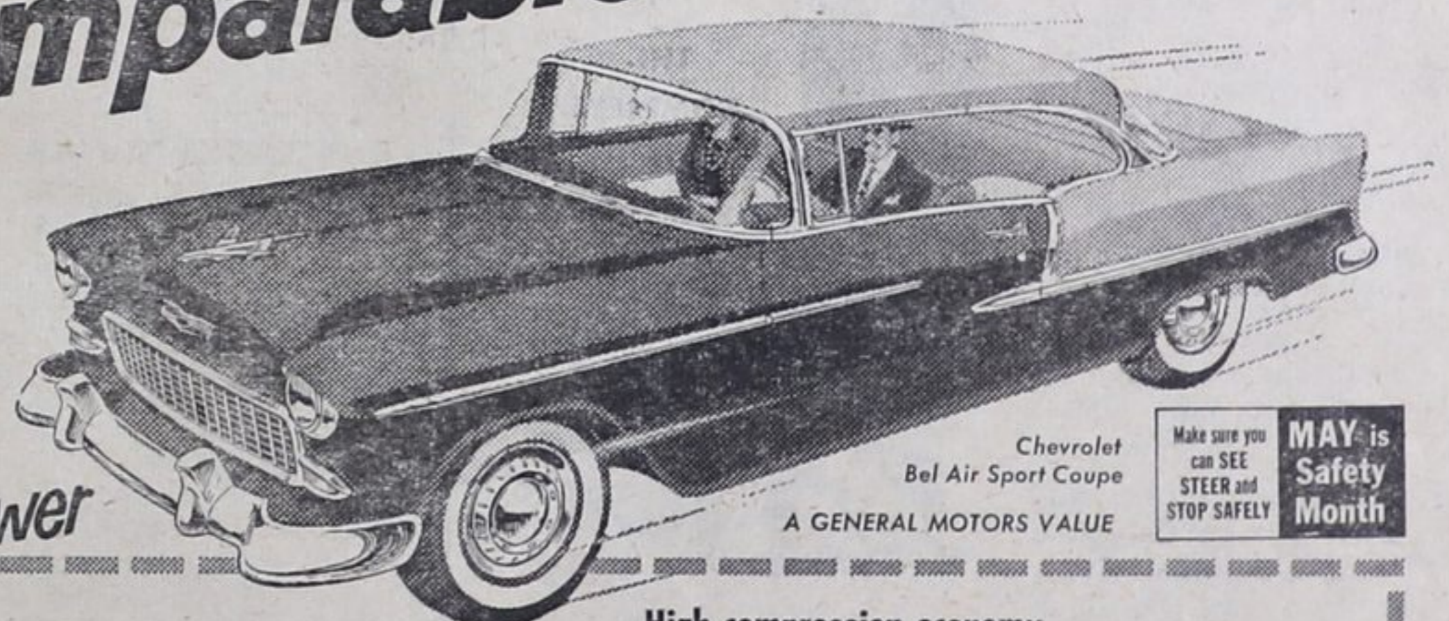
Chevrolet Bel Air Sport Coupe A GENERAL MOTORS VALUE

Here's why Chevrolet out-V8's all comparable makes!