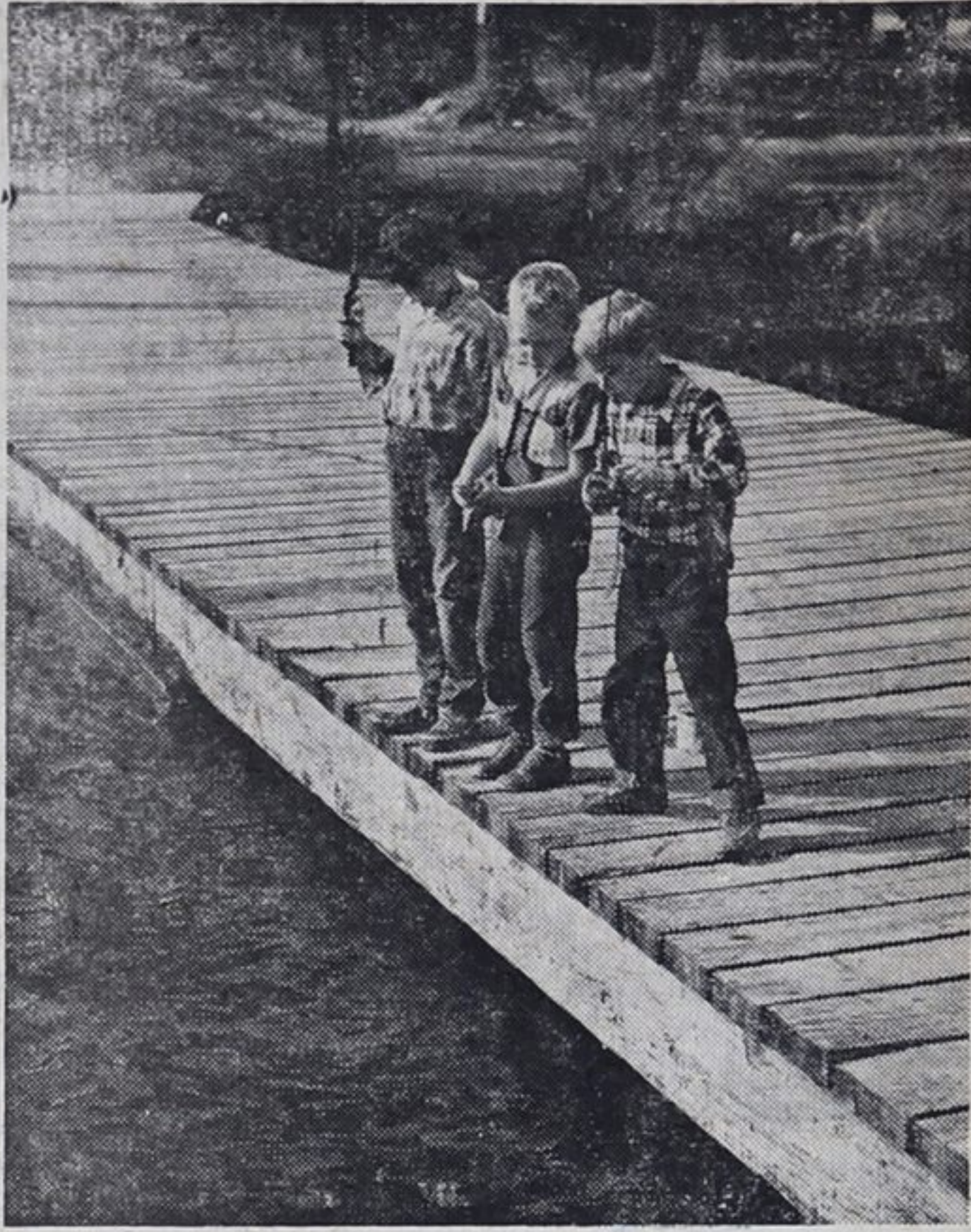
CONSERVATION LEADERS OF TOMORROW are Ontario lads like these young Trent Valley anglers. The Ontario Dept. of Lands and Forests reports increasing interest among young people in reasons for size and creel limits and wise use of all renewable natural resources. Interest is growing, too, in formation of Junior Conservation Clubs.