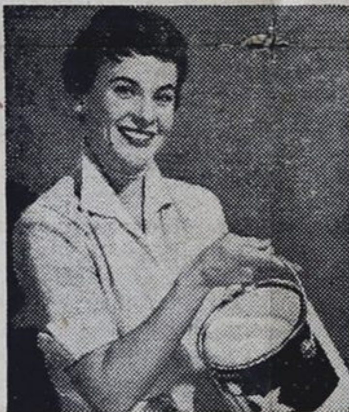
Look! Thix doesn't spill, won't splash or spatter.