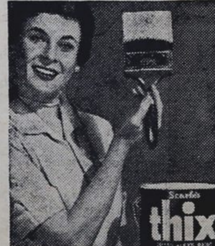
Thix doesn't run down brush handle—so clean and easy to use.