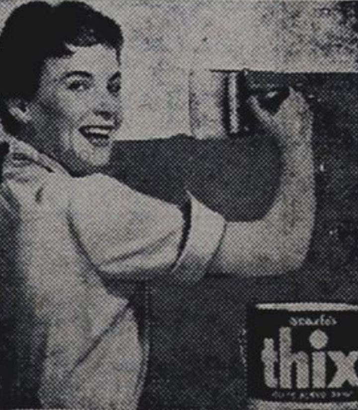
Make the brush stroke—and Thix runs as smooth as smooth.