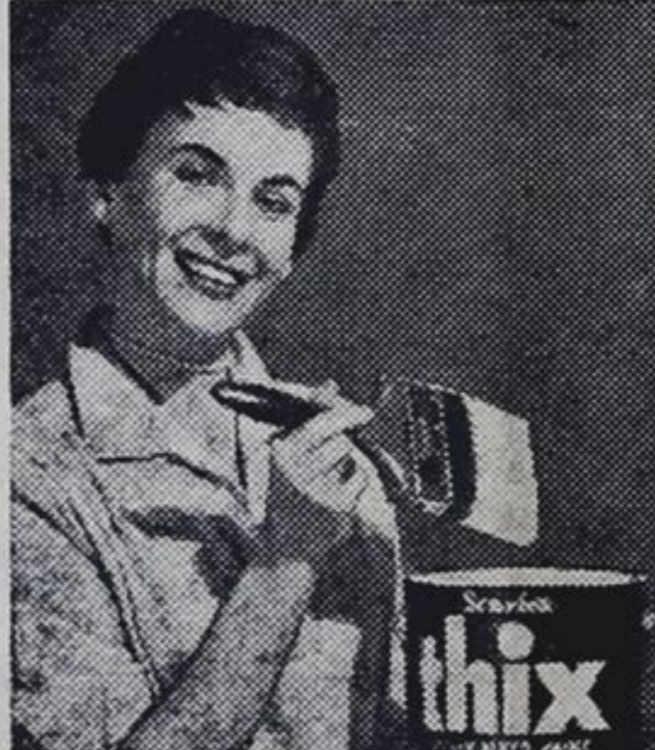
See—you dip your brush, and there's no drip with Thix.