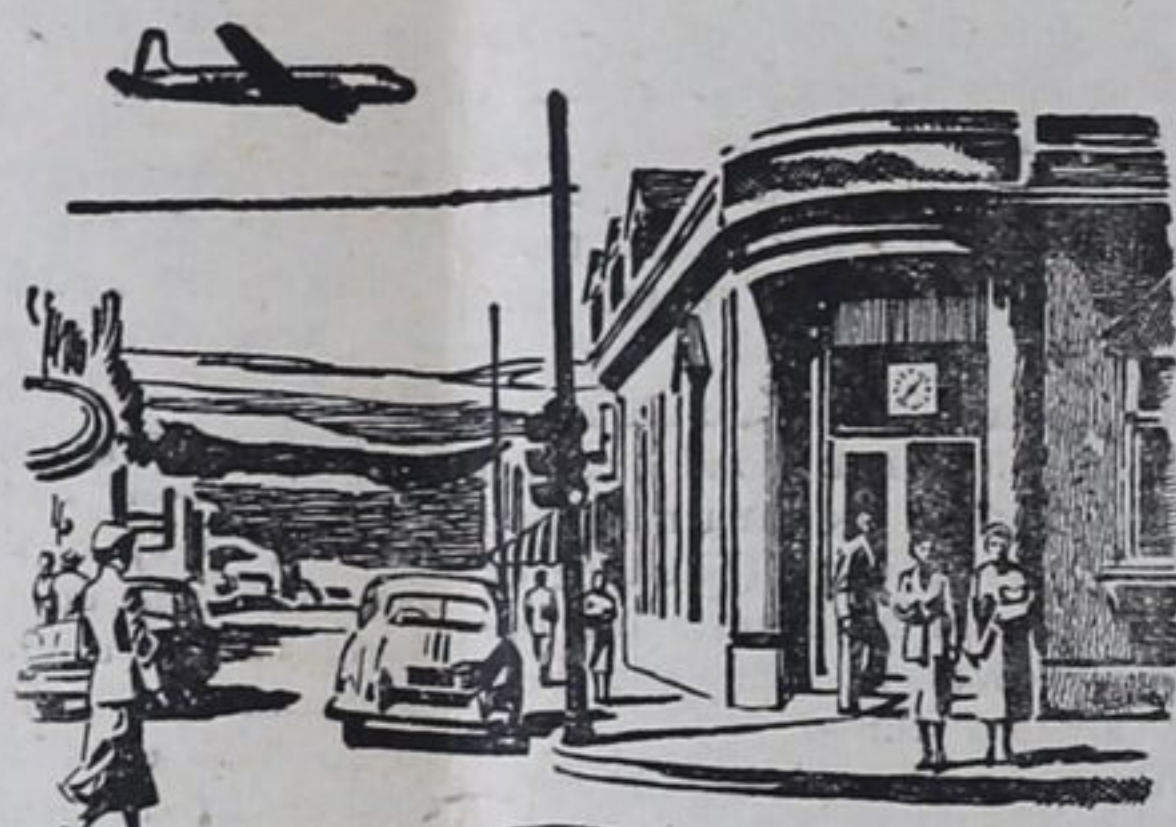
Your local bank is an essential link between your community and the whole banking world.