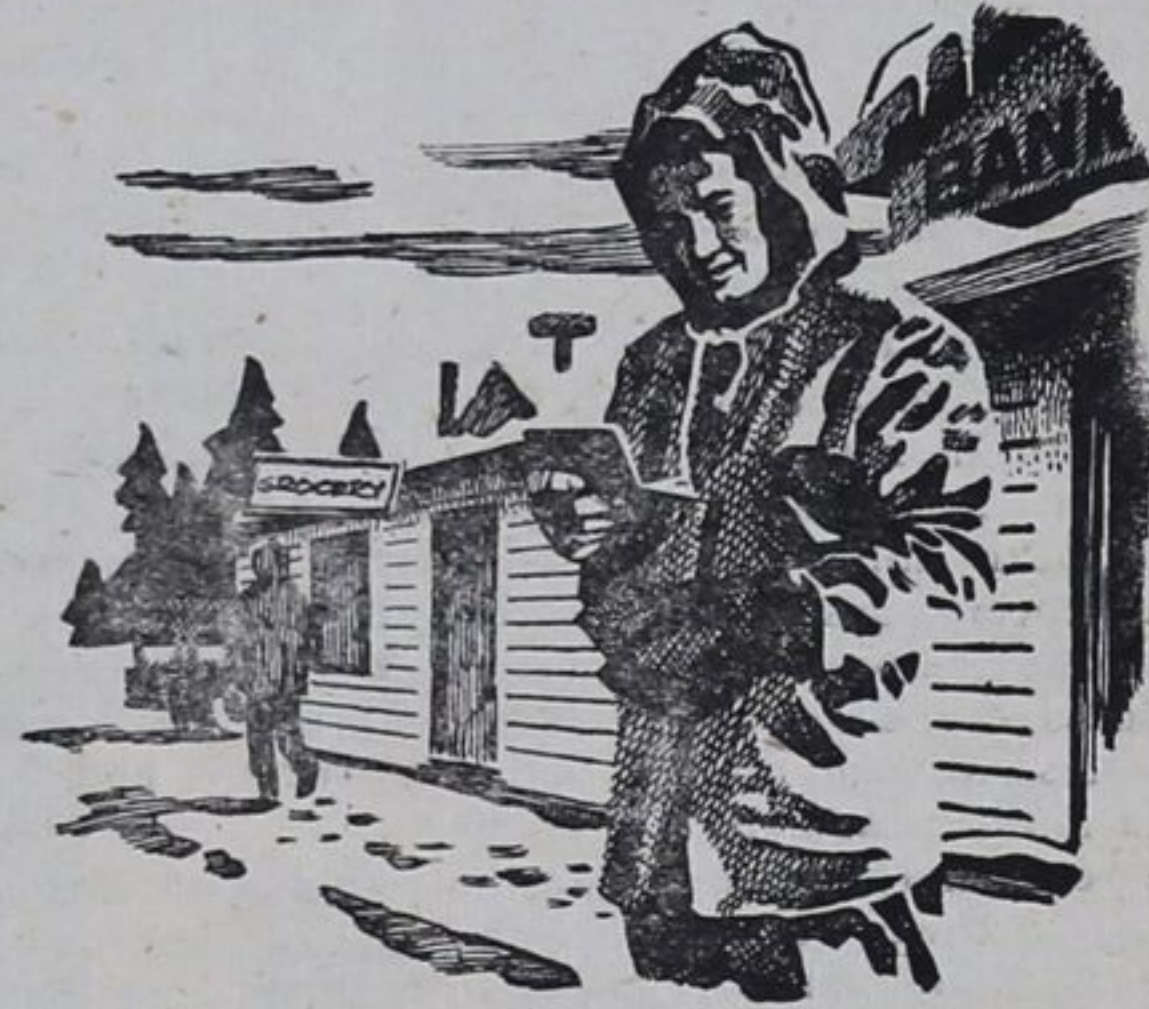
In remote areas, Canadians enjoy the same broad range of bank services, the same sense of security.