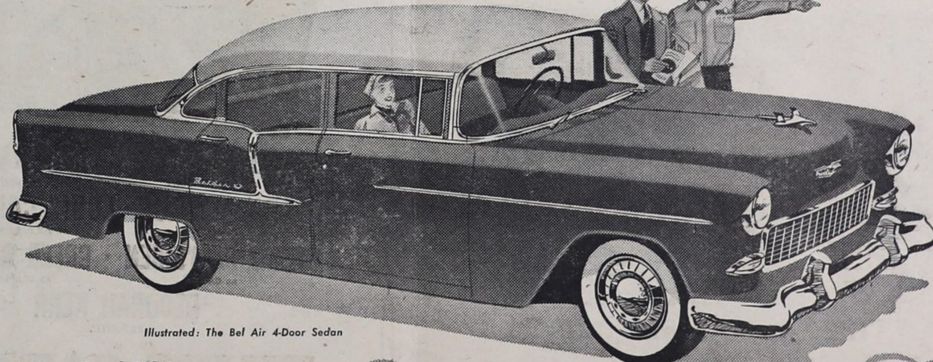
Illustrated: The Bel Air 4-Door Sedan