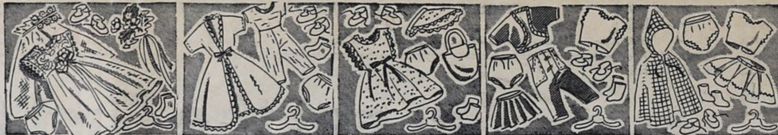
A-BRIDAL OUTFIT ... $1.98 B-SLEEPING OUTFIT .. $1.49 C-DRESS-UP OUTFIT.. $ .89 D-SPORTS OUTFIT ... $1.69 E-RAIN OUTFIT ..... $1.69