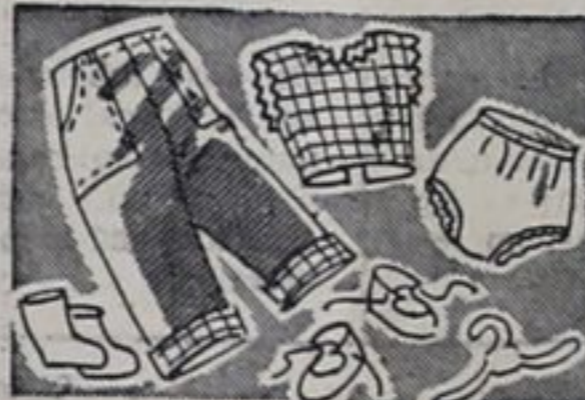
K-FARMERETTE OUTFIT $ .69