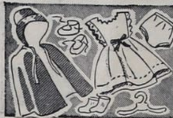
J-RED RIDING HOOD. $1.29