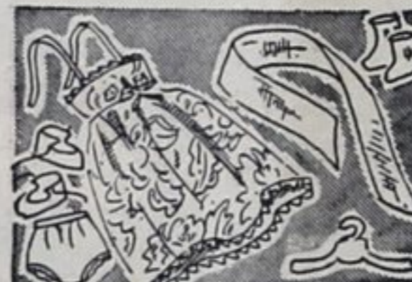
G-FORMAL OUTFIT ... $ .98