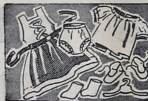
F-HEIDI OUTFIT ..... $1.69