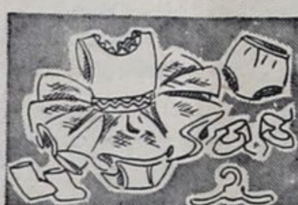
H-BALLERINA OUTFIT . $ .89