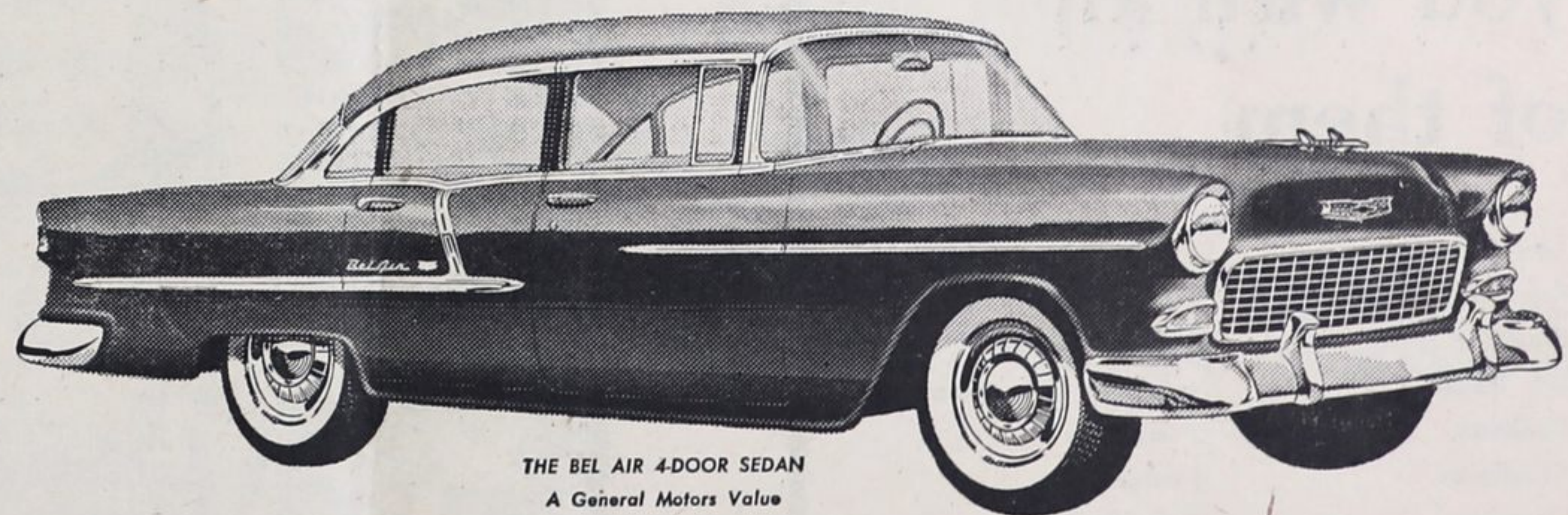
THE BEL AIR 4-DOOR SEDAN A General Motors Value

New spherical joints flex freely to cushion all road shocks. New Anti-Dive Braking Control assures level, "heads up" stops.