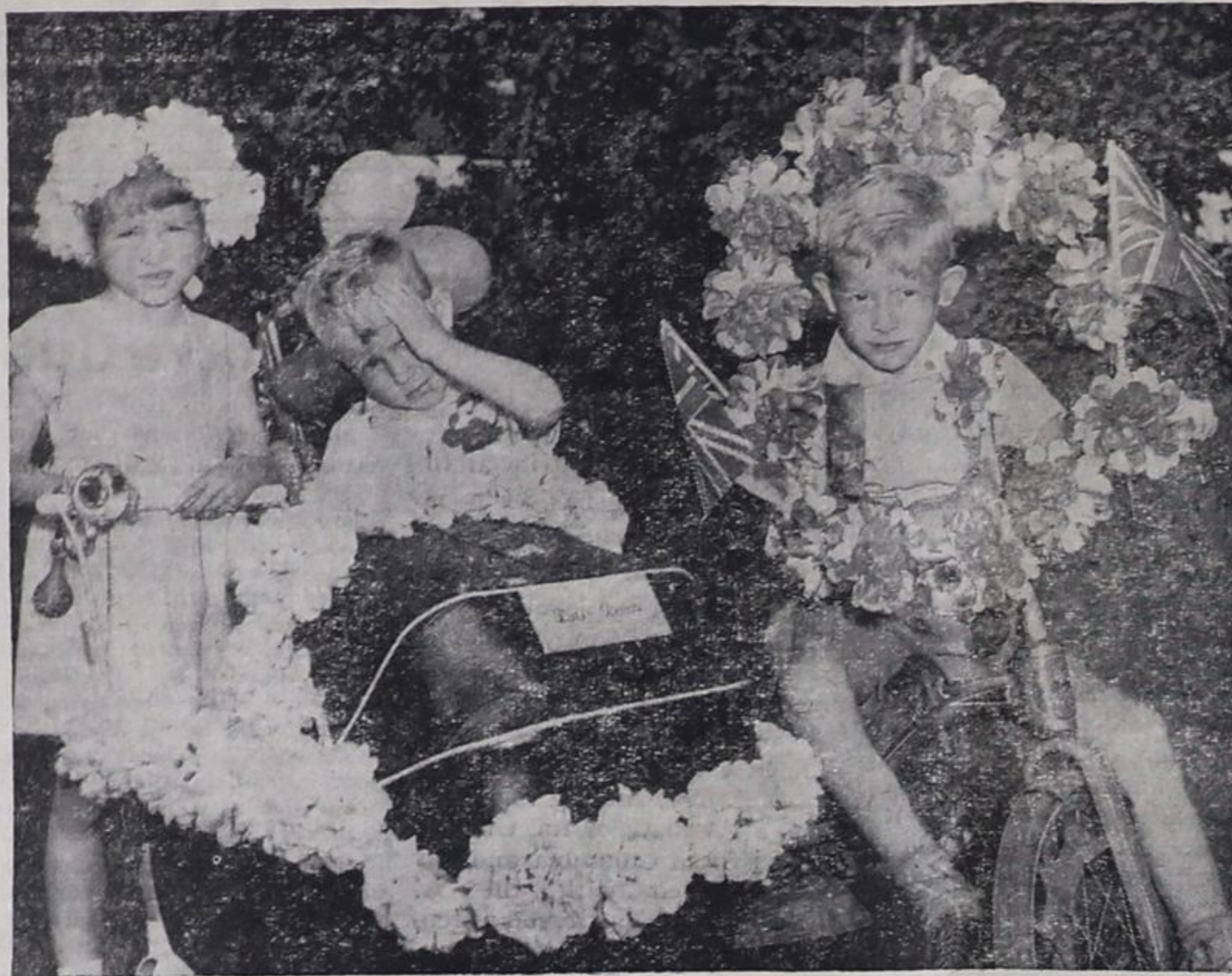
HAPPY DAYS — Three Grandchildren of Mayor H. A. Day steal the show at the Children's Day Parade at the Diamond Jubilee.