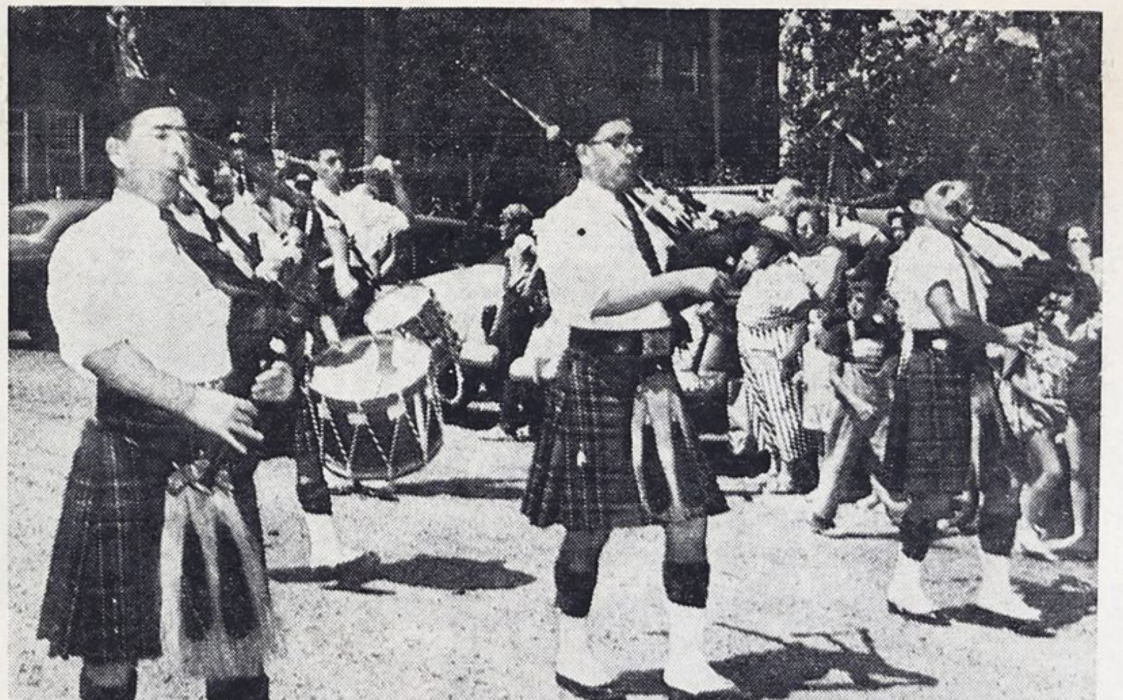
SCOTTIES of the Kirkland Lake Band proudly head the long, colorful parade. They fooled the happy throngs as they drove to the rendezvous or the walking personnel in the parade