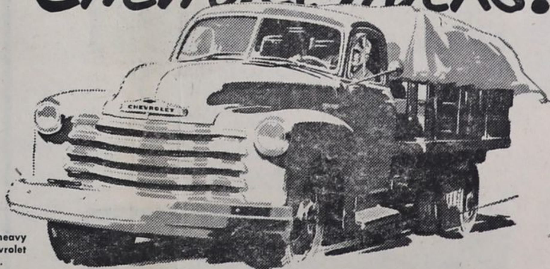
From light delivery to heavy hauling, there's a Chevrolet truck to fit your needs.