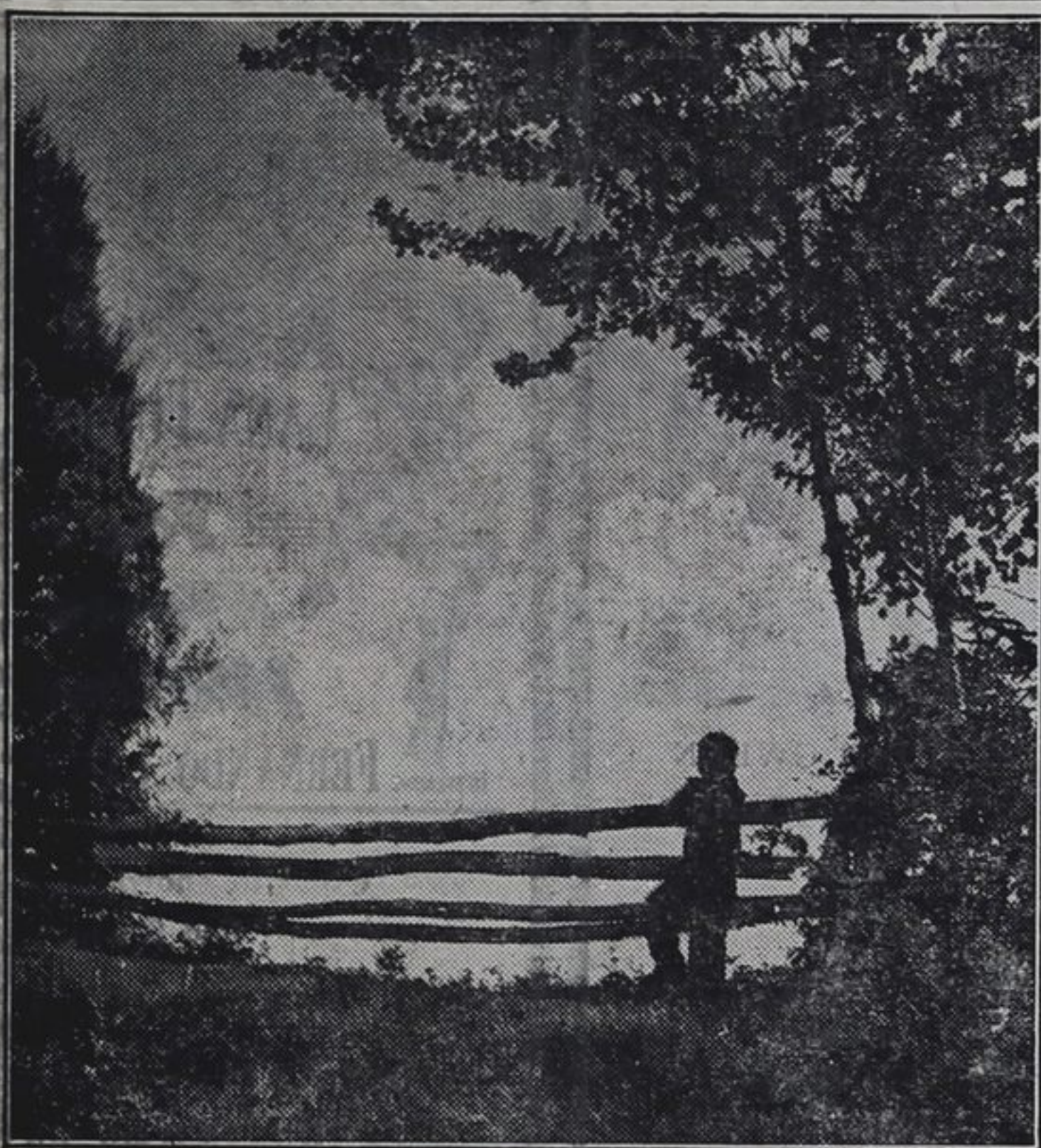
Carry a small camera with you, and you'll never have to pass up charming pictorial subjects like this.

EVERY good news photographer knows many practical short cuts in this business of picture making, and many amateur photographers could adopt a few with beneficial results.