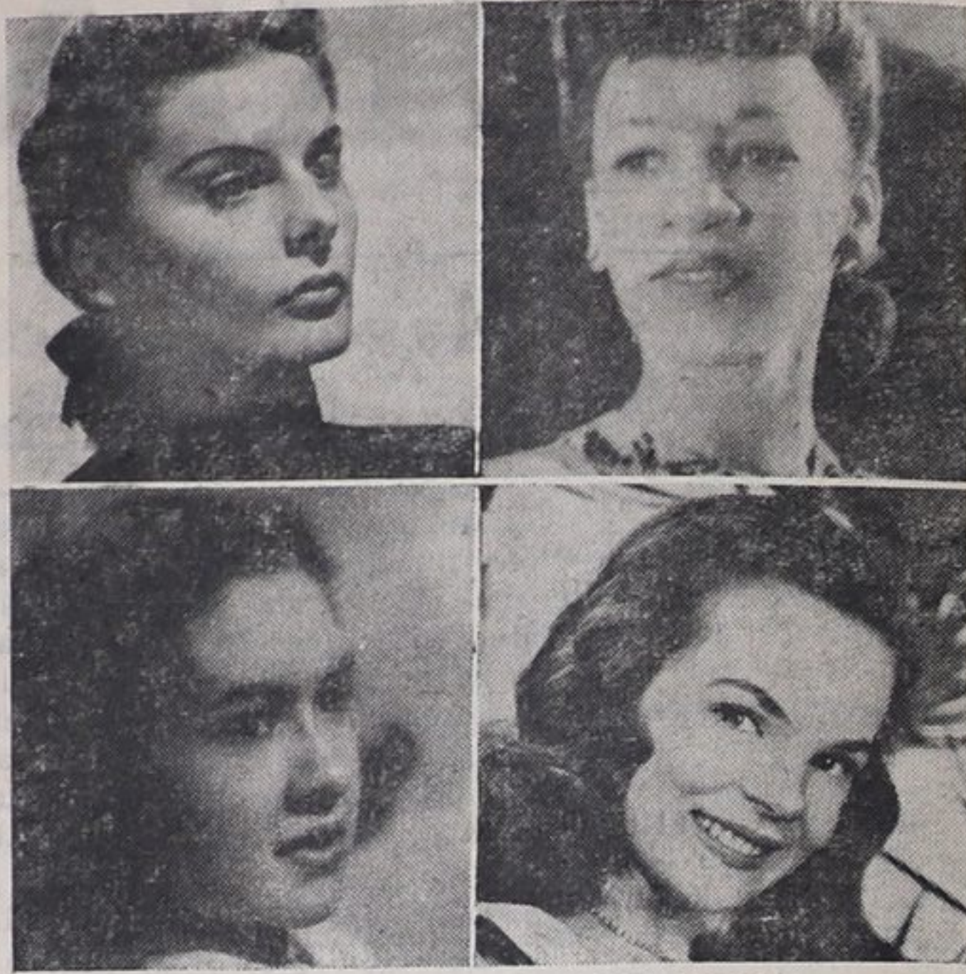
FOUR SINGERS — FOUR CITIES

When your back is stiff and very painful and it's an effort for you to stoop or bend, take the remedy that has brought swift, safe relief to thousands—Templeton's T-R-C's. Don't suffer from the nagging misery of Lumbago a day longer than you have to. Get T-R-C's today. 65c, $1.35 at drug counters. T-840