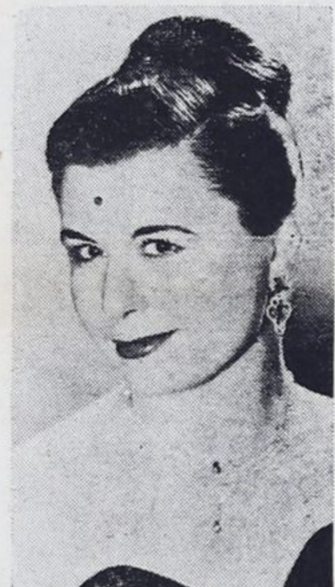
Ever since she made her radio debut in Ottawa at 16, singing has come first with sultry-voiced NORMA LOCKE, heard Sunday nights at 10.30 on the CBC Dominion network in the Mart Kenney Show. She has been singing with Mart since 1944, and a few weeks ago became Mrs. Kenney.

Canadians use about 16,900,000 cotton terry cloth towels a year.