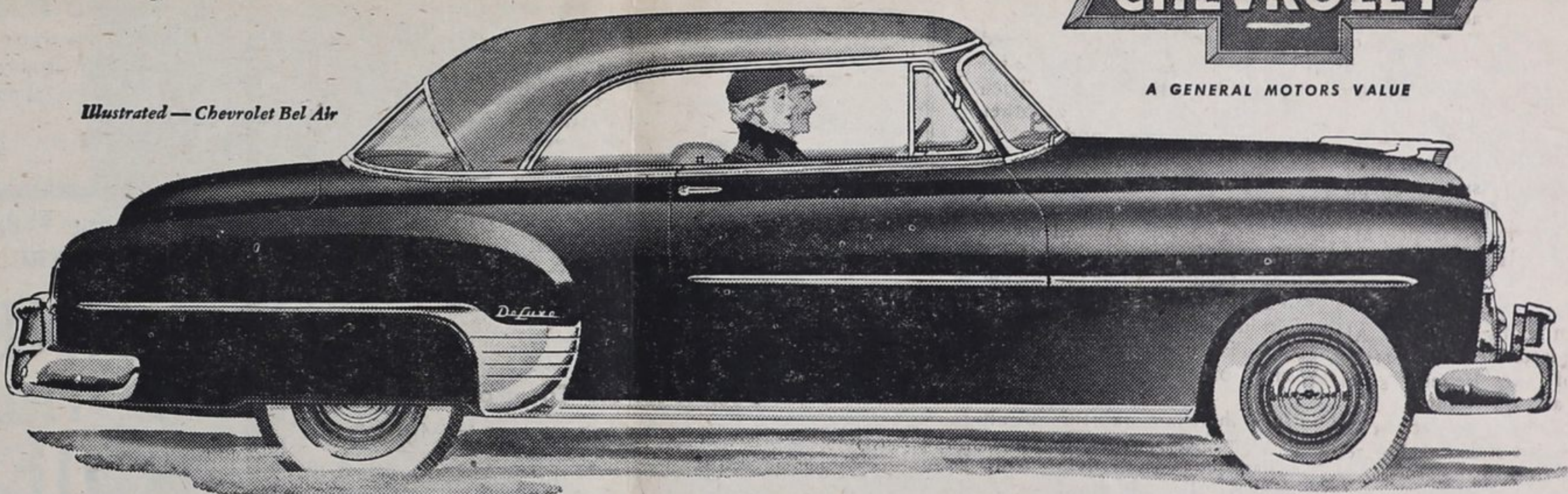
Illustrated — Chevrolet Bel Air