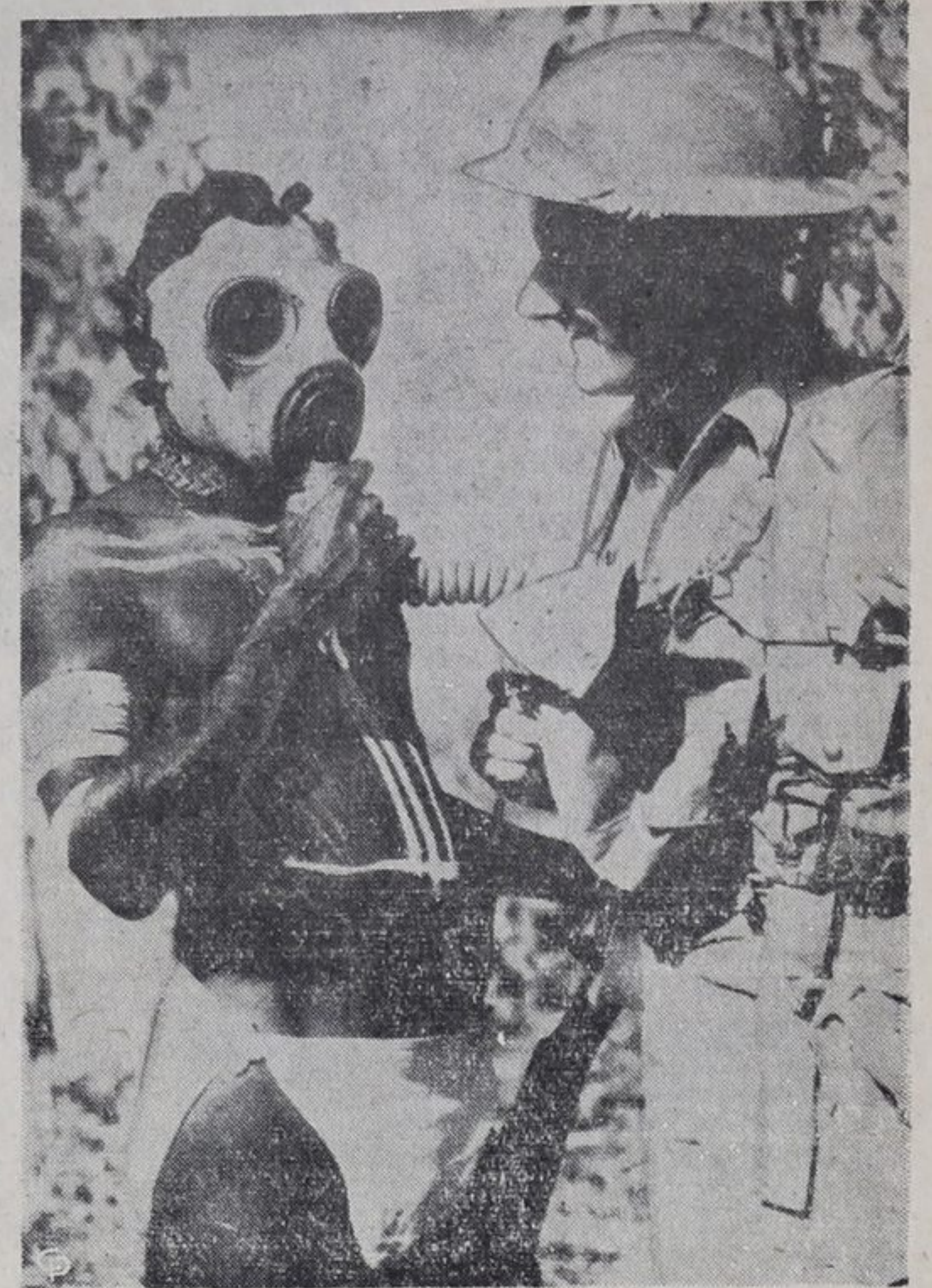
This photo was made in Australian territory where the threat of Japanese invasion has become acute. It shows a native being introduced to the gas mask. This modern device blends inconspicuously with the warriors' tribal paint.