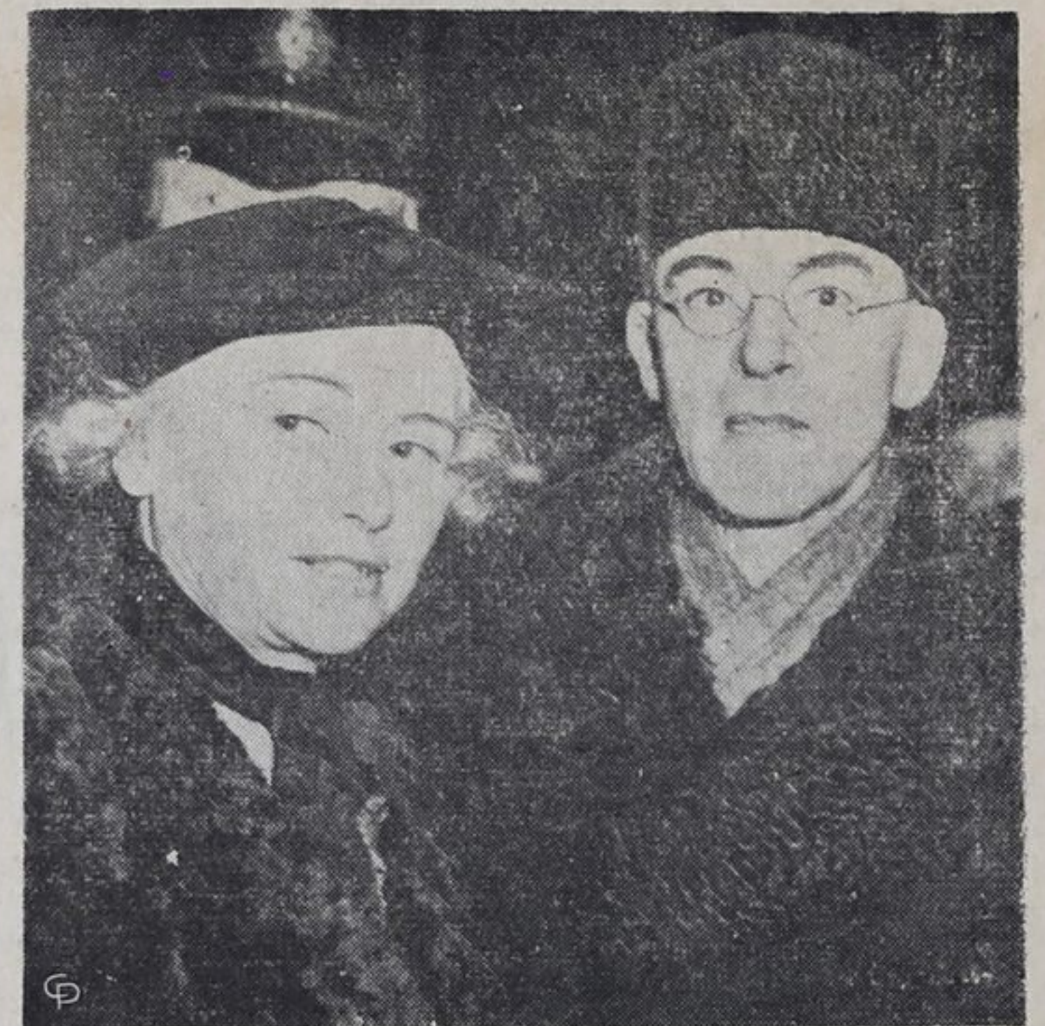
Sir Stafford Cripps, retiring British ambassador to Russia, is shown with Lady Cripps as he arrived in London from Moscow. Sir Stafford asked that Britain and the United States send more supplies to Russia for the expected spring drive Hitler's armies are expected to make.