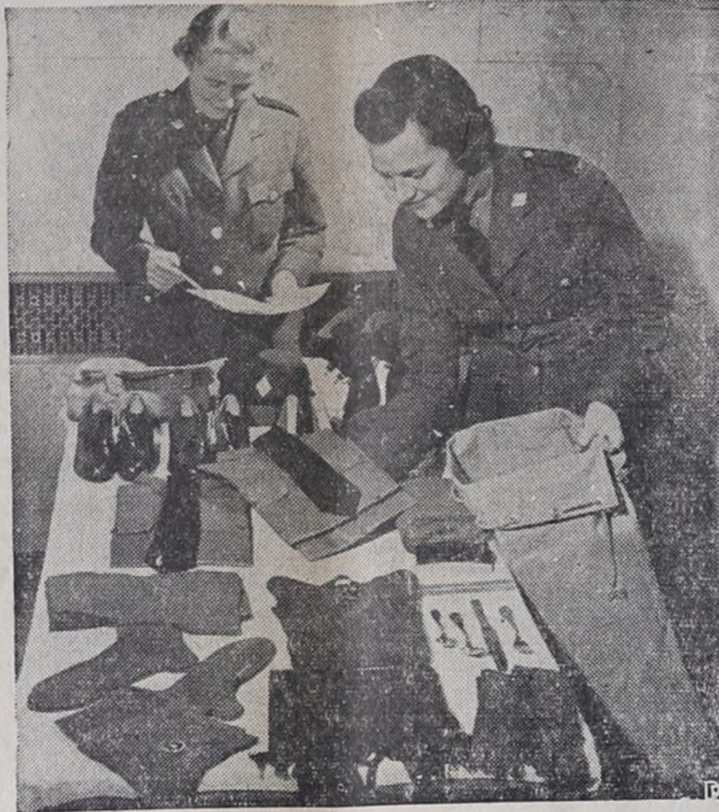
Although more than 18,000 women in Canada are anxious to join the Canadian Women's Army Corps and the Canadian Women's Auxiliary Air Force, it is not yet known how many of them will meet the army medical requirements. Already more than 1,000 women have been recruited in the C.W.A.C. and 900 in the C.W.A.A.F. Above, two members of the CWACS in their smart khaki uniforms and beach brown neckties, are shown filling a kit bag with the equipment supplied to each recruit.