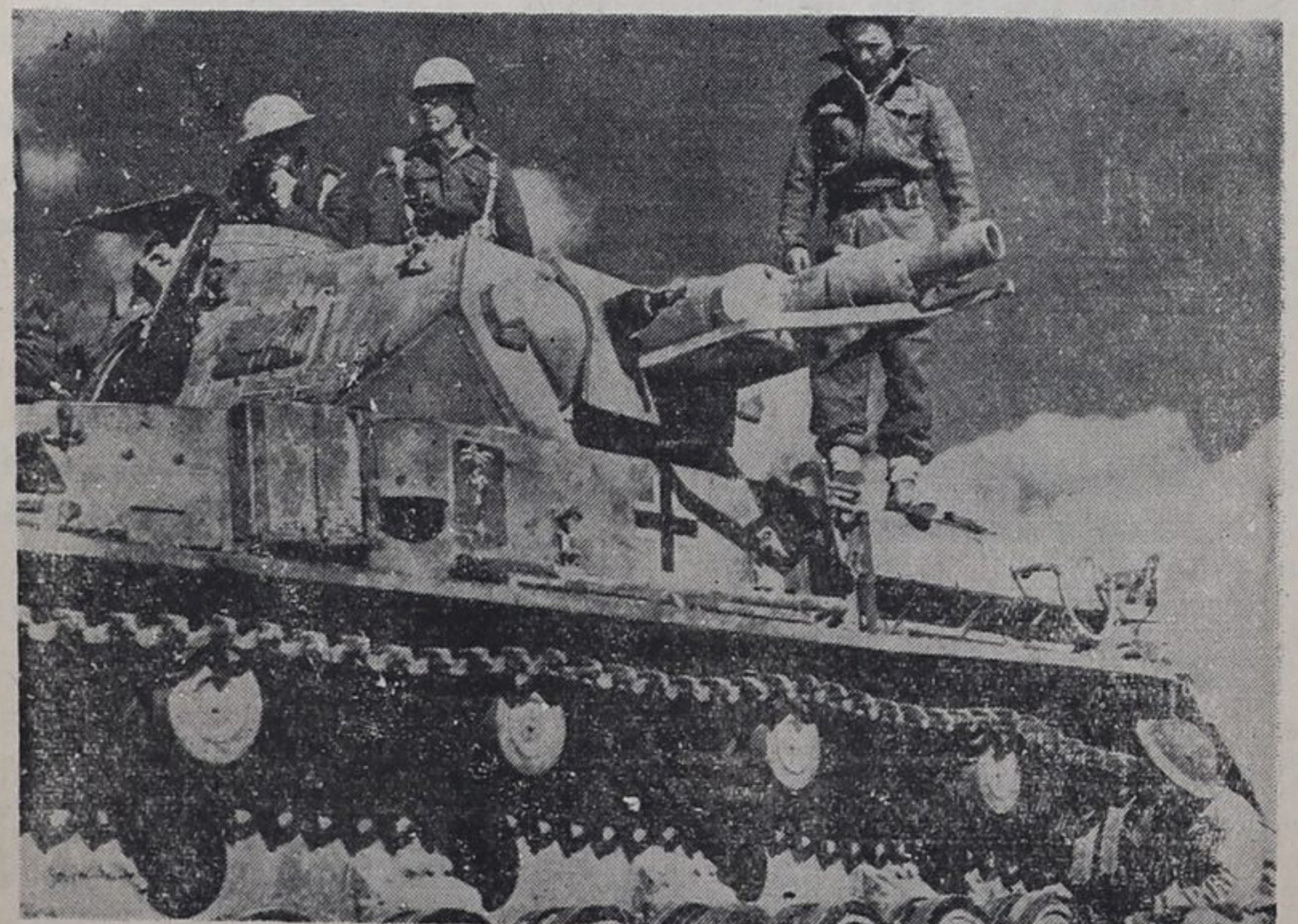
Four South African troops of the British Imperial forces make a close examination of a huge German mark 4 tank captured on the desert. Of special interest is the huge short-barrelled cannon mounted in the side of the tank which bears the "Afrika Korps" insignia.