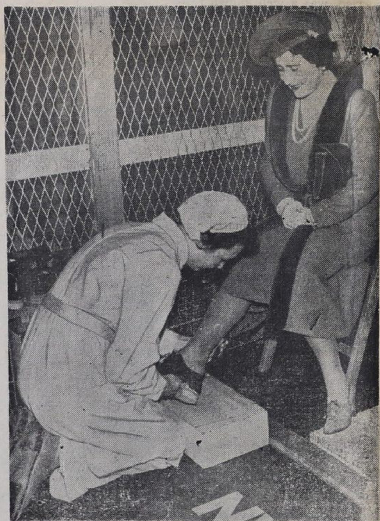
Paying a visit to a factory where explosive shells are filled for Britain's war effort, Queen Elizabeth is fitted with the special shoes that everyone must wear on entering the danger zone. Soles are rubber. Tacks in leather soles of ordinary shoes might strike a spark.