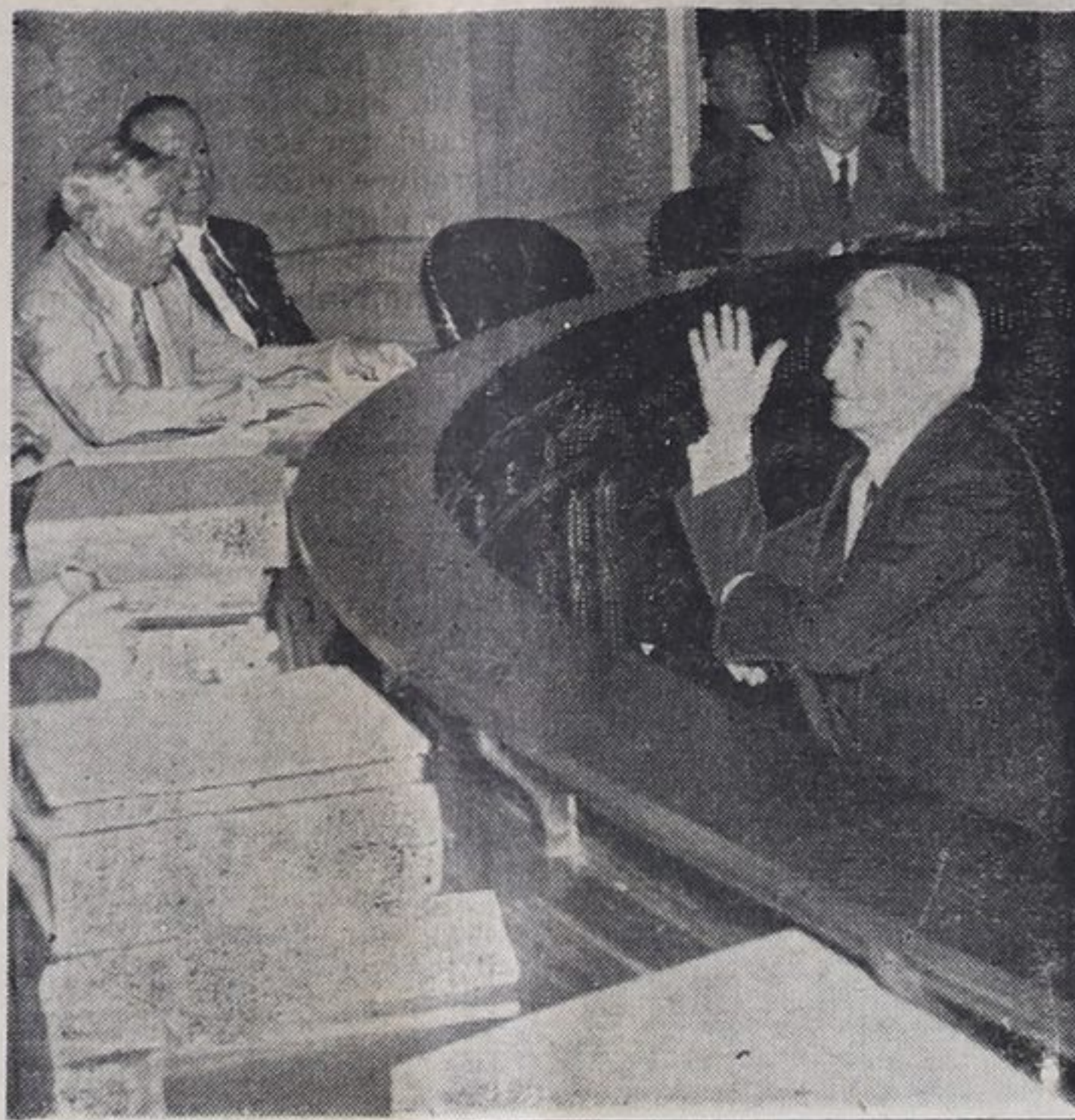
Bernard M. Baruch, who headed the U.S. war industries board during the world war No. 1, is pictured urging Congress "to put a ceiling over the whole price structure including wages, rents and farm prices." Baruch, who appeared before the House Banking and Currency committee, advocated a much more drastic price control bill than that planned by the administration.