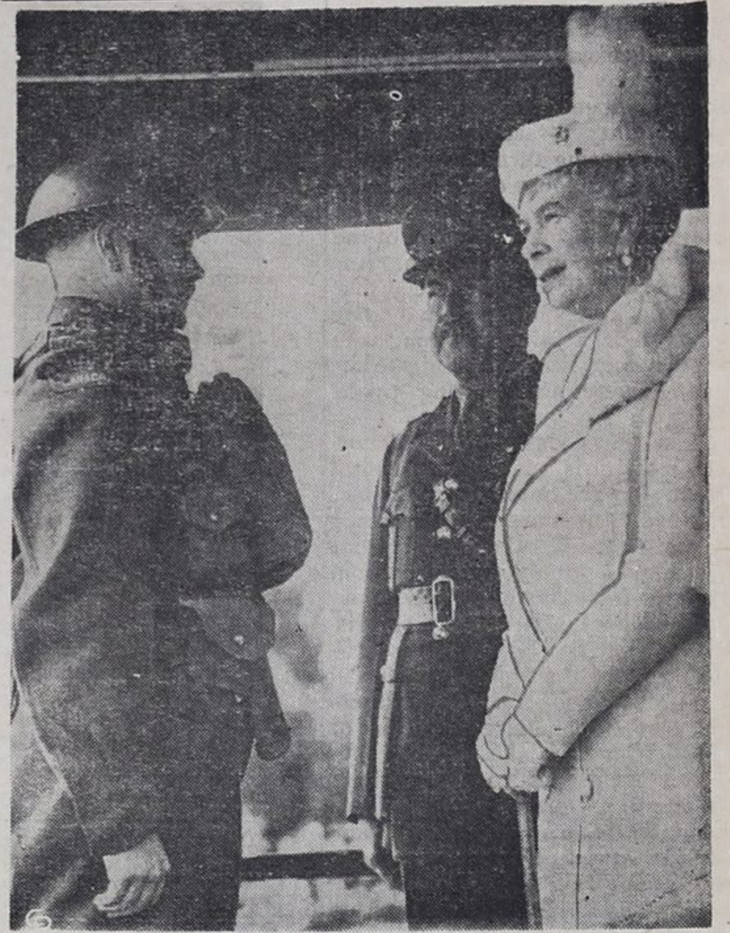
Her Majesty Queen Mary chats with the lieutenant-colonel (unidentified) of an Ontario regiment during a recent comprehensive visit to various army establishments in the south of England. She inspected the army school of cookery, a home for children of soldiers' families, and took the salute at a march past of the Ontario regiment, of which she is colonel-in-chief. This is the first picture of the queen-mother to reach Canada in many months.