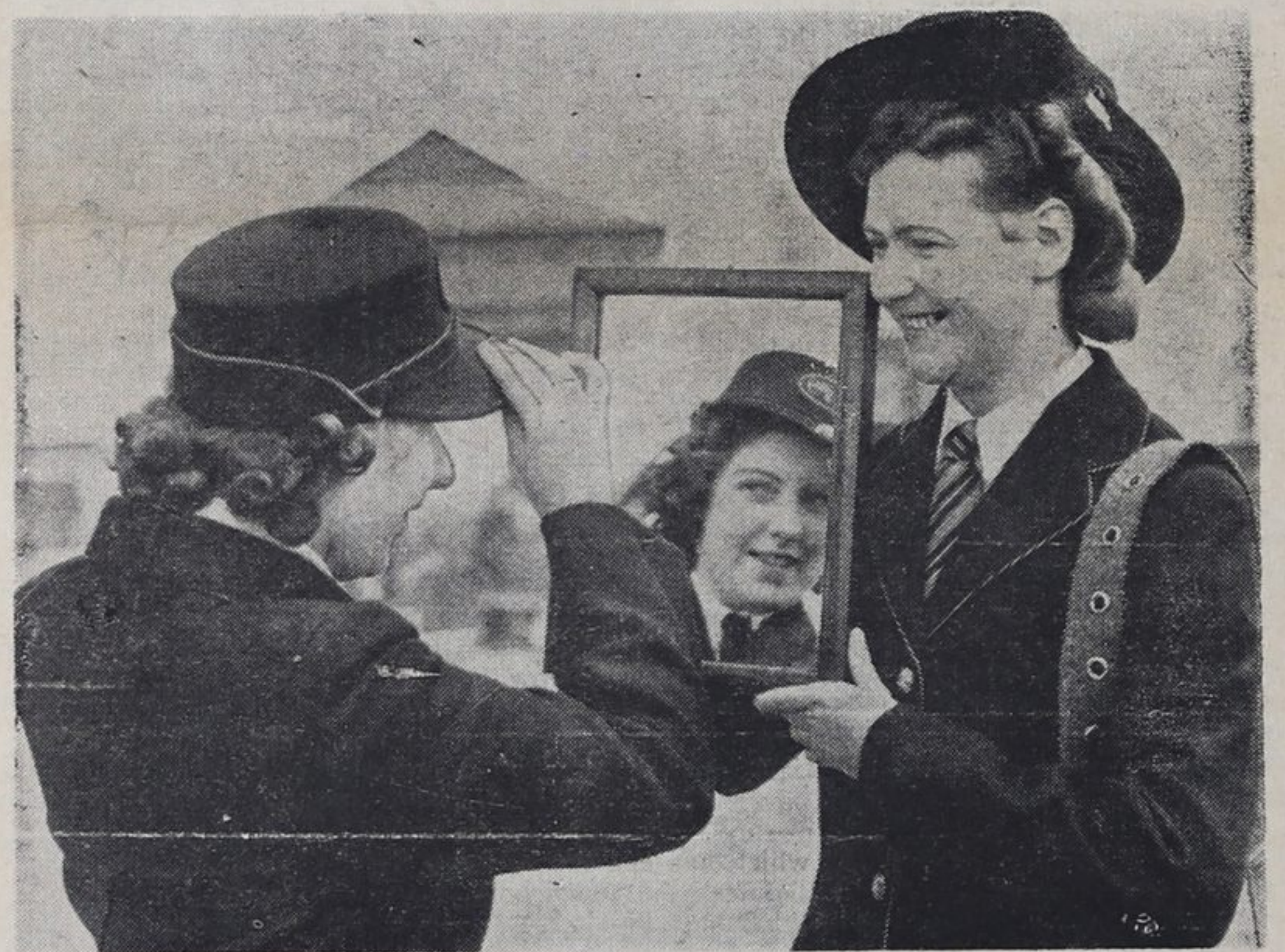
Each week shows the women of England playing an increasingly important role in their country's war effort. A postwoman, LEFT, tries on a new type of hat with the help of a mirror. The old type, worn by the young lady on the RIGHT, had a tendency to getting knocked off by the overhanging roof of the mail van, albeit the old model, somewhat like that of the Aussies, had a certain fashion flare about it.