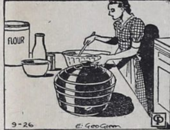
When you want to take a cake to the picnic in perfect shape, bake it in a casserole.