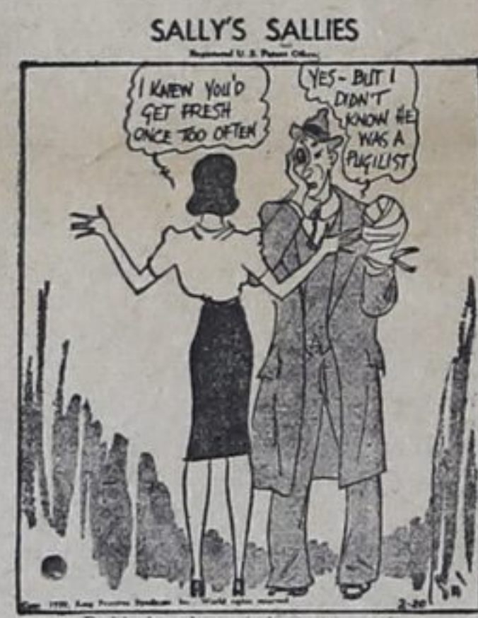
Bad luck and poor judgment are twins.