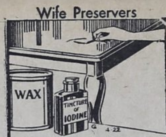
If your mahogany table is scratched, all the scratches with tincture of iodine. Then apply wax or furniture polish, and the scratches will be practically invisible.