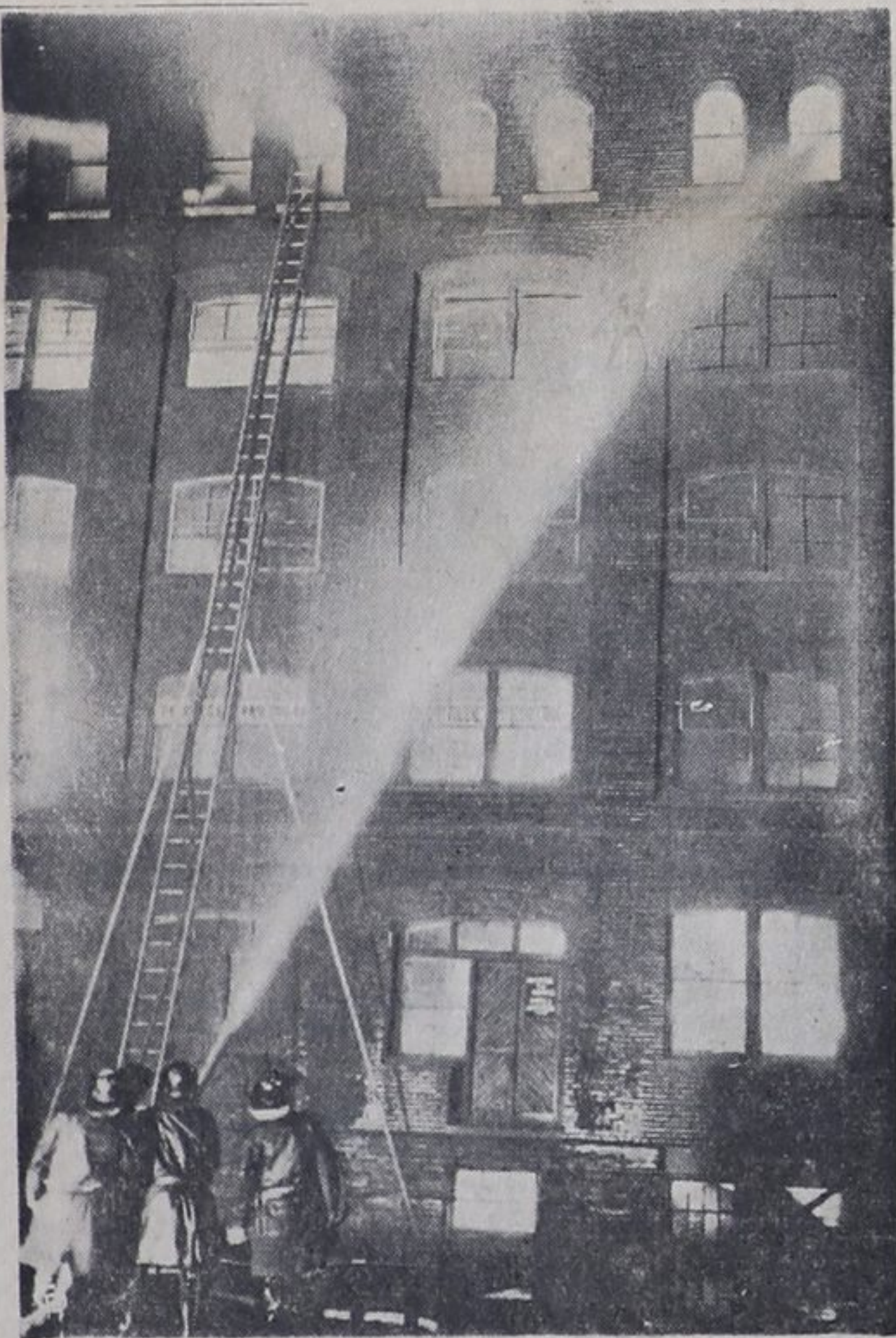
Three firemen were overcome as a result of the $75,000 fire which swept the fifth floor of the Nicholas factory building in Toronto. Several other firemen received minor injuries from falling glass and debris, but remained on duty during the most gruelling fight in the recent fire history of Toronto.