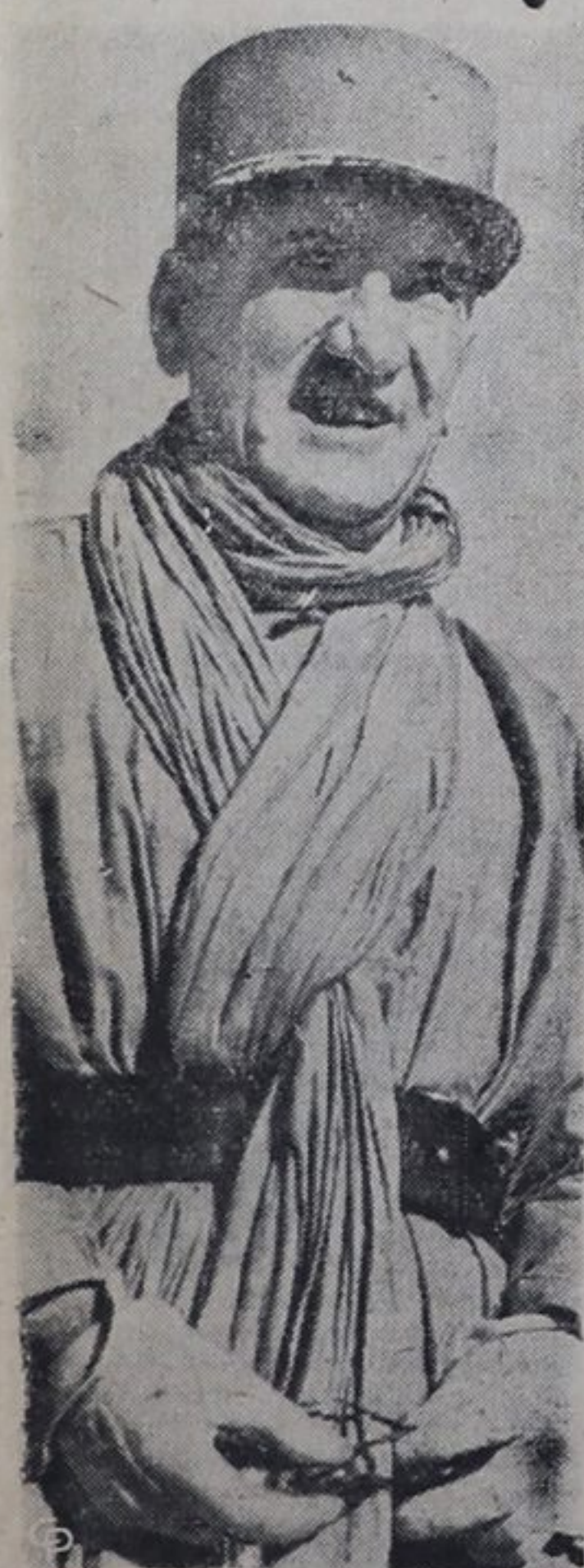
General Berthomet, ABOVE, is in charge of the "little Maginot line," key to French defence of Tunis. The centre of the strongly fortified line is at Mareth. After inspecting the fortifications, Premier Daladier answered Italian threats of aggression with the assertion France would not yield one inch of territory.