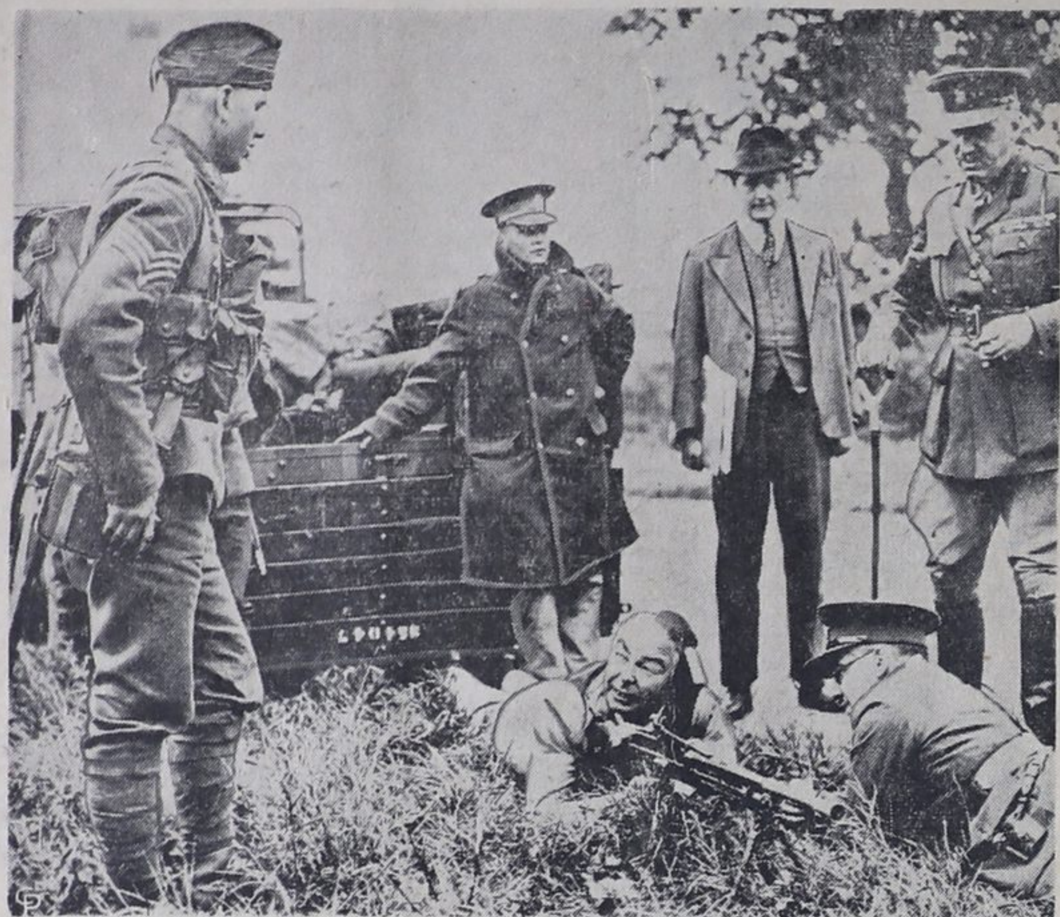
Perhaps the most important man in Premier Chamberlain's British cabinet in these crises-filled days is Leslie Hore-Belisha, minister of war, and responsible for the advancement and augmentation of Great Britain's armed forces. Working on the theory of "understand the armaments and you understand the army's complex problems," he is never too busy to join the troops as they go through manoeuvres, especially when some new type of weapon is under scrutiny, as was the case when this picture was taken. The minister of war is seen with a division outside London, as he is instructed in mastery of the intricacies of the Bren machine-gun, of which Canadians have heard more than a little over the past few months.