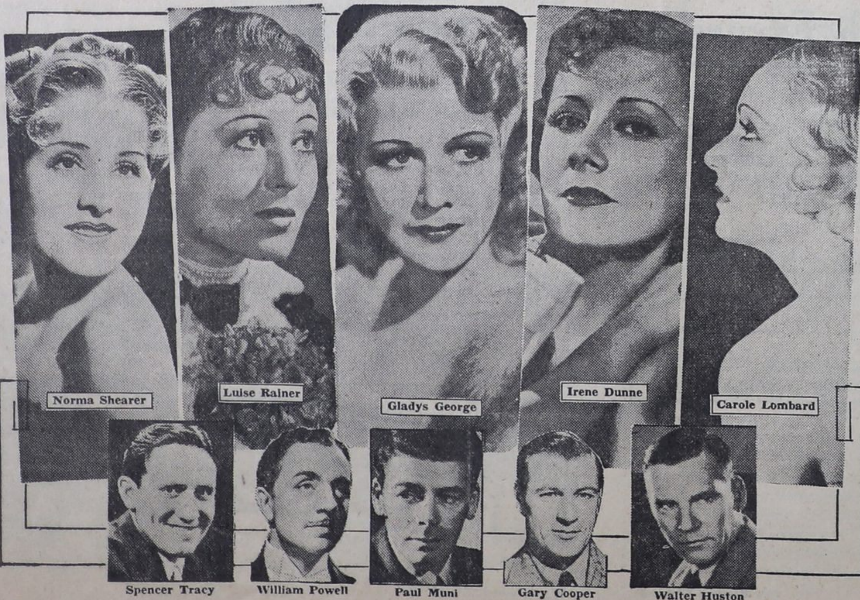
These stars were most prominent in the movie firmament in 1936 and were selected by the Motion Picture Academy of Arts and Sciences as the actors and actresses who gave the most outstanding performances last year. The group includes Carole Lombard, picked for her work in "My Man Godfrey"; Luise Rainer, "The Great Ziegfeld"; Irene Dunne, "Theodora Goes Wild"; Norma Shearer, "Romeo and Juliet"; Gladys George, "Valiant Is the Word for Carrie"; Paul Muni, "The Story of Louis Pasteur"; Spencer Tracy, "San Francisco"; William Powell, "My Man Godfrey"; Walter Huston, "Dodsworth"; and Gary Cooper for "Mr. Deeds Goes to Town."