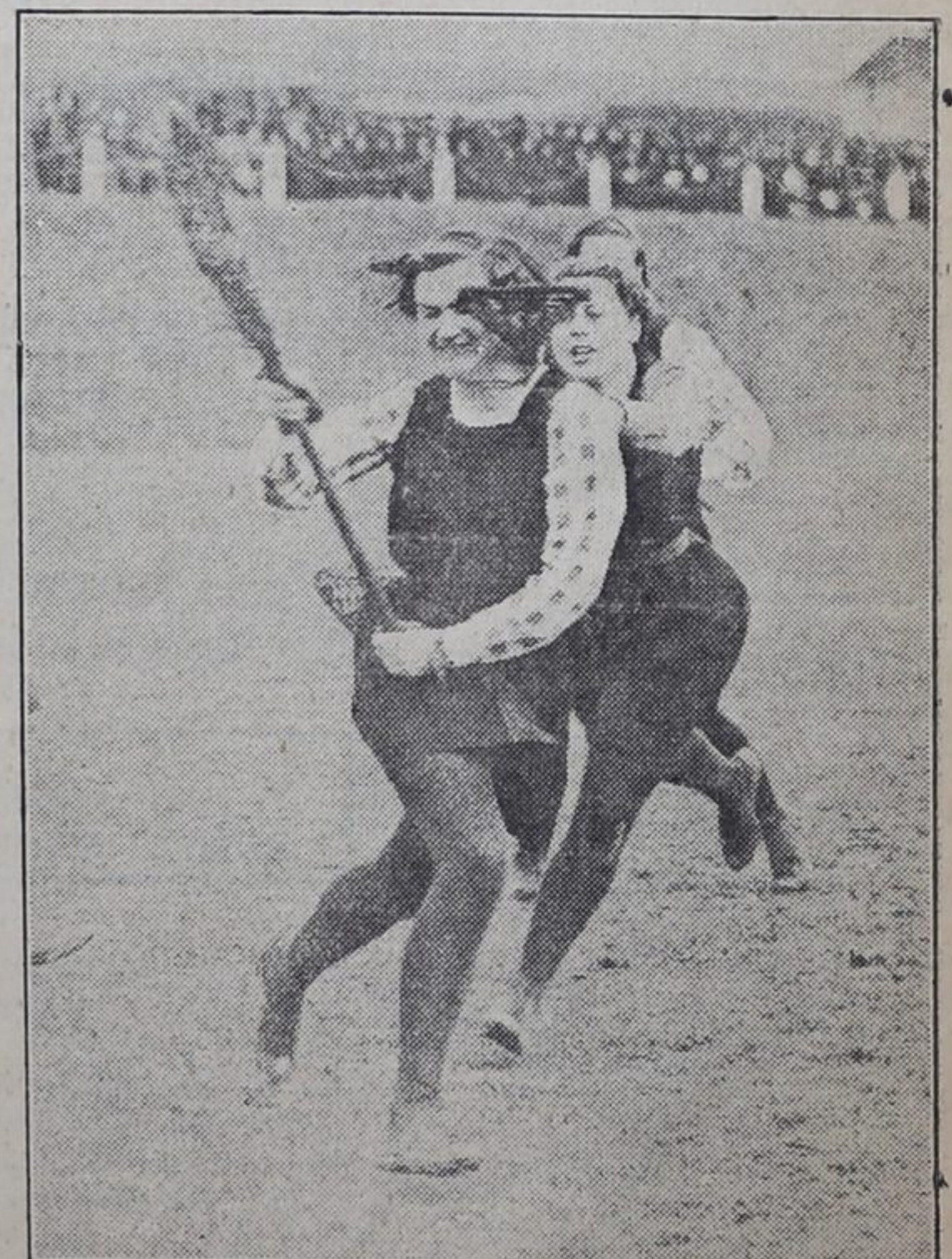
Judging by the expression on the face of the young lady in the foreground, she doesn't like the reception at all. This picture, taken at Brighton, during the English ladies' lacrosse game between North and South, shows one of the North players receiving a bad crack with the stick after getting possession of the ball.