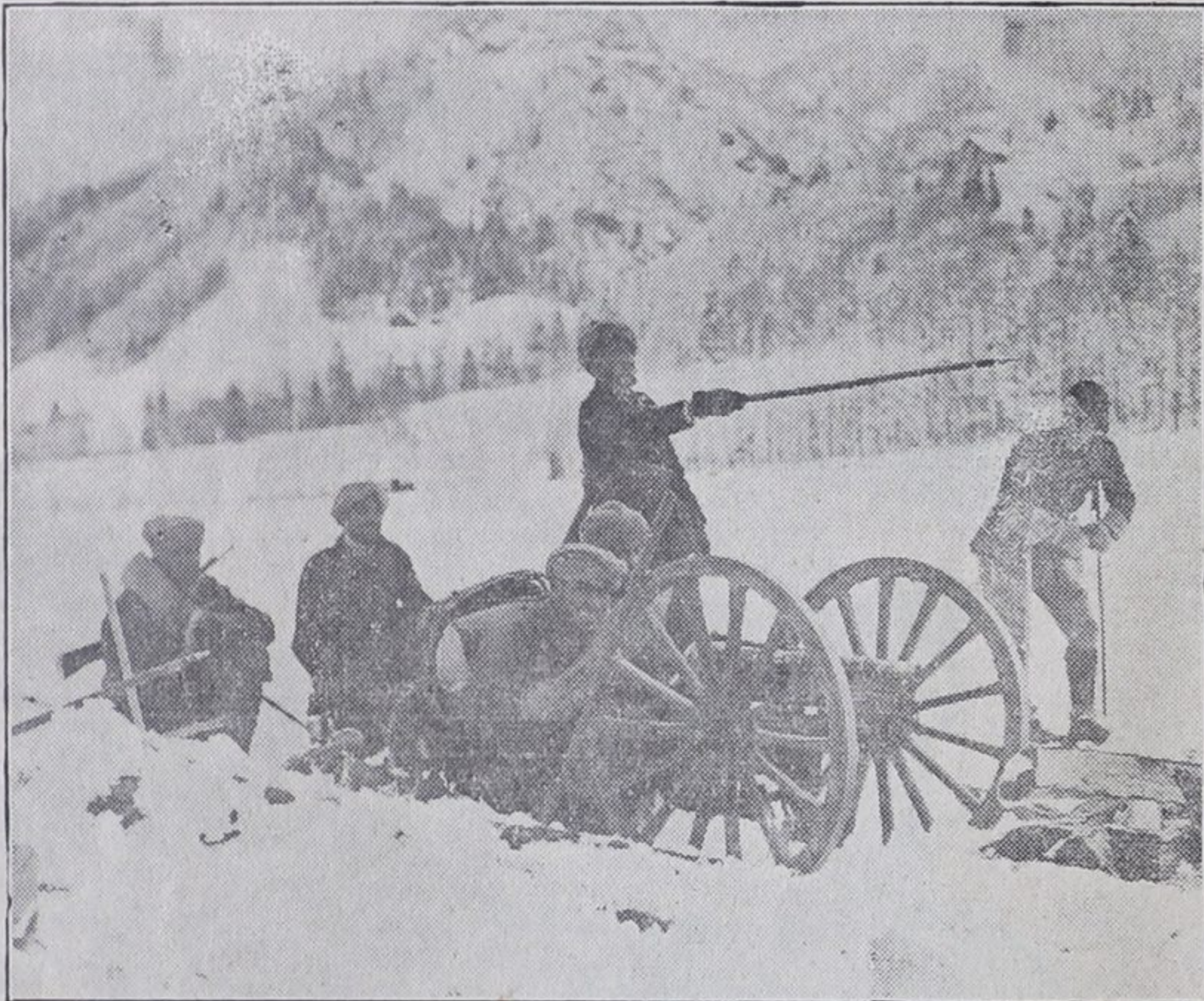
This surprising picture shows Moors taking part in the French army manoeuvres in the Nantet Pass between Faverges and Thones. It is not generally known that there is a large contingent of Moors in the French army.