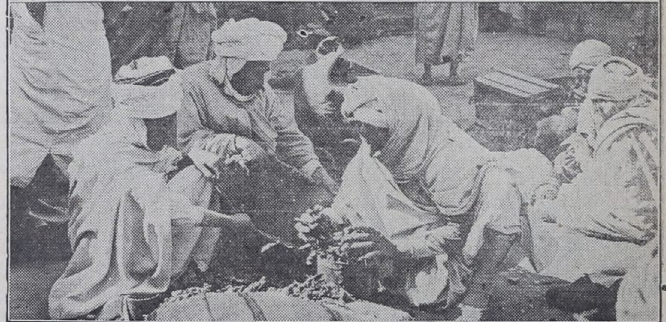
Although very little is appearing in the press about Pan-Arabism, as it is called, there is nevertheless, an amazing cycle of Moslem nationalism sweeping through near East. Last year saw both Egypt and Syria gain their independence and now these two nations are clamoring for the rights of the Palestinian brethren, and several non-aggression treaties have been signed between the Moslem countries of Turkey, Iran, Saudi Arabia and Afghanistan. The future movements of these countries is being carefully watched by European statesmen. The map above shows all the Moslem lands as they sweep across the globe from India to the Atlantic. The picture below is typical of Arabs in Algeria as they gather in the market places.—Map by Literary Digest.