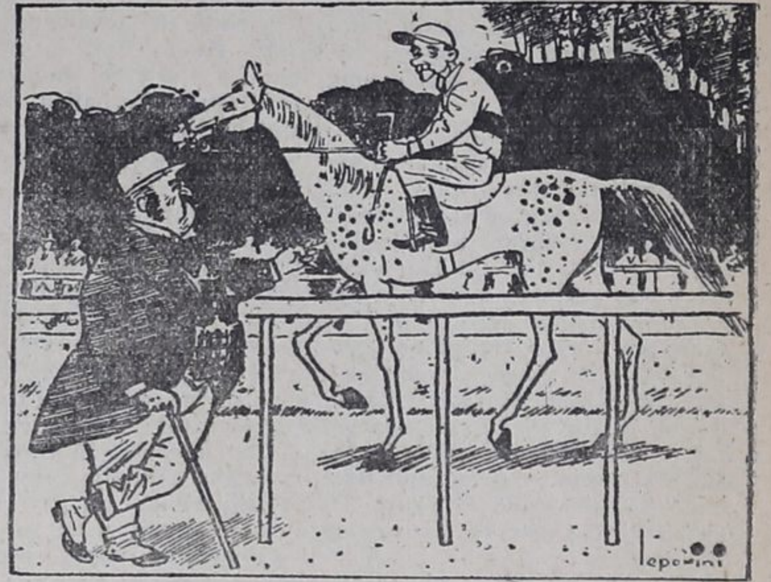
"Has that horse ever won a race?" "Couldn't say. I've only been riding him for four years!" —Il Travaso, Rome