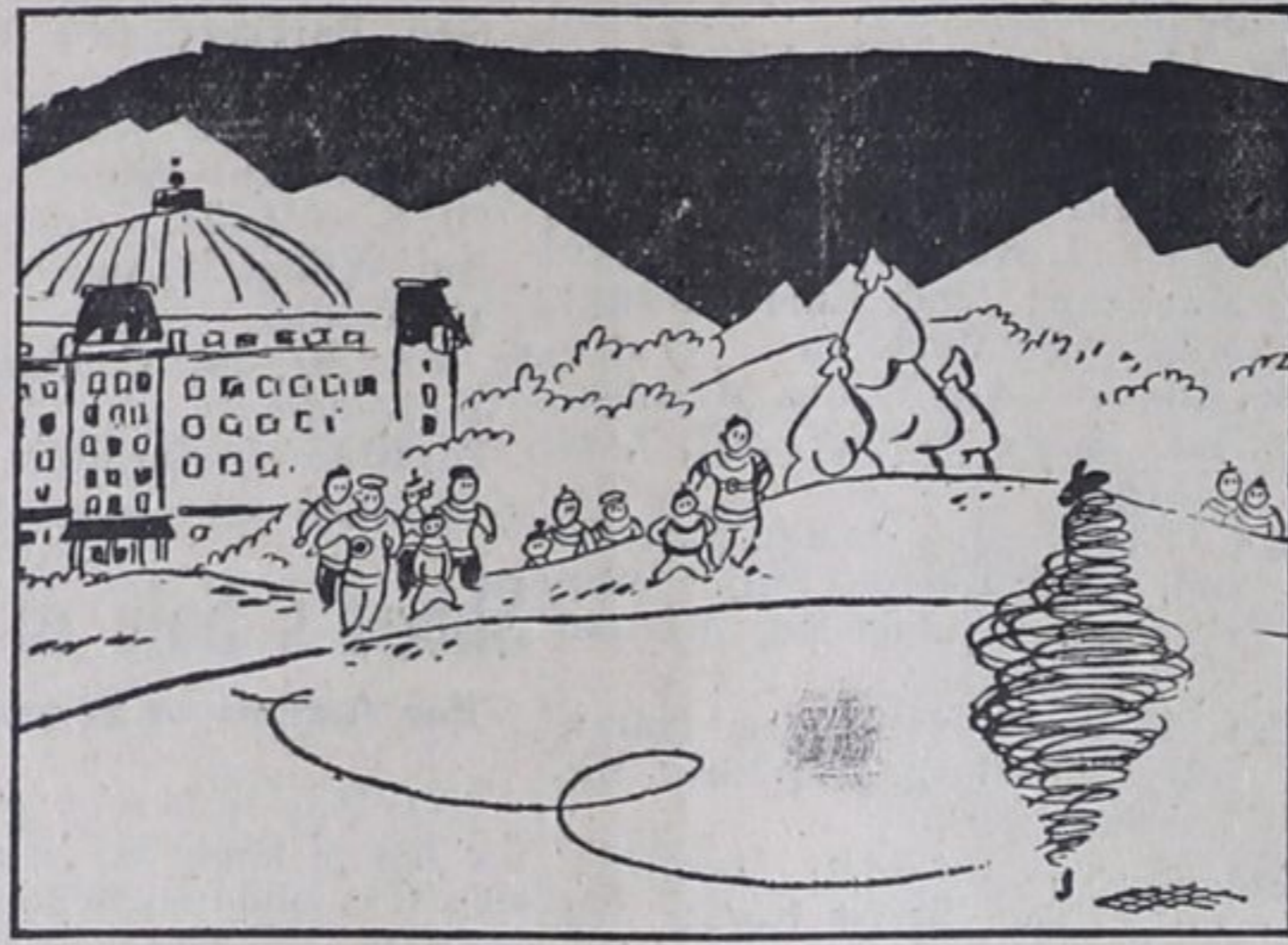
FANCY SKATER: "Good Heavens! I've forgotten how to stop!" —Der Lustige Sachse, Leipzig