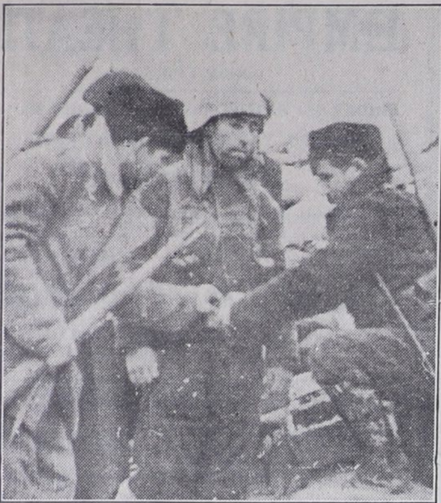
A member of General Franco's insurgent army, the fellow in the centre of the picture, had the misfortune to be captured by Loyalist troops near Madrid. After being disarmed and searched, he was shot.