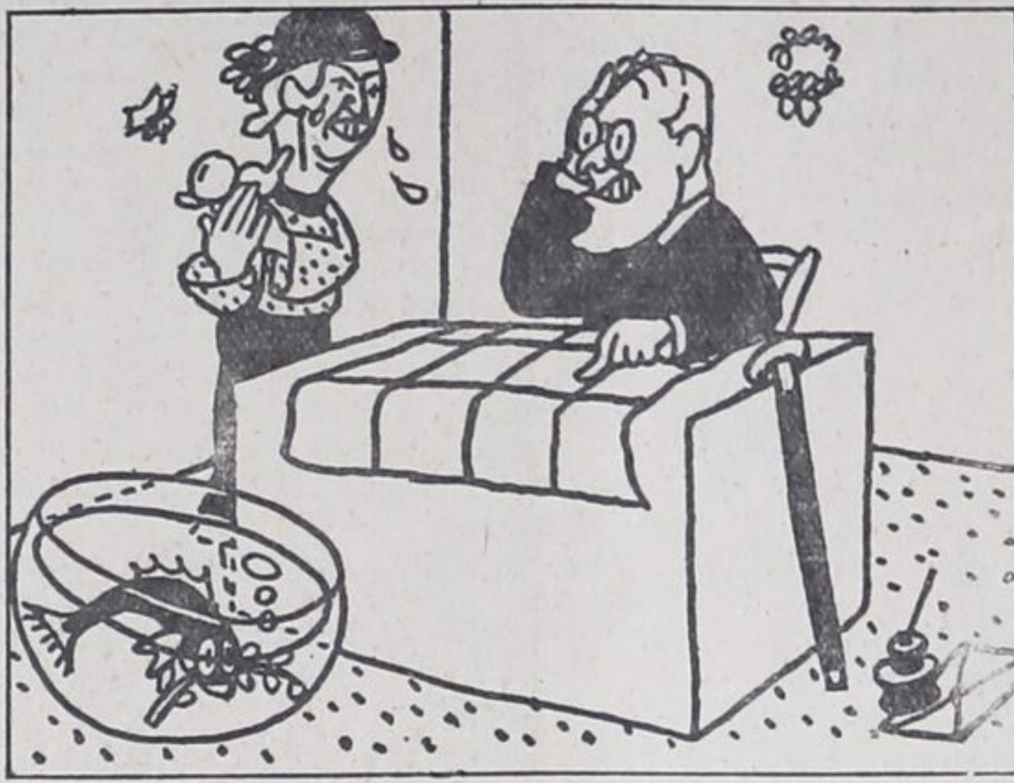
ROOSEVELT'S PEACE MESSAGE

Haileyburian, announces this week the opening of the Sutherland Printing House, in Kirkland Lake, will, no doubt, have success in his new venture. He has the best wishes of The Haileyburian and of all his well equipped with new machines. Haileybury friends.