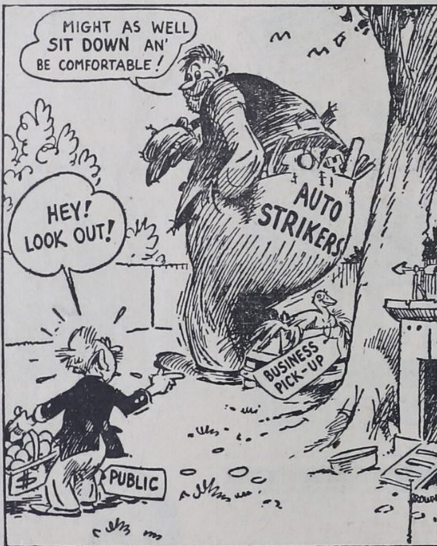
JUST AS SHE STARTED TO LAY GOLDEN EGGS