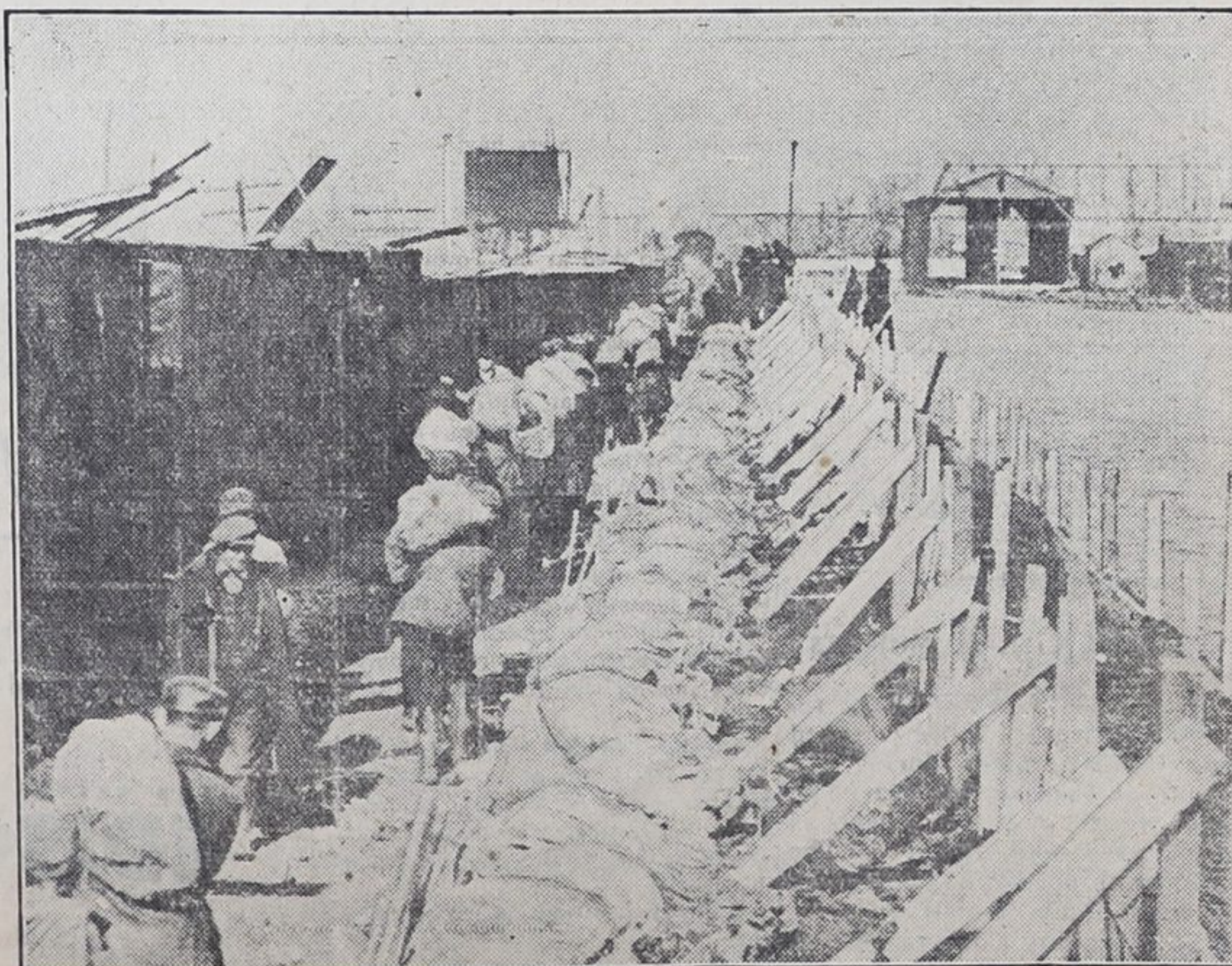
Protective breastworks of Cairo, guarding the city from waters of the Mississippi and Ohio rivers are strengthened by workmen as raging floods of the Ohio unite with those of 'Ole Miss.