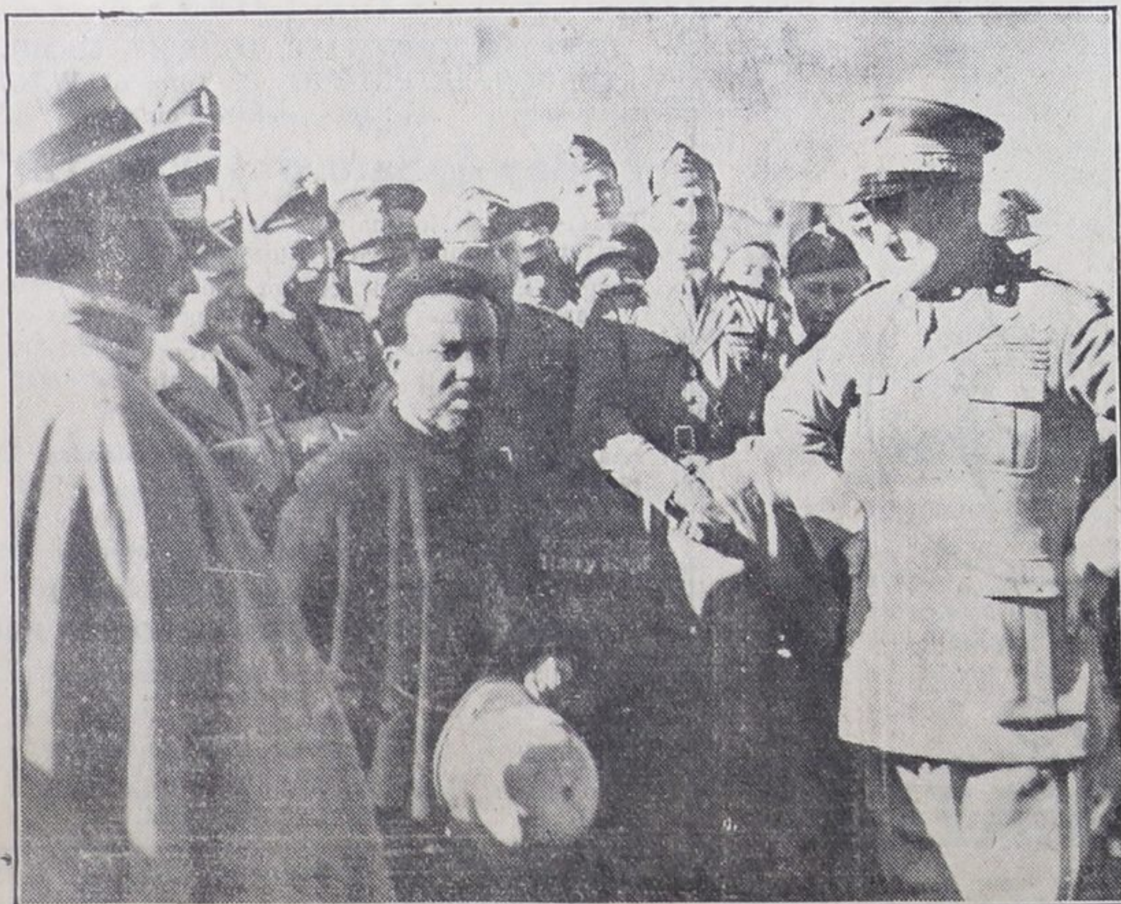
Our photograph shows the departure from the aviation camp of Addis Ababa of Ras Imeru, famous Ethiopian chief, who has at last been captured by the Italians near Cogeb on the borders of Gimma and Caffa.