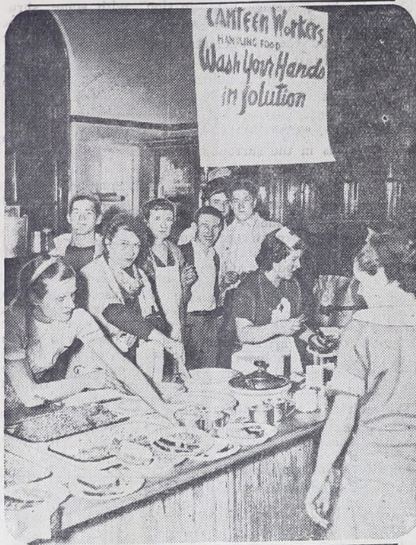
This sign above a Cincinnati emergency cafeteria, warning volunteers to wash their hands in solution, is graphic indication of the precautions taken to avoid a widespread epidemic as a result of unsanitary conditions following the flood.