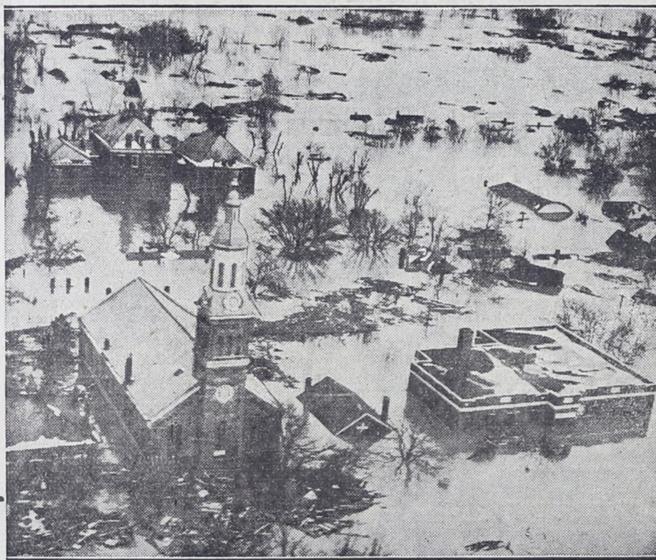
Their residents forced to flee for their lives before the rushing torrents of the Ohio river, these buildings echo hollowly to the battering forces of the floodtide as it swirls through the deserted streets of Lawrenceburg, Ind., above. One of the most severely stricken of cities along the Indiana border, this distillery centre suffered terrific losses because of its position at the juncture of the Ohio and Big Miami rivers.