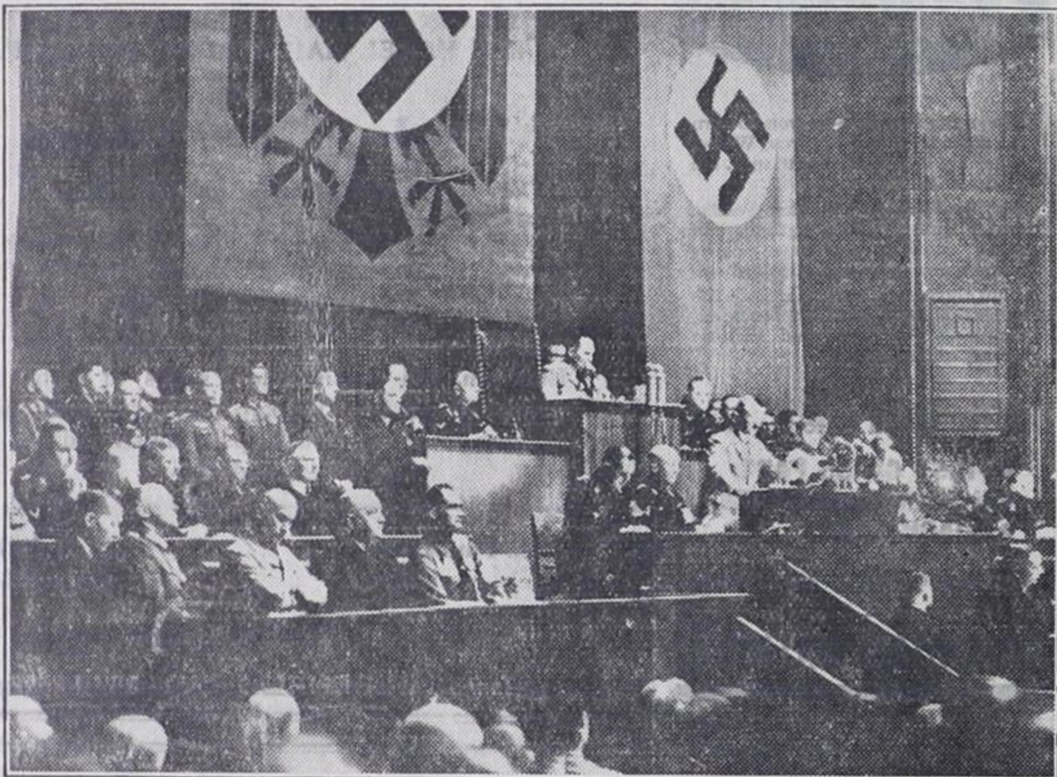
News from Berlin intimates that Adolf Hitler will abolish the Reichstag, or Parliament, of Germany, and in its place will establish a Council. This picture shows Hitler addressing the Reichstag at its last meeting.