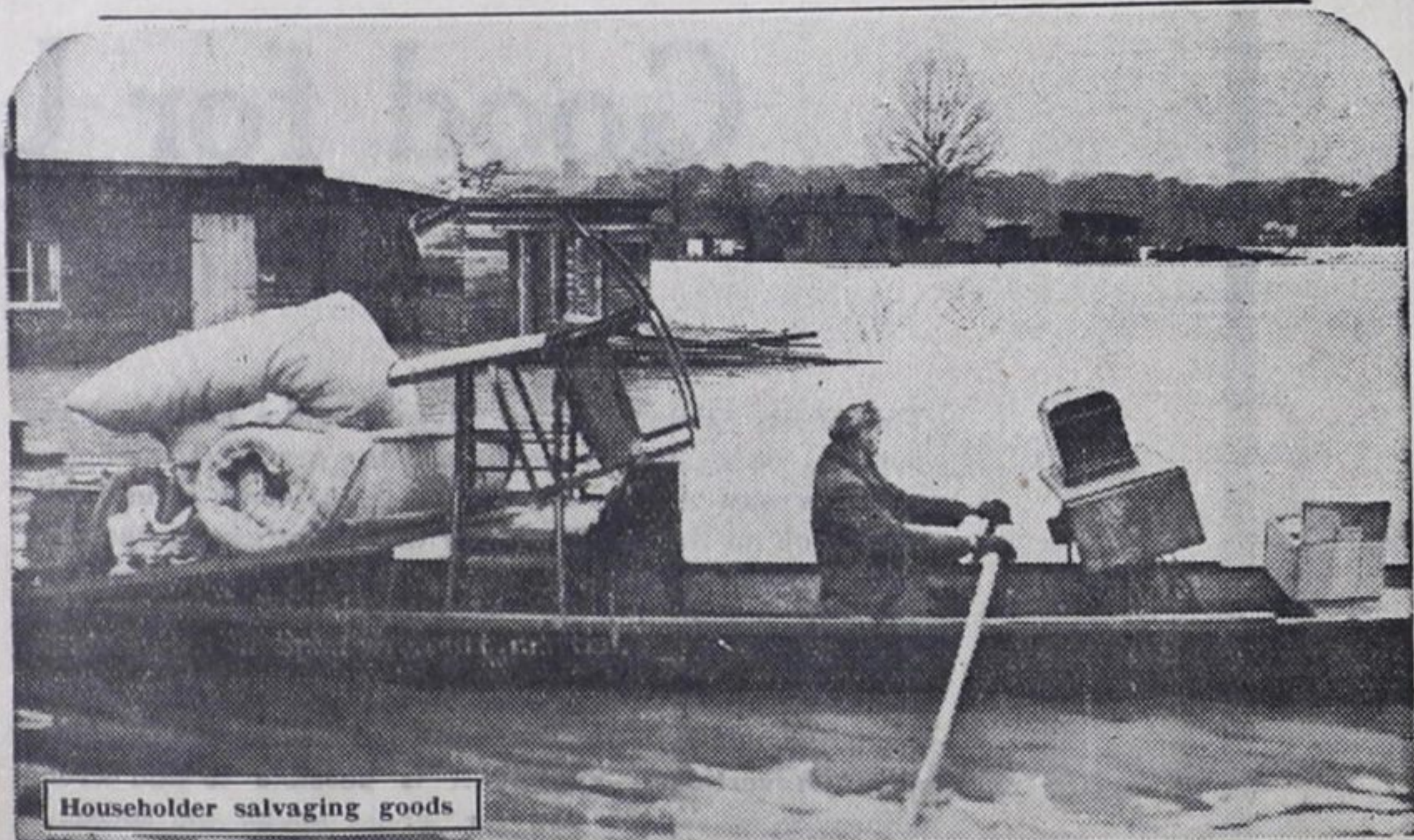
AS FLOOD WATERS RAGED THROUGH THE MIDWEST