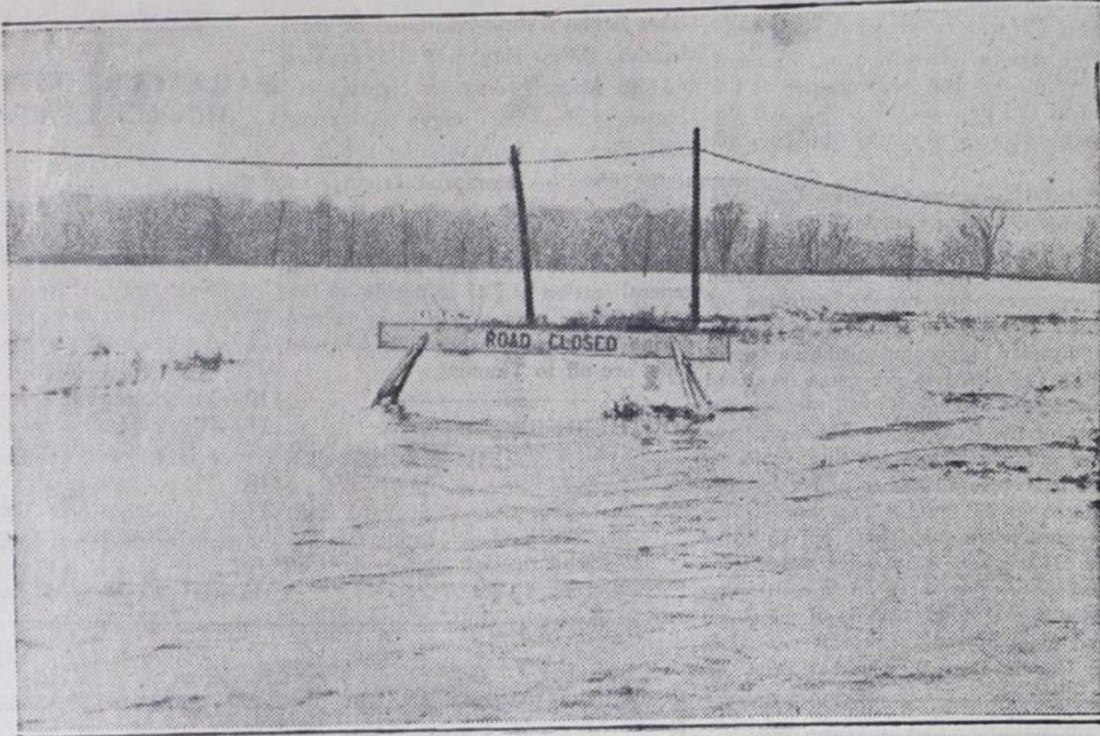
Motorists in the vicinity of Meadville, Pennsylvania, had better believe in signs for their own good unless they want to put pontoons on their automobiles. This scene was typical of conditions after creeks and rivers had overflowed their banks.