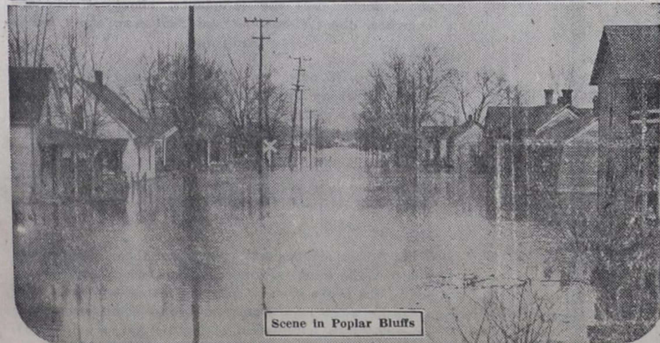
Scenes such as these were common in the midwest and central south as flood waters raged through widespread sections of the United States. Top, a householder at Louisville, Ky., salvaged some of his possessions after being forced to abandon his home; below, traffic problems were no worry in Poplar Bluffs, in Southern Missouri, where highways and sidewalks were inundated.