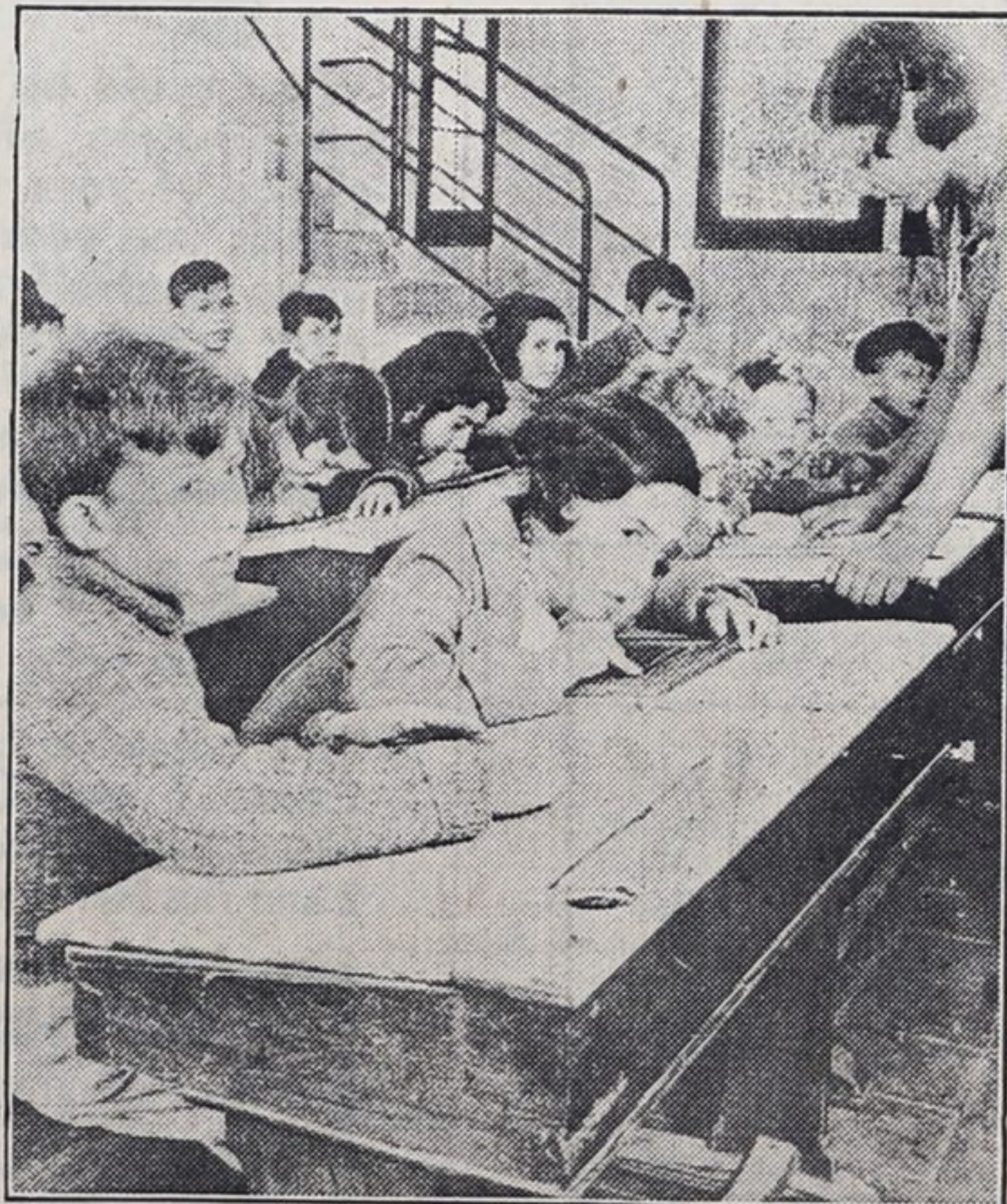
Looking more contented than they probably feel, these Spanish refugee children are shown in one of the classrooms in the Stadium at Barcelona, being cared for by the Friends' Service Council. Many of these children have lost their fathers and some are homeless.