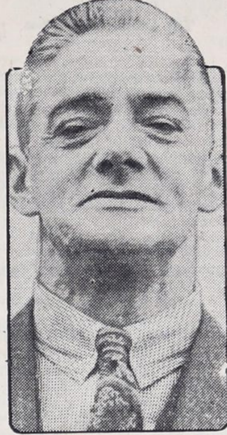
The latest picture of Baron Nuffield, British automobile magnate and well known public benefactor, whose latest civic act is the establishment of a $10,000,000 fund to aid the "black areas" of the British Isles. In announcing his gift, which brings his total public benefactions to $35,000,000 in the past ten years, Baron Nuffield explained it as a practical expression of goodwill toward King George VI.