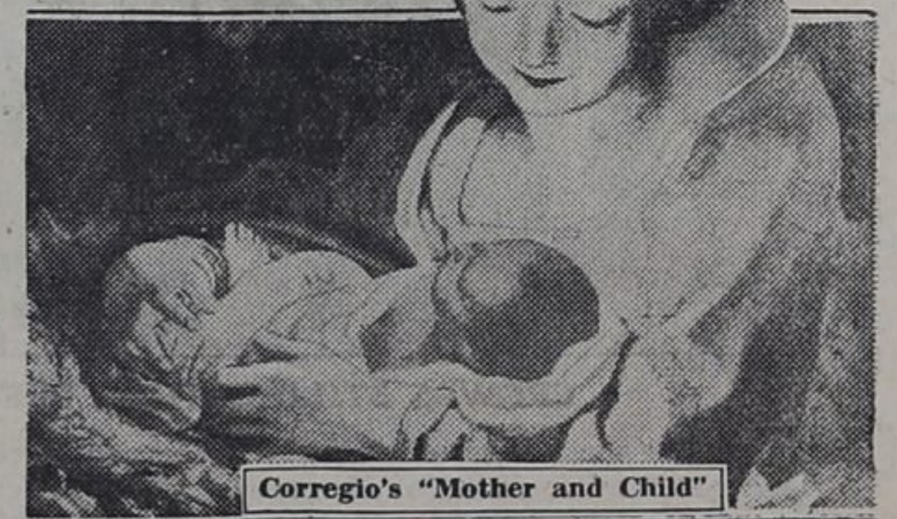
Corregio's "Mother and Child"