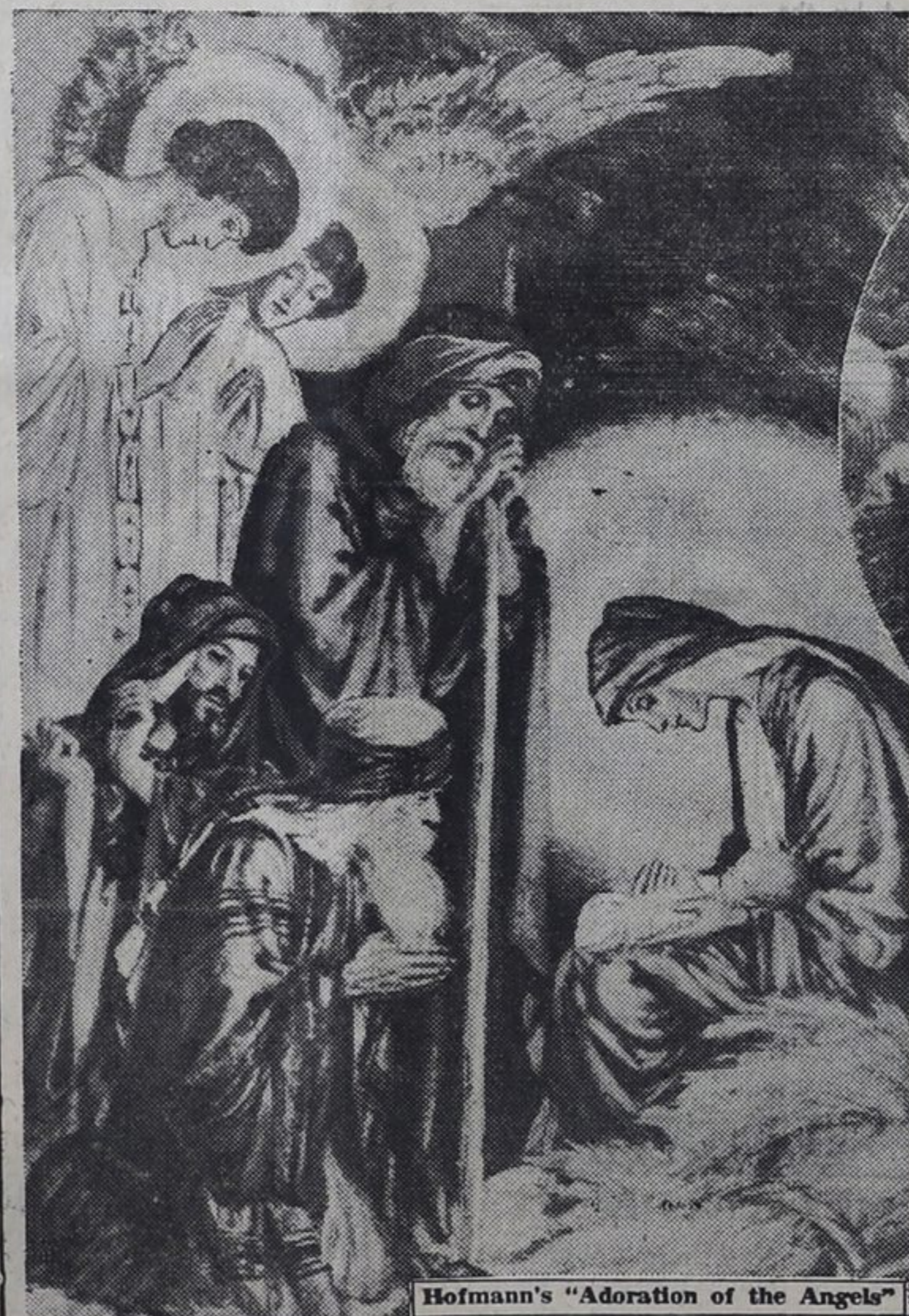
Hofmann's "Adoration of the Angels"