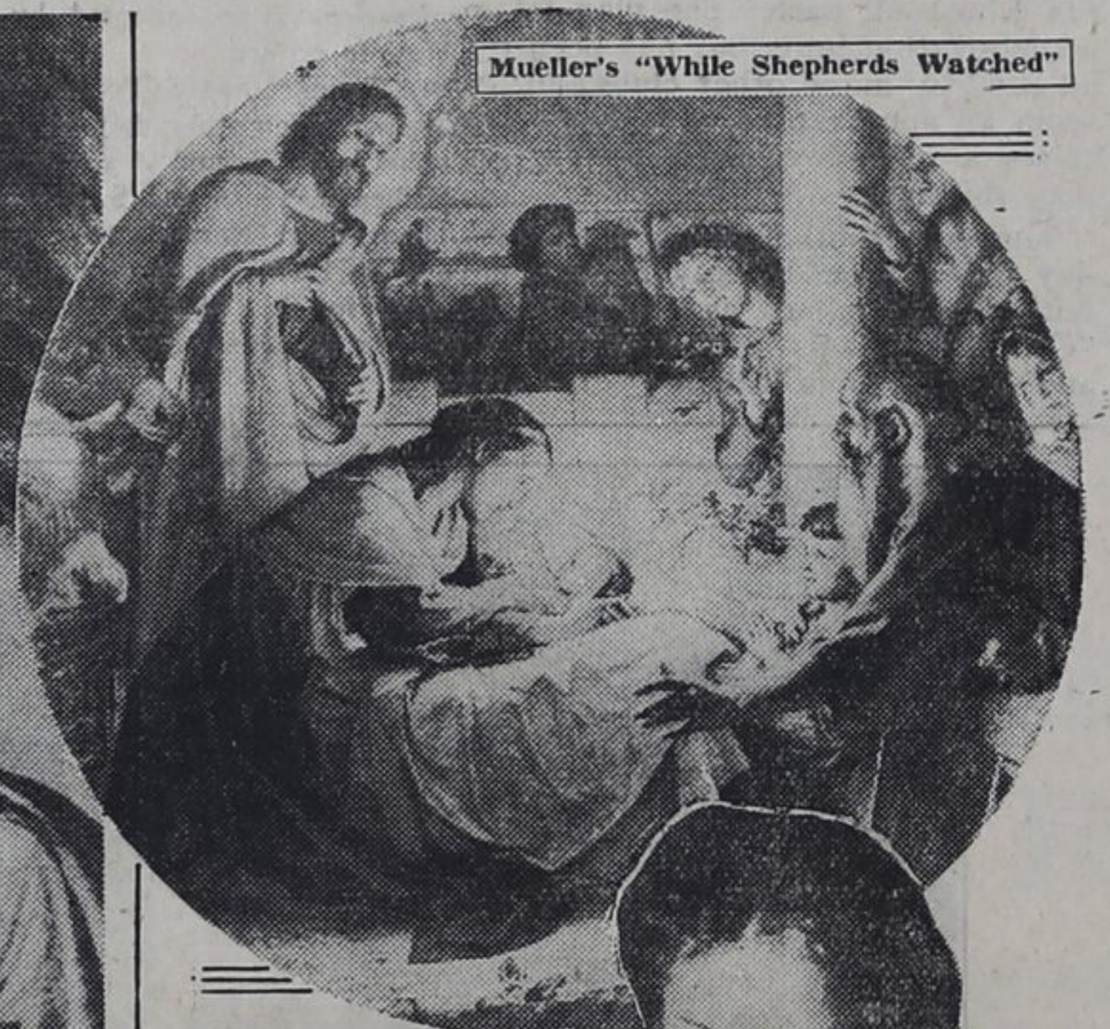
Mueller's "While Shepherds Watched"