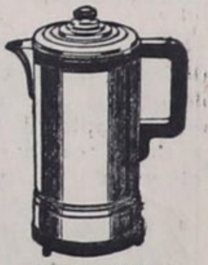
PERCOLATOR $3.30 up