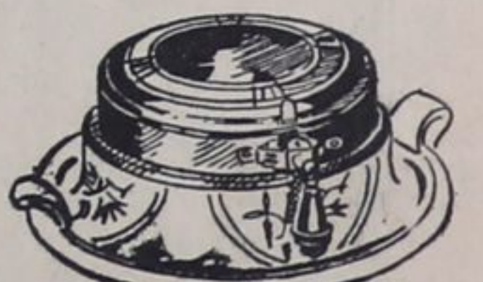
WAFFLE IRON $3.95 up

There is the widest possible selection of electrical gifts — smart, attractive, year-round useful individual gifts — priced from as little as $3.30 up. Besides those shown which make ideal gifts for wife, mother, sister or friend, you can choose from air heaters, immersion heaters, toasters, curling irons, vibrators, electric razors and numerous others. Simplify your Christmas shopping the electrical gift way.