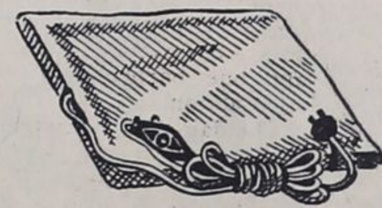
HEATING PAD $3.95 up