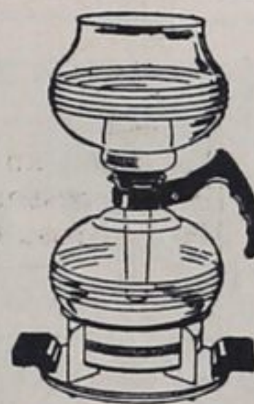
COFFEE MAKER $4.95 up