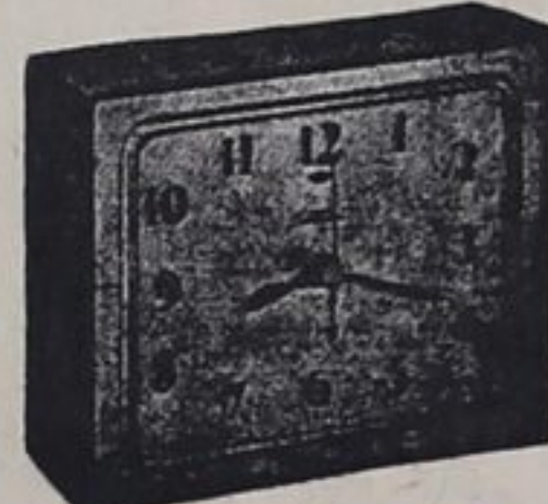
ELECTRIC CLOCK $4.95 up