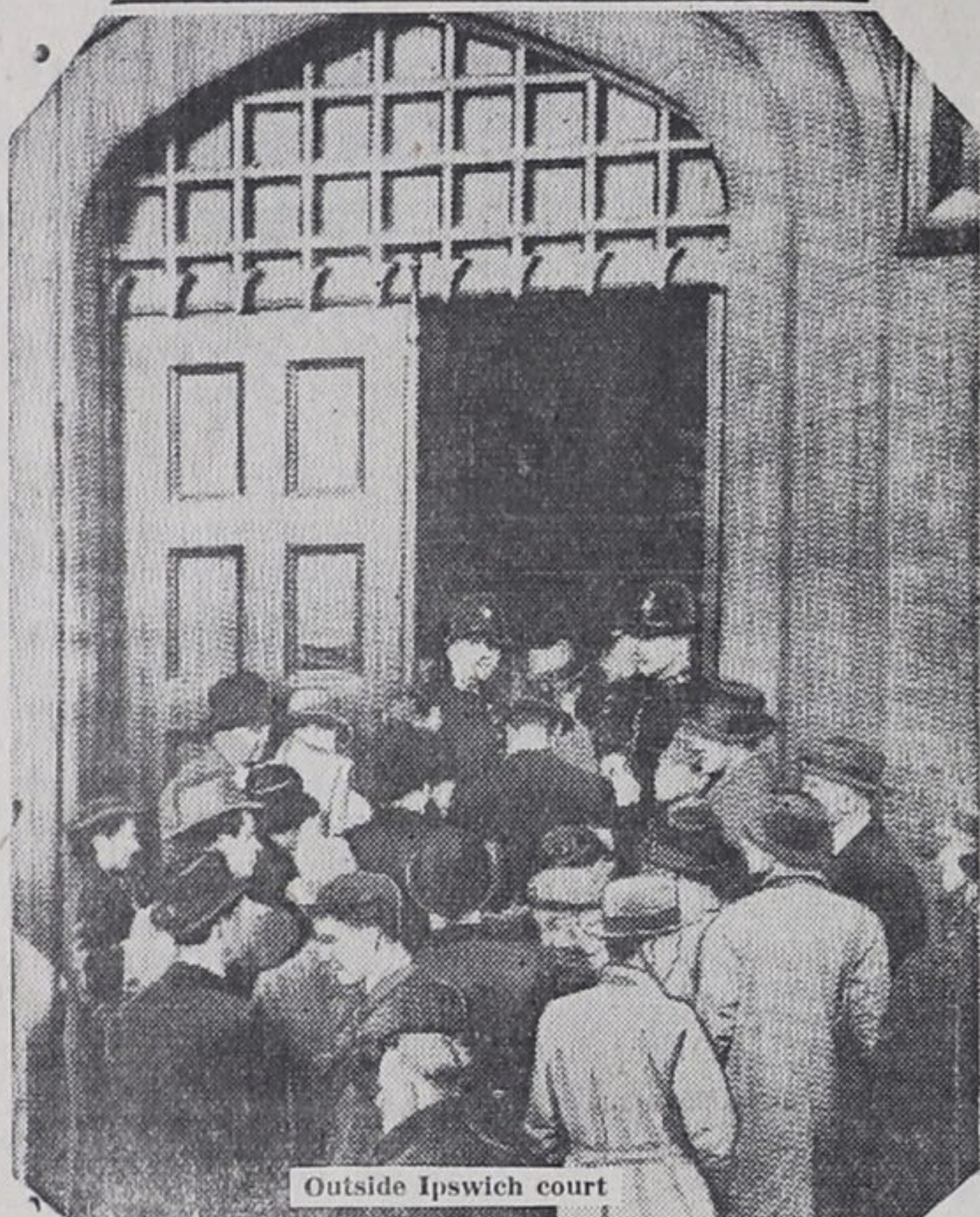
Outside Ipswich court

Part of the crowd attempting to gain access to the courtroom at Ipswich, England, for the Simpson divorce case. This picture was sent by radio from London to New York.