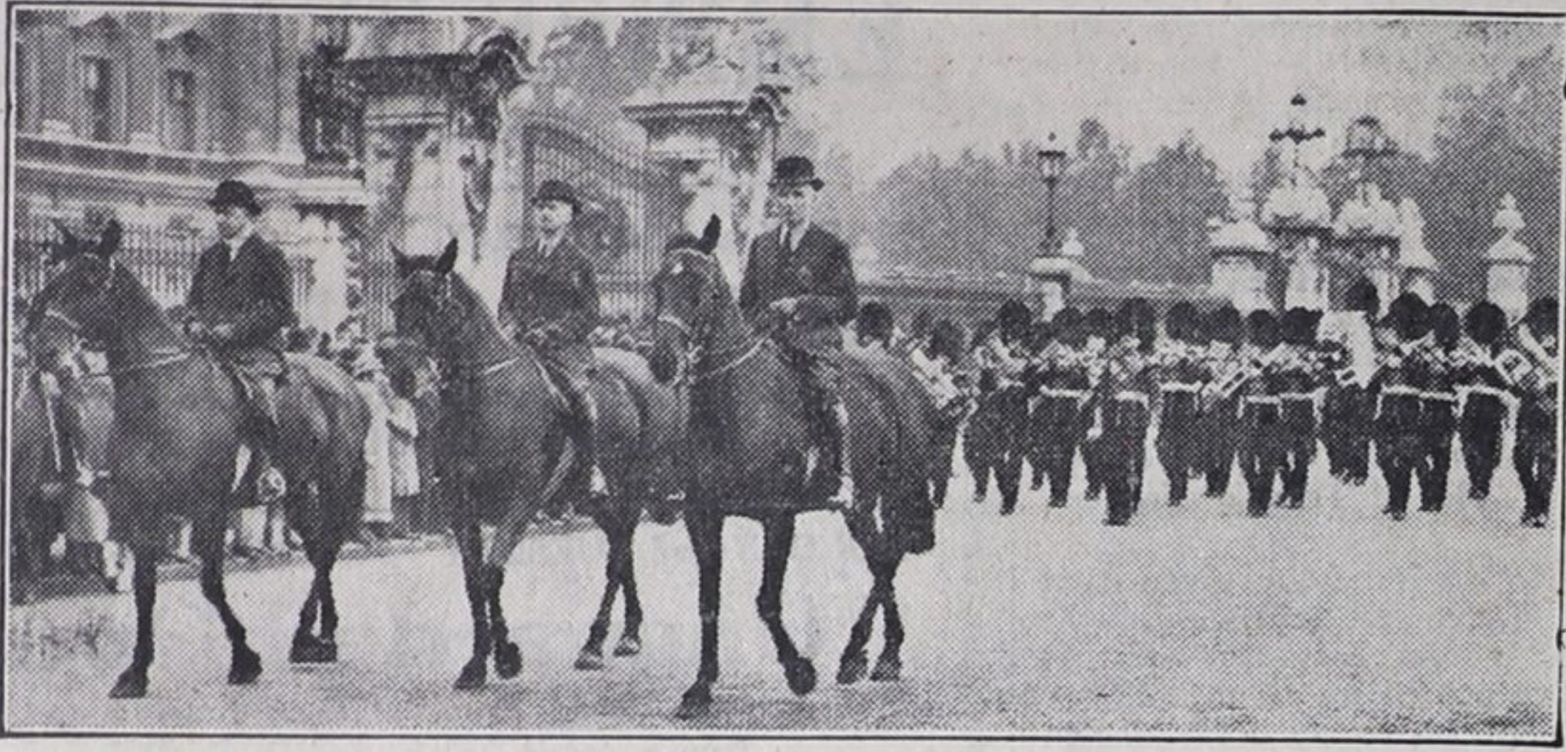
Horses from the King's stables, in front of the Guards' Band, leaving Buckingham Palace in a course of training to accustom themselves to music in preparation for the ceremonies in connection with the Coronation. The horse on the left is one of the King's personal mounts.