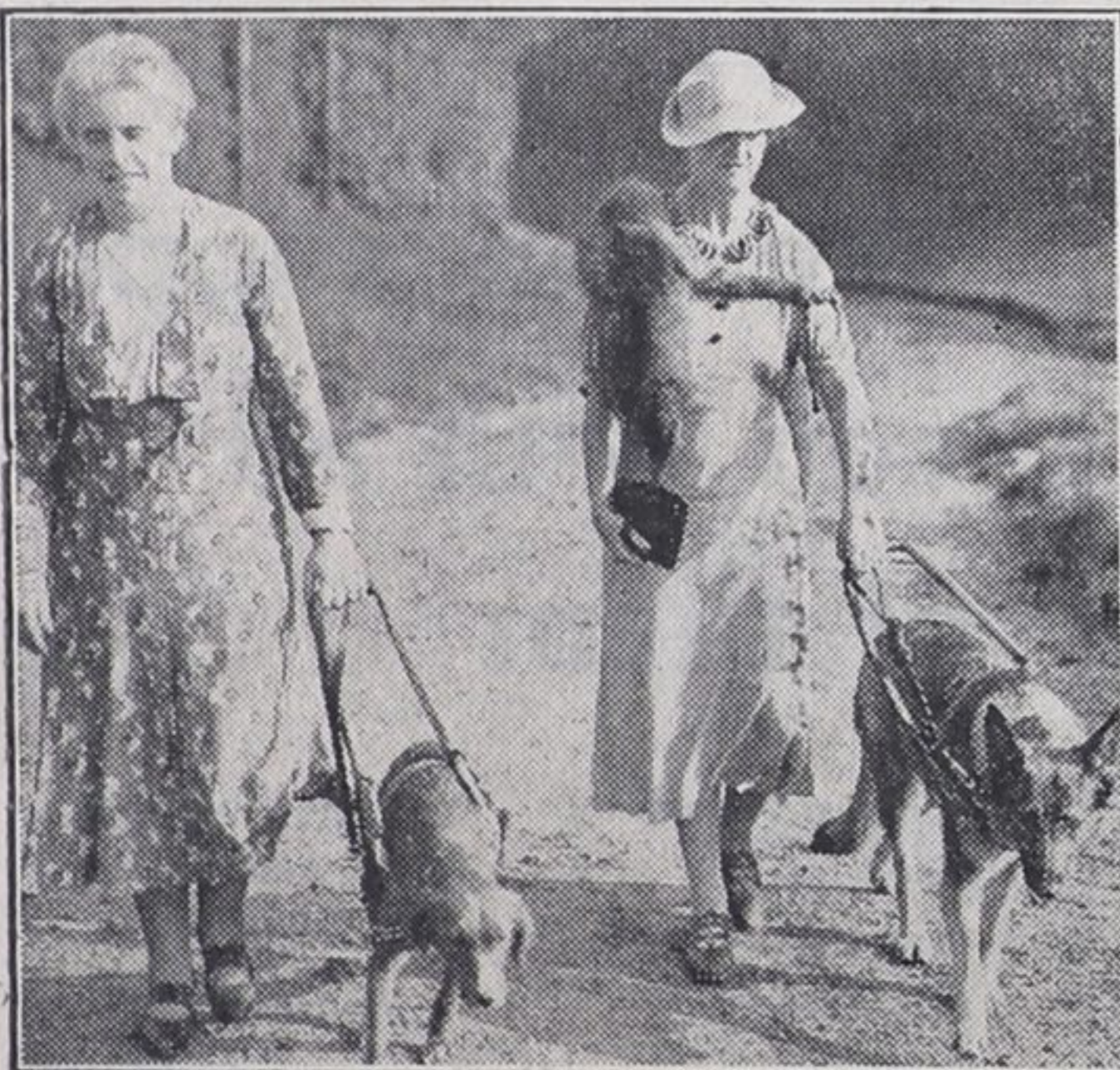
The object of the Guide Dogs for the Blind Association is to provide trained dogs to enable blind persons to travel with ease and confidence. Our picture shows two dogs leading their blind mistresses along an English country road. The dogs are trained to heed traffic signals and usually take about three months to train.