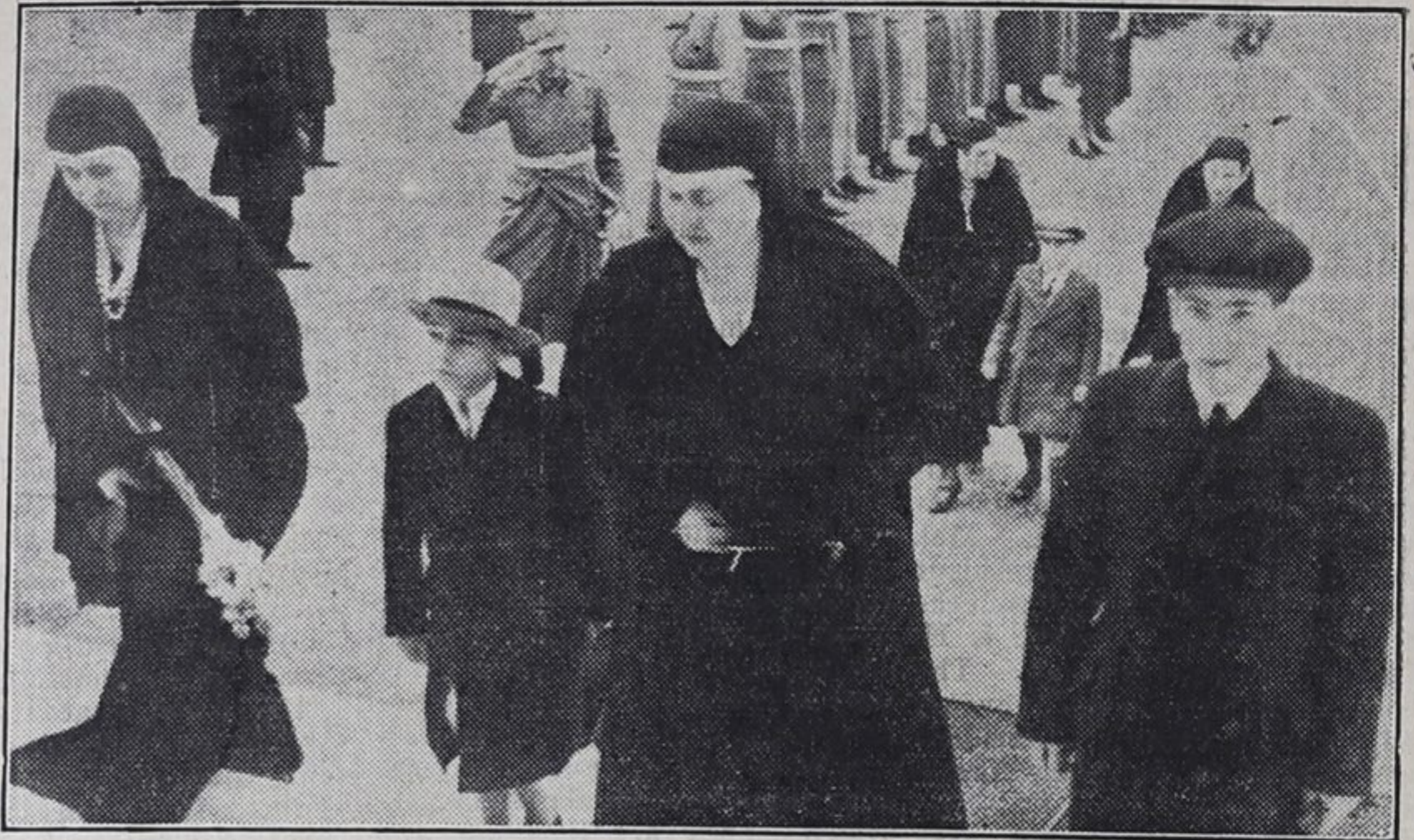
The boy King Peter of Yugoslavia (right); his mother, his brother, Prince Tomislave, and (left), his grandmother, Queen Marie of Roumania, visiting the mausoleum at Oplenatz on the anniversary of his father's tragic death.