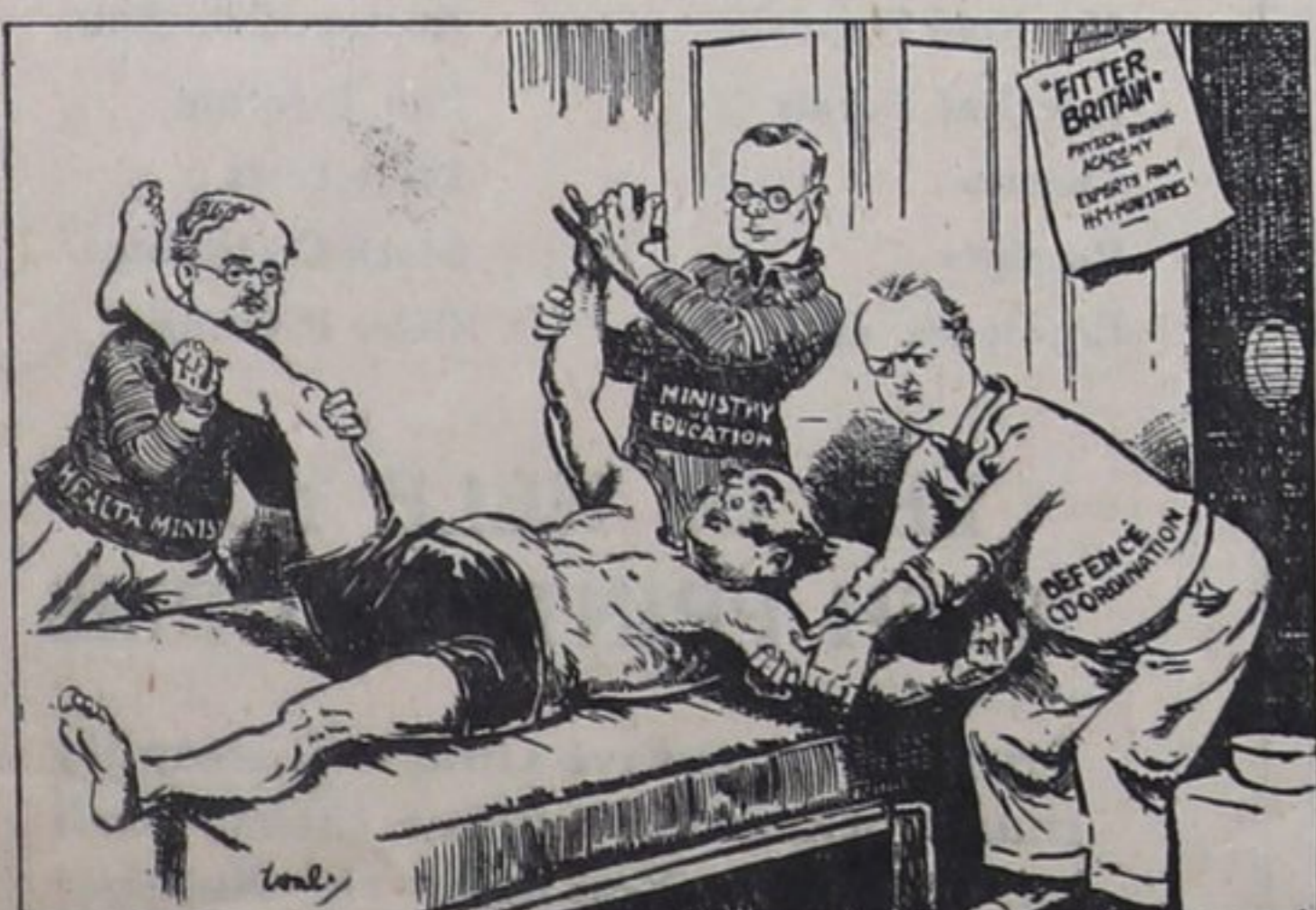
JOHN BULL: "Don't spare me, lads! I know I've been slacking." (Plans are to be placed before Parliament next session for making "Britain fitter". There will be a wide extension of facilities for physical exercise, and gaps in existing health services are to be filled.)