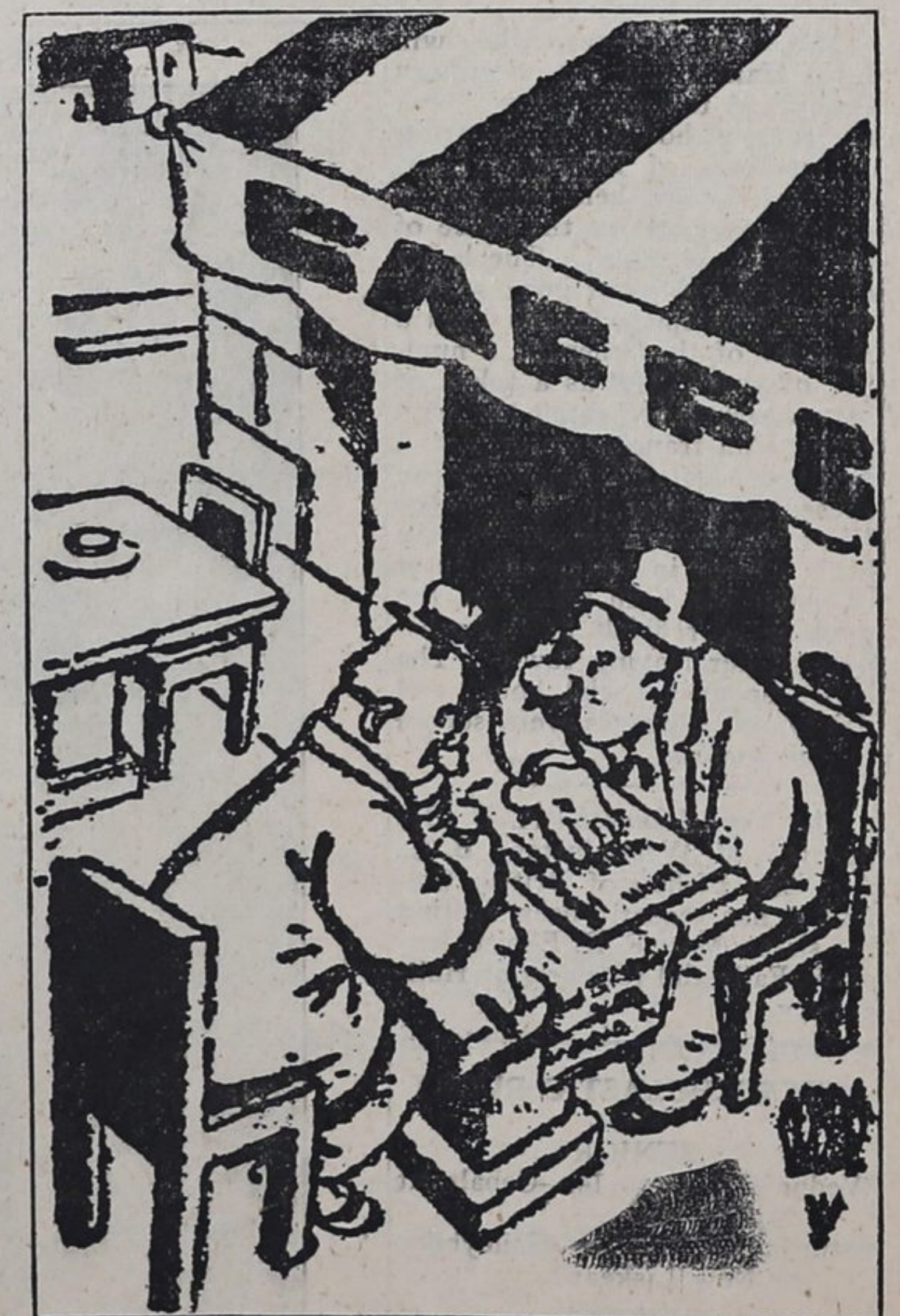
"When will this armament race end?" "When each nation has twice as many as the other." —From "Ahorá", Madrid