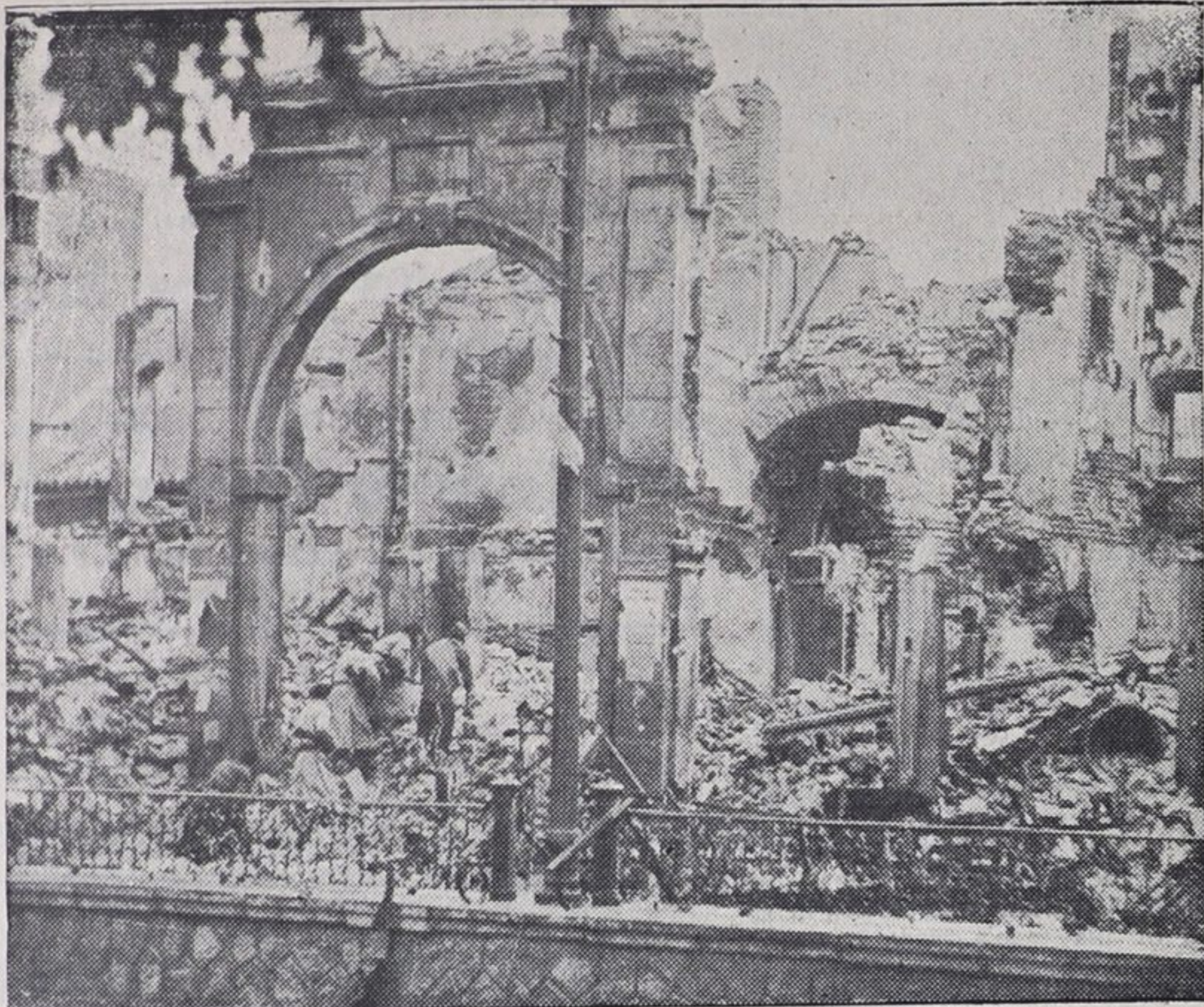
This is what the historic Alcazar fortress in Toledo looked like, after seven weeks of battering by shells, bombs, and mines. Strangely enough only 80 persons were killed outright and about 1,120 came out alive, although hundreds of them were wounded.