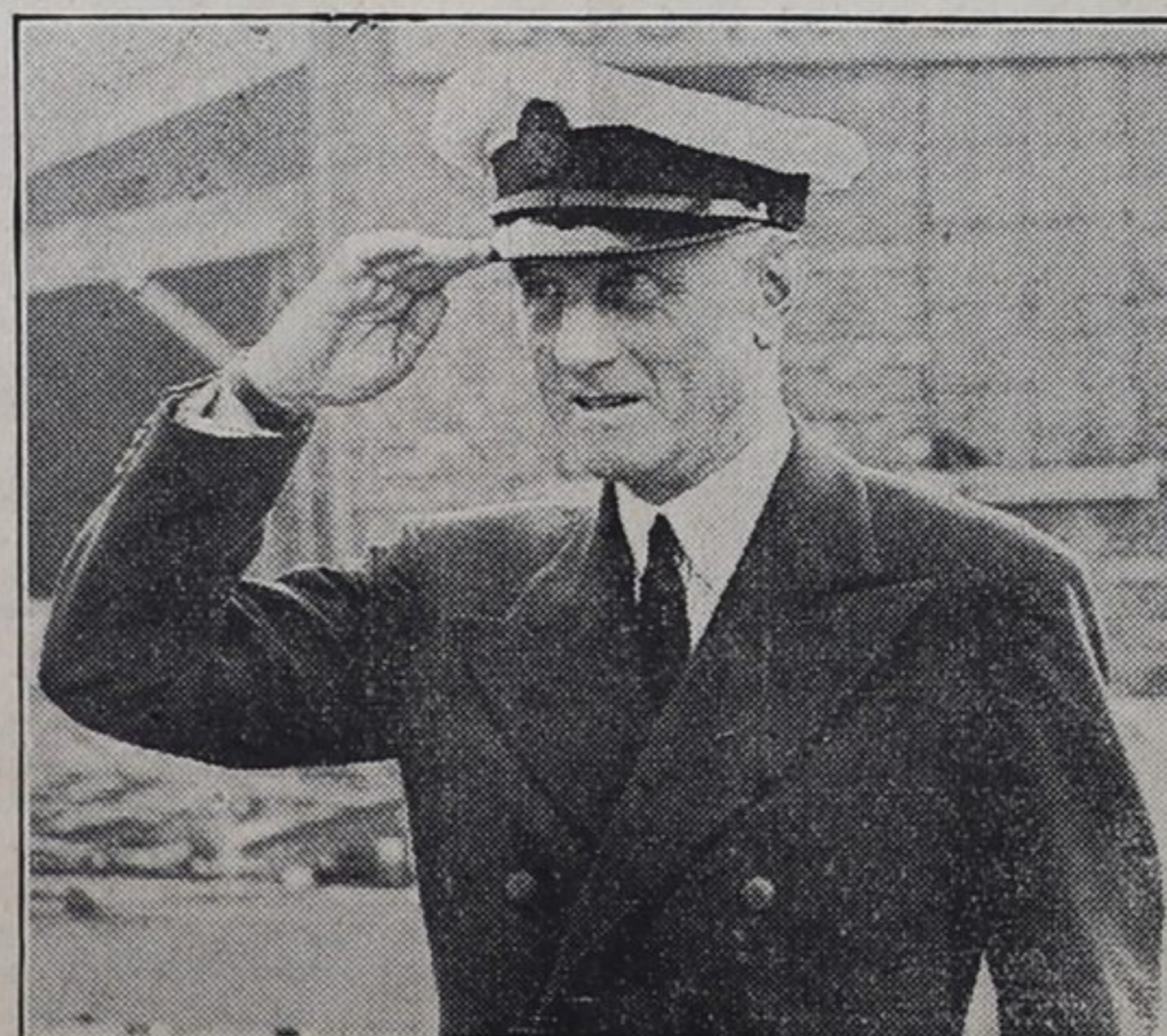
Sir Samuel Hoare, coming ashore at Portsmouth after inspecting the Mediterranean fleet—an inspection to which the Italian press ascribed very ulterior motives.