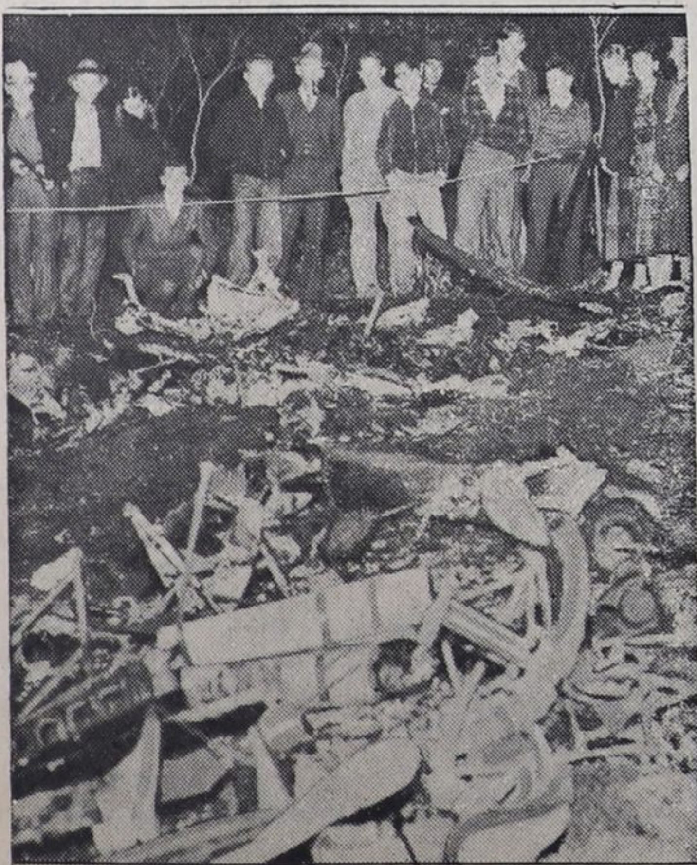
Trying to accommodate its pace to that of a streamlined train speeding 100 feet below it, a cabin plane manned by photographers taking moving pictures of the train crashed in a field near Naperville, Ill., killing its four occupants. This photo shows all that remained of the plane.