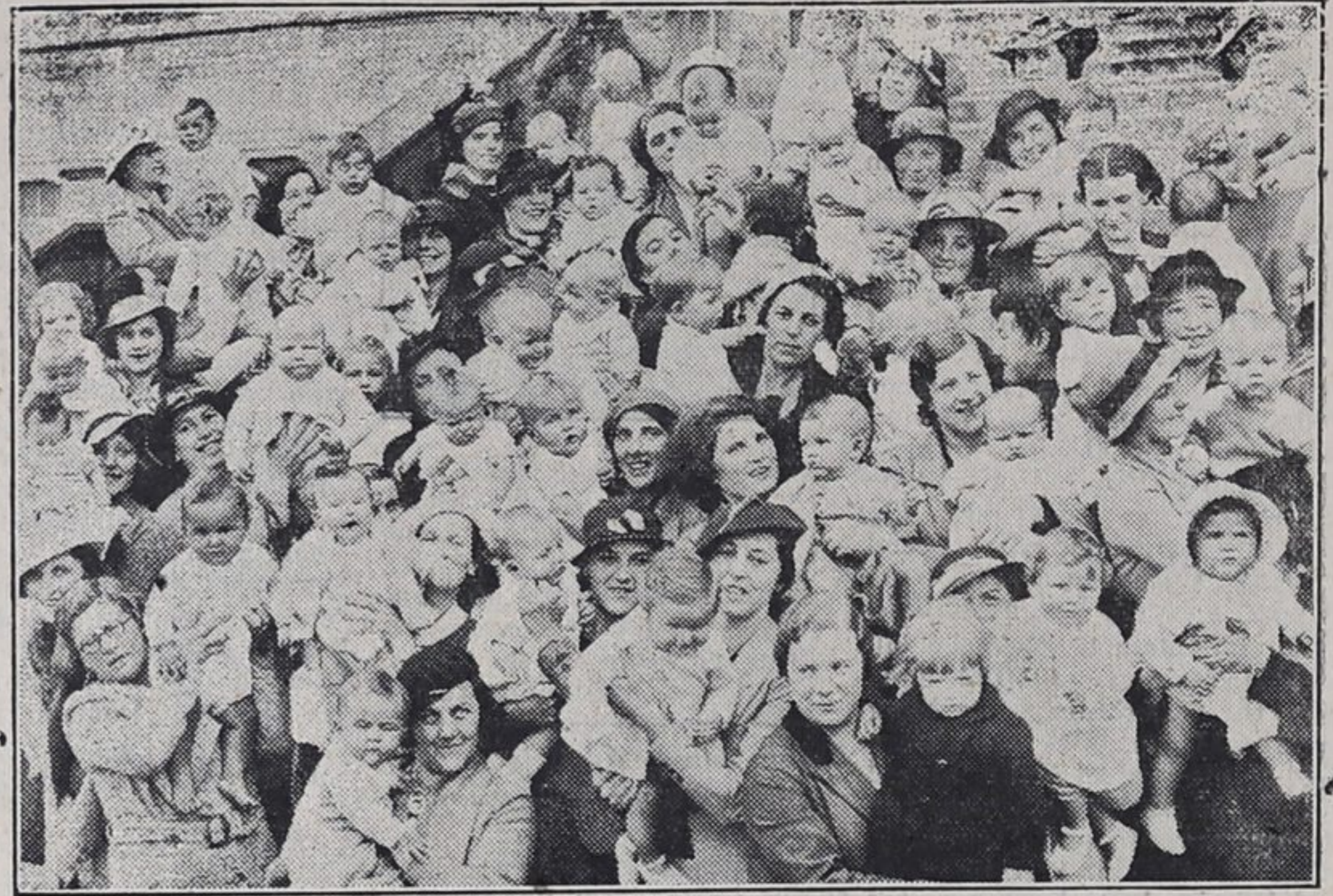
Owing to a hitch in the plans for the National Baby Show at Crystal Palace, London, England, only one doctor was engaged to act as judge, but there were 25,000 competitors. Eight additional doctors were quickly secured and the police also assisted.