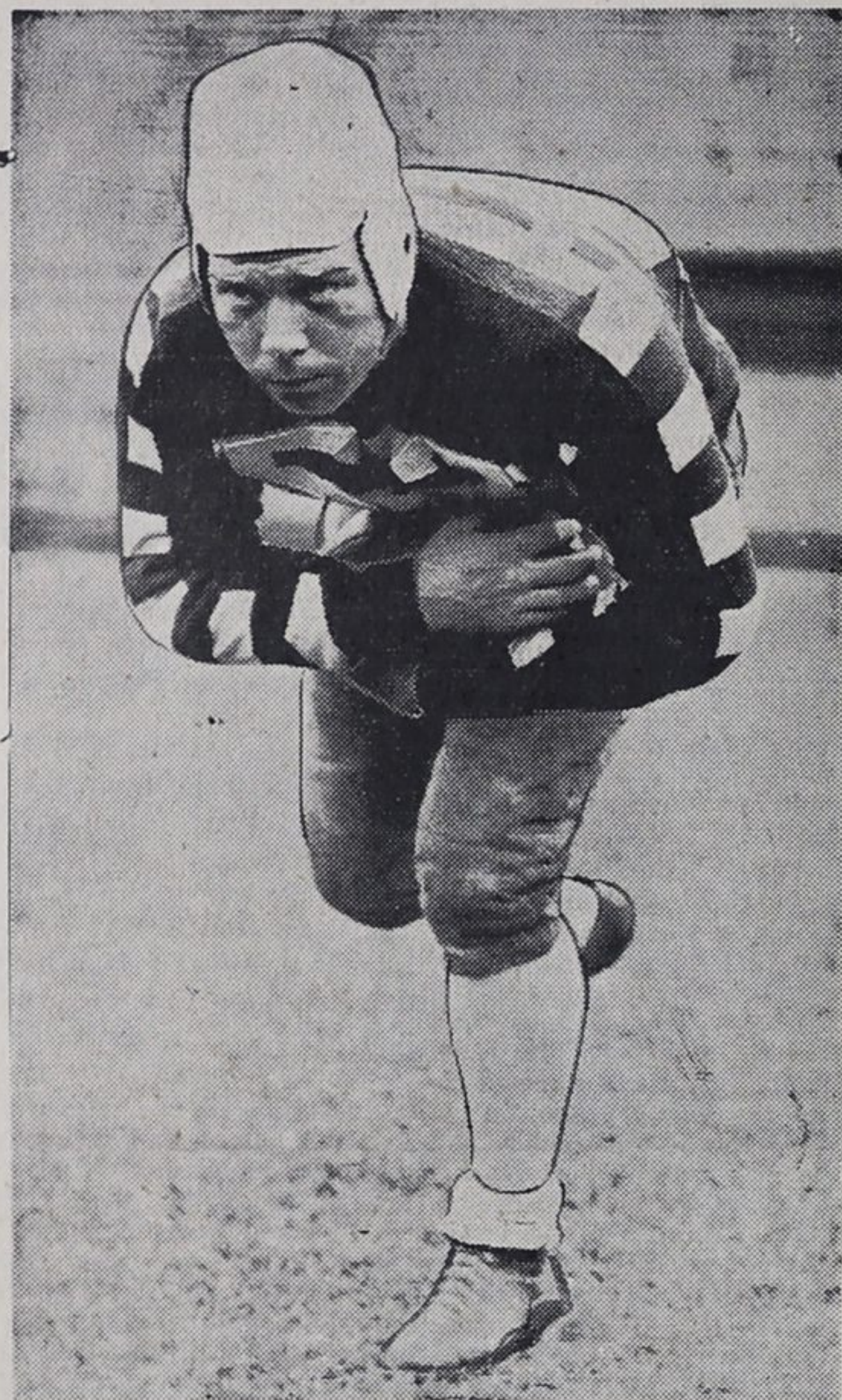
Red Storey, husky 180-pound halfback rookie on the Argo line-up, who is starting his first season in senior company. He is a Barrie boy and is said to have abundance of speed and strength.