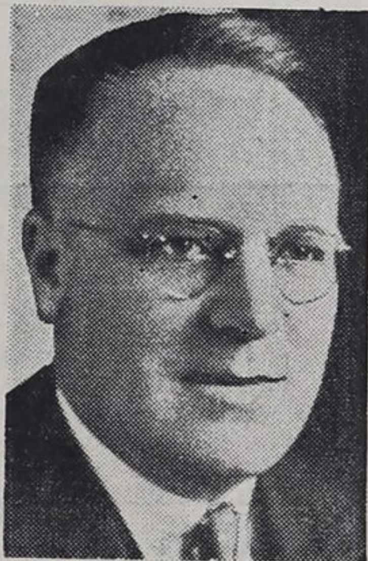
Assistant Deputy Minister of the Interior, who will have charge of the Lands, Parks and Forests unit of the new Department of Mines and Natural Resources which is being set up at Ottawa