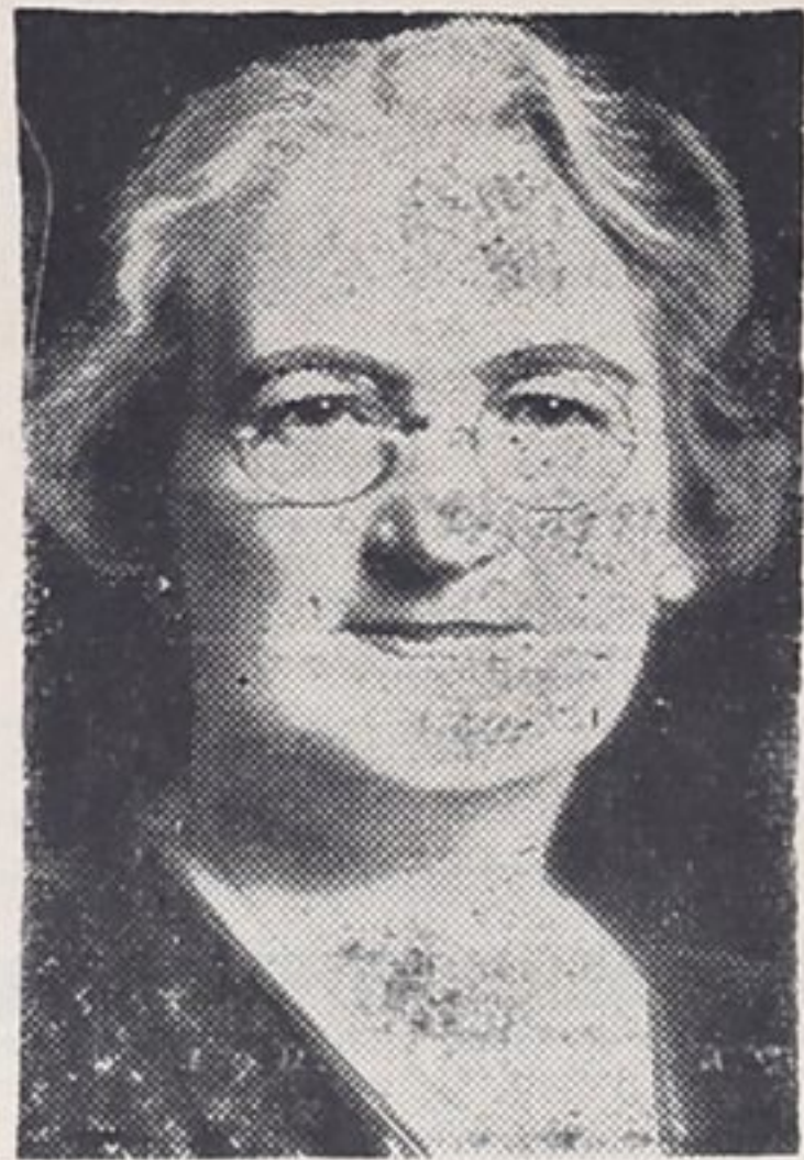
Nellie McClung, Canadian author, who has been appointed a member of the new Board of Governors of the Canadian Broadcasting Corporation