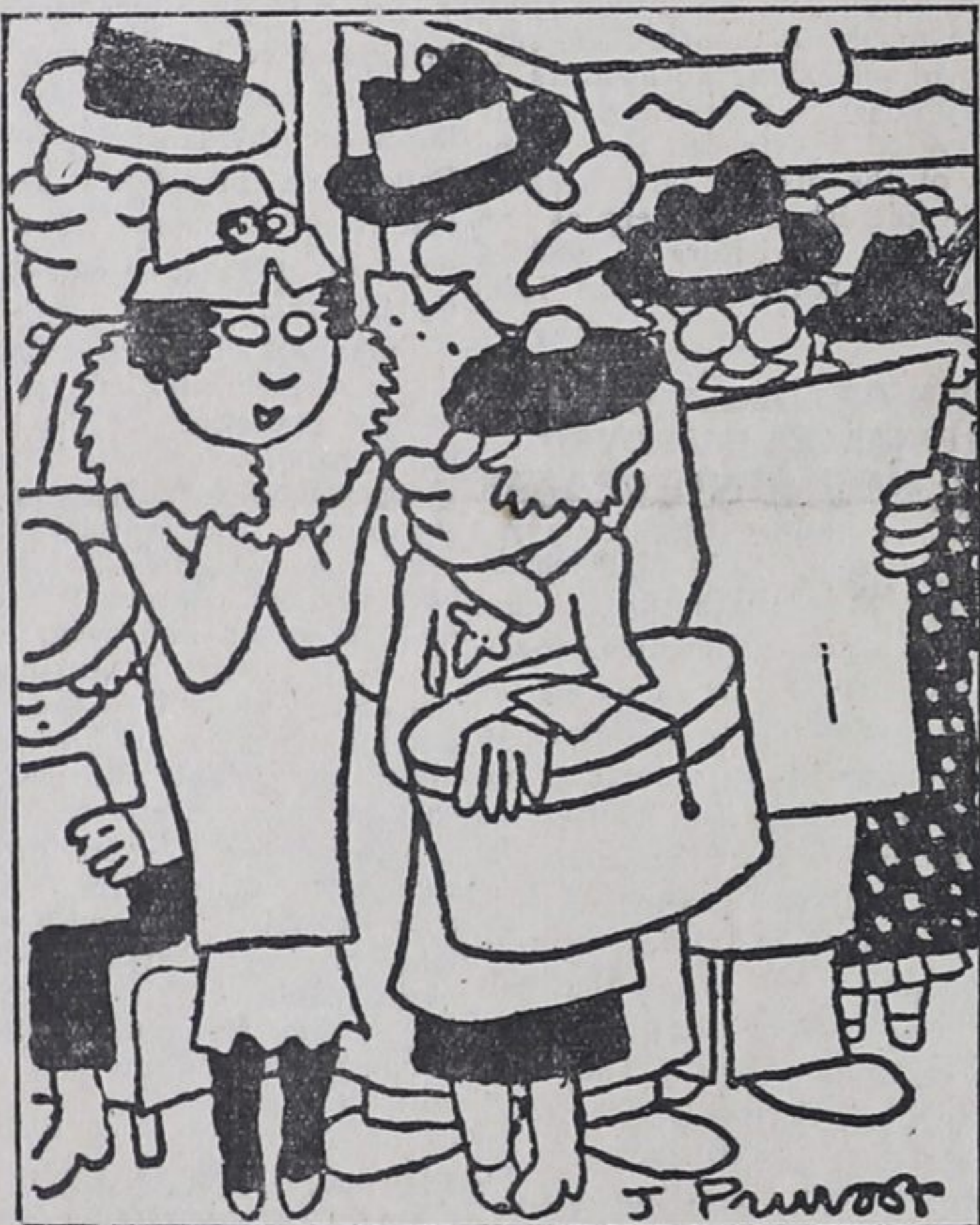
PARIS LAUGHS AT THE STRIKERS "Seven-thirty this evening? Can't, I'm afraid. I have a revolution to attend." —From Le Canard EnRchainne, Paris.

GENERAL ELECTRIC RADIOTRONS CANADIAN GENERAL ELECTRIC CO., LTD.