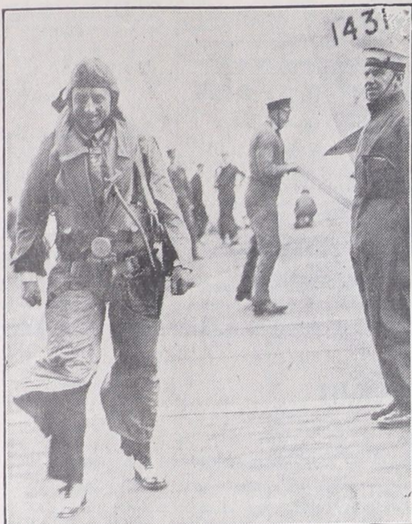
Sir Samuel Hoare, recently appointed First Lord of the Admiralty, paid his first official visit to the Fleet recently when he flew from Hendon and alighted on the deck of the aircraft carrier "Courageous", which was cruising off the Isle of Wight. Above we see Sir Samuel after his plane had landed on the boat.