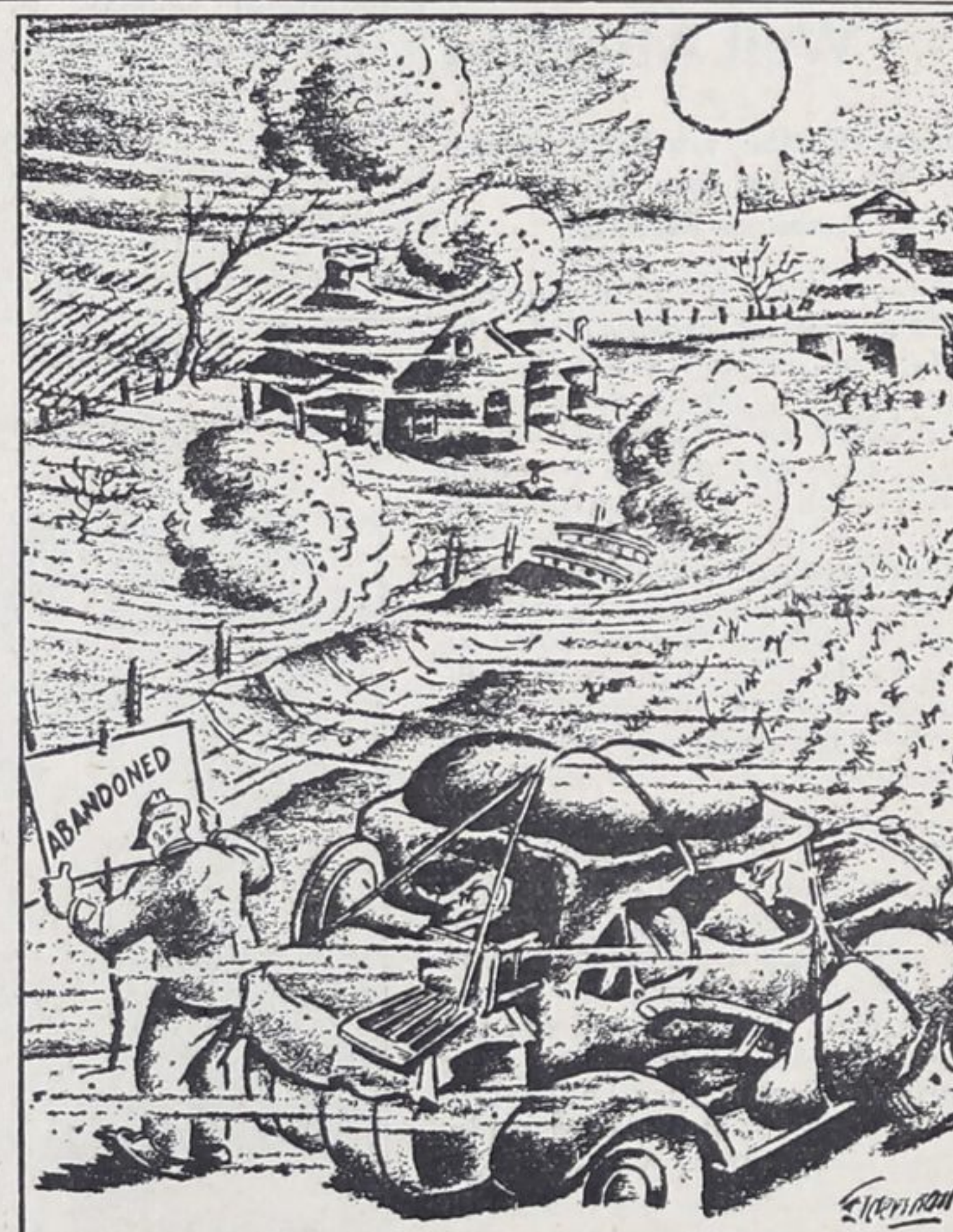
THE COVERED WAGON —Elderman in the Washington Post