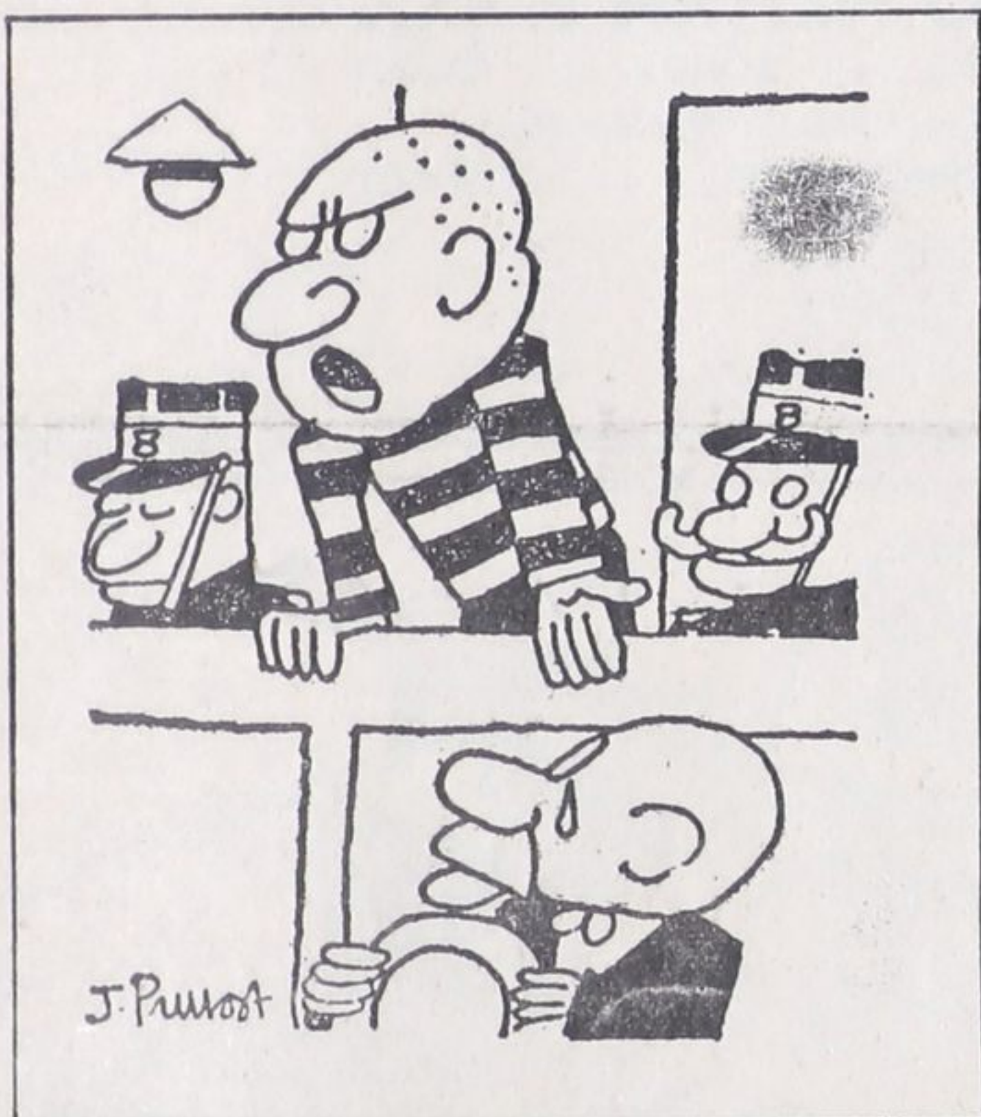
(A French view of the Italo-Ethiopian Episode) THE ROMAN MANNER

Accused: "You expect me to sit in the same room as the man whose watch I've just pinched!"—Le Canard Enchaîné, Paris—