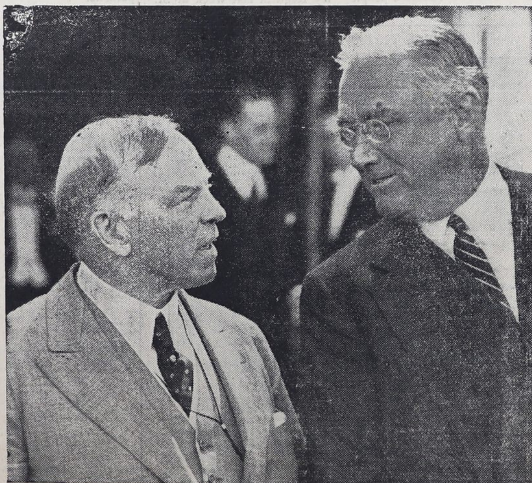
Rt. Hon. W. L. Mackenzie King, and President F. D. Roosevelt hold an animated conversation. Quebec gave an enthusiastic reception to the distinguished visitor last week.