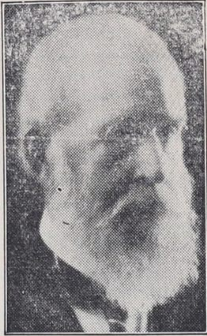
Sir William Mulock, Chief Justice of Ontario, who, at the age of 92 years, has retired from public life