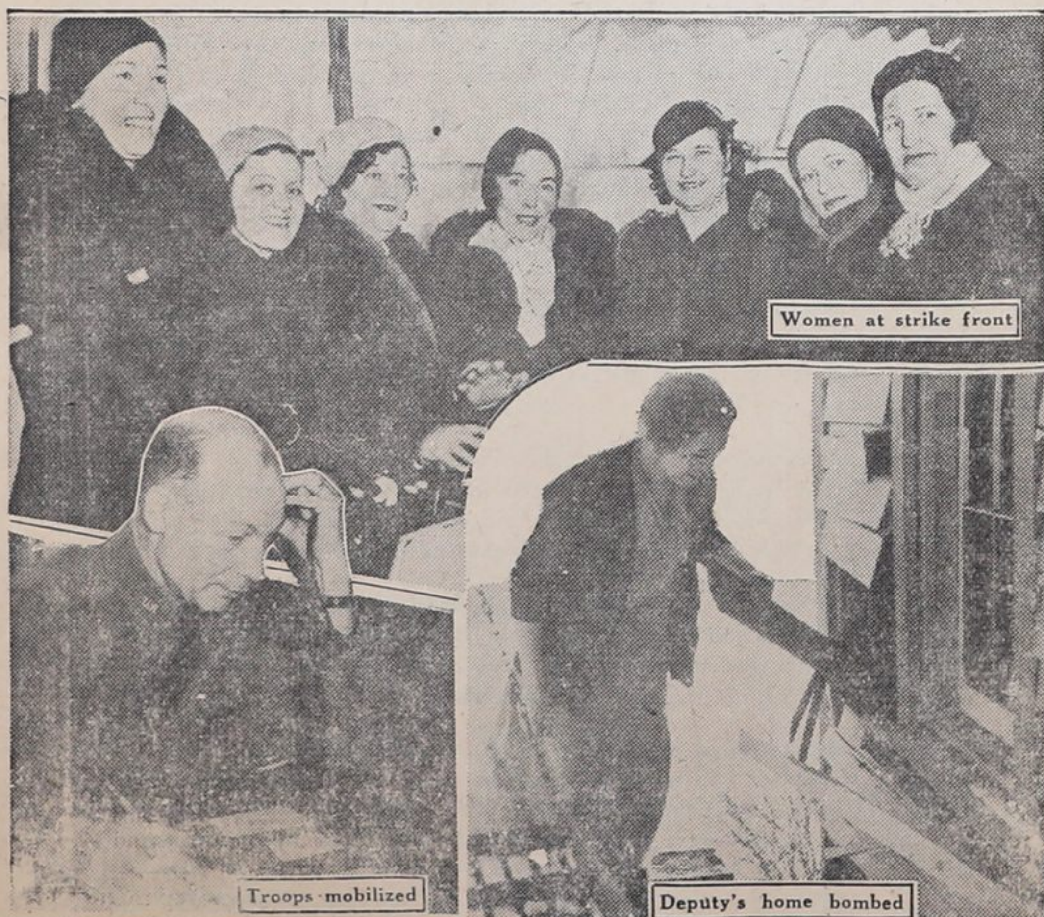
Women at strike front