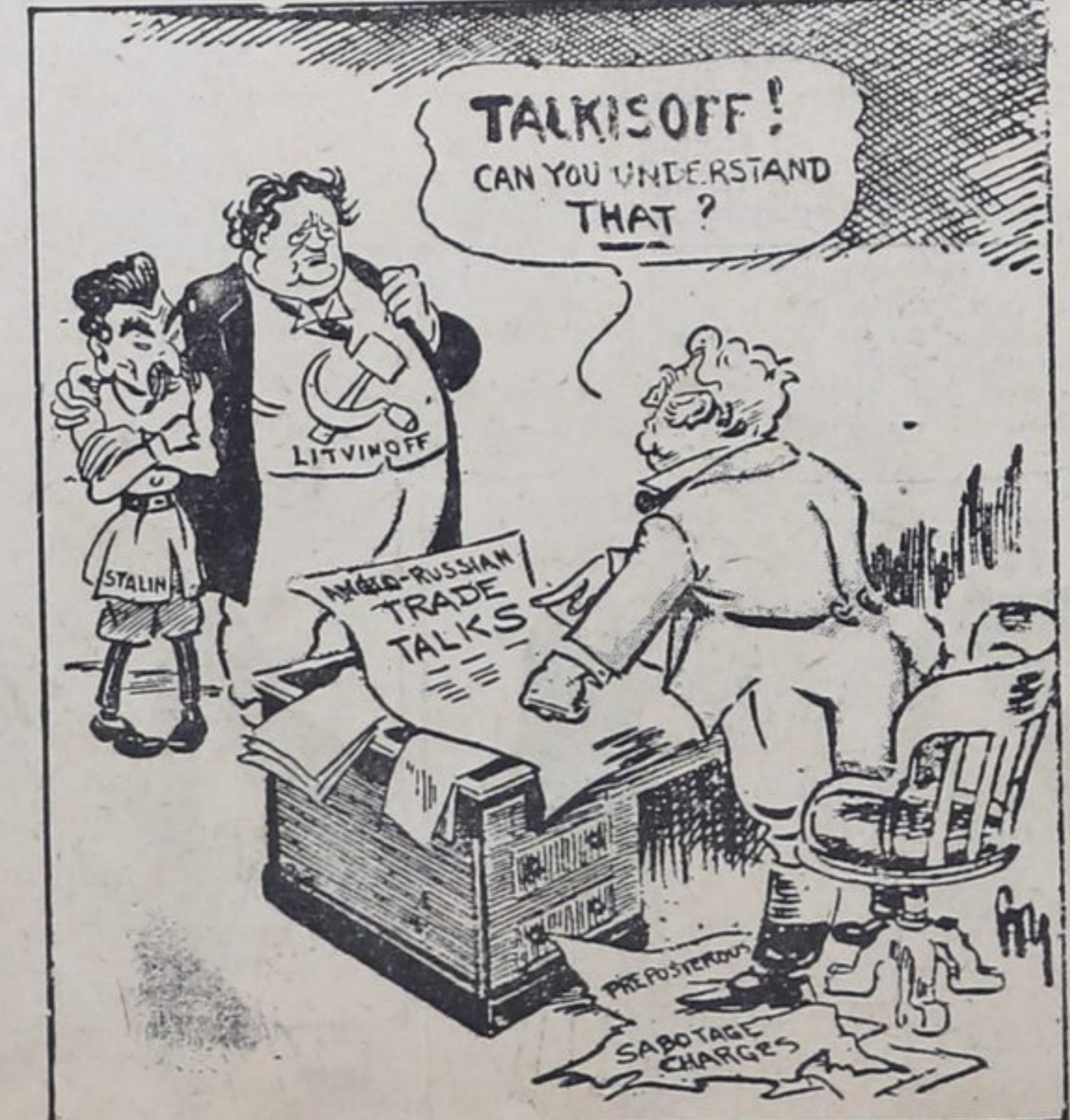
Perhaps That's a Word He Can Comprehend