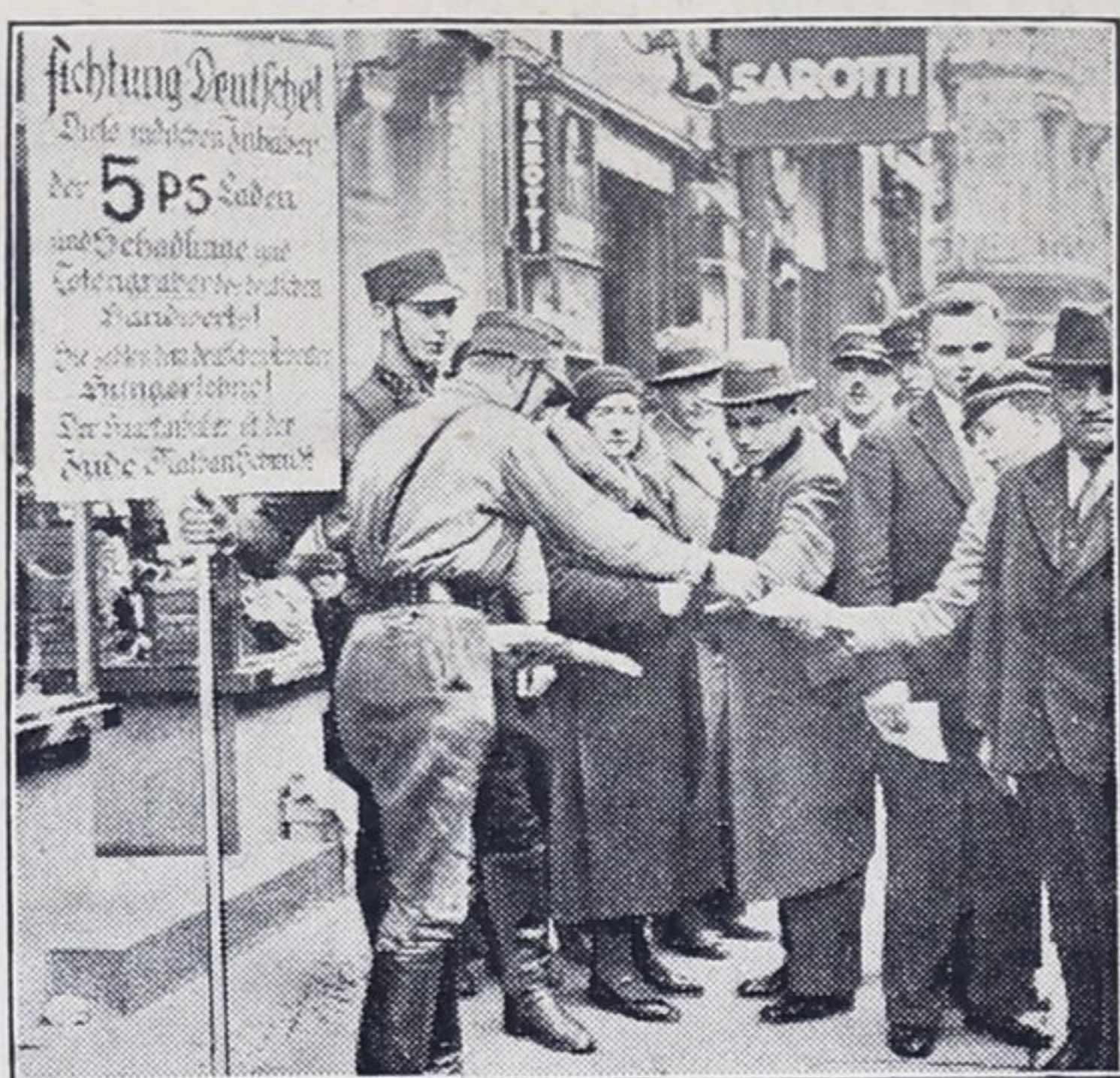
This scene is typical of many which took place throughout Germany during the recent one-day boycott of Jewish stores. Storm troops of Chancellor Adolf Hitler's Nazi organization are shown as they picketed a closed Jewish-owned shop in Berlin. They are carrying placards setting forth the reason for the boycott, which, they said, was adopted as a means of reprisal for the atrocity stories spread throughout the world.