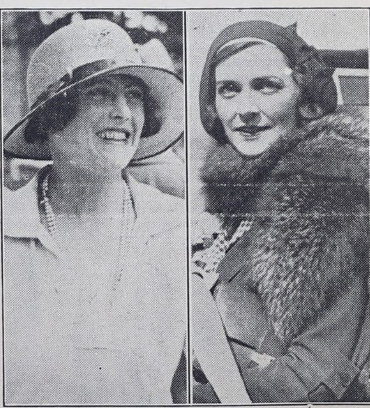
The Marchioness of Milford Haven (left) and Lady Louis Mountbatten (right) are leaving England on an adventurous trip into the Persian Desert. They will take with them neither companions, servants nor luggage. The trip may occupy many weeks and the means of transportation they will use will include trains, ships, aeroplanes, horses, mules, camels and their own feet. The two travellers intend to depend wholly on their own resources and to enjoy unrelieved "roughing it." "We want to get away from people, towns and hotels," said the Marchioness, who is 36 years old, and her companion is 31.