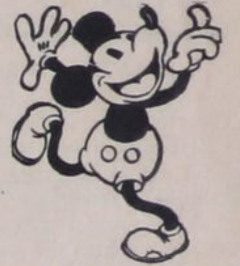
MICKEY MOUSE, in "BARNYARD OLYMPICS"

are not found wanting. The whole service, carried out during a beautiful sunny afternoon, was a particularly fitting and impressive one and a suitable tribute to the memory of the men who had endeavored to carry out the principles of Friendship, Love and Truth, which are enjoined upon all Oddfellows.