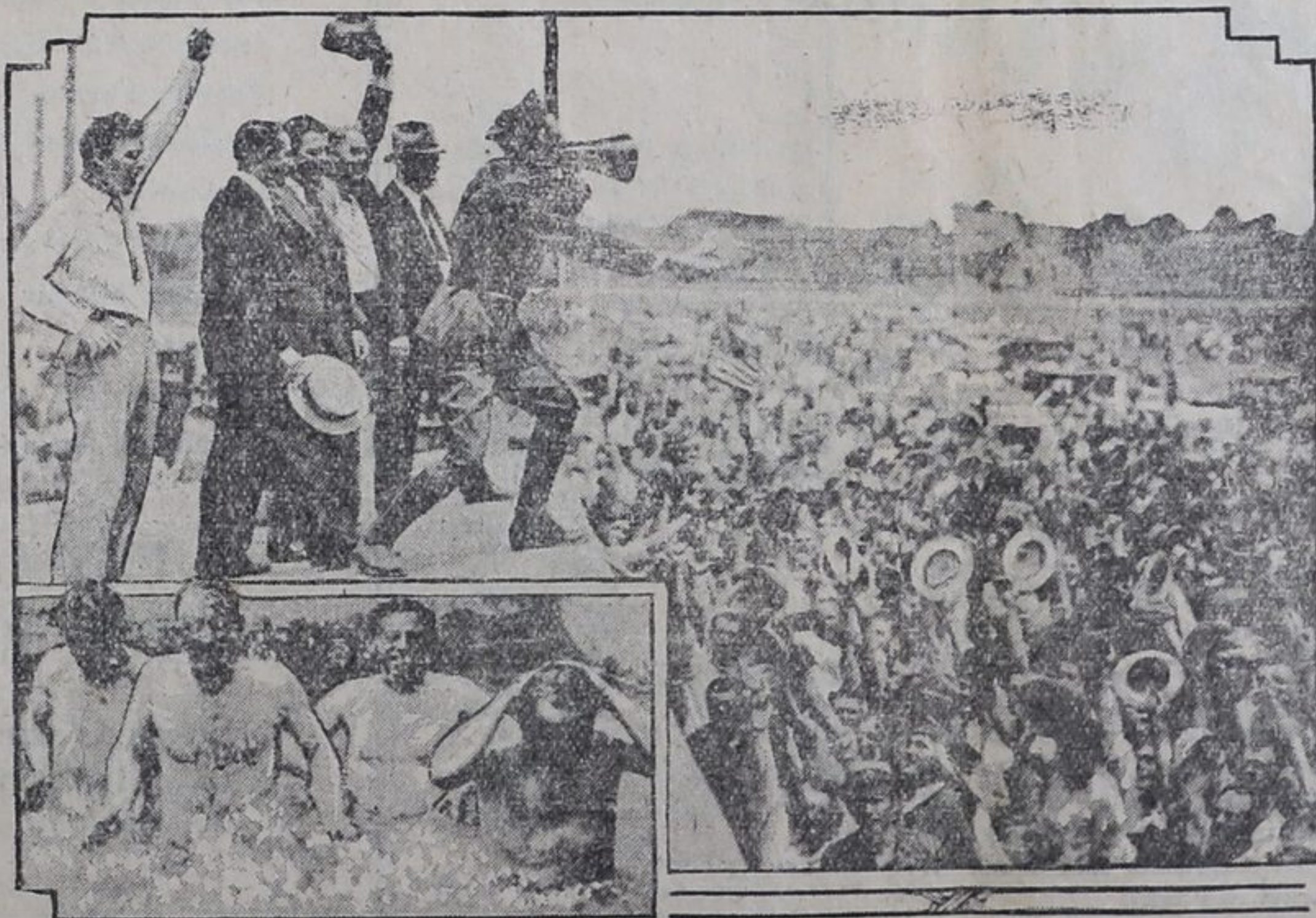
Members of the Bonus Army at Camp Camden, Washington, are shown as they gave a cheer for the Rev. C. E. Coughlin, of Detroit, known as the "Radio Priest", following the announcement that he had contributed $5,000 to provide food for the veterans. It was specified that the gift was conditional upon the vets conducting themselves in an orderly manner while in the capital. In set shows a few of the veterans enjoying a bath in a Washington pool.