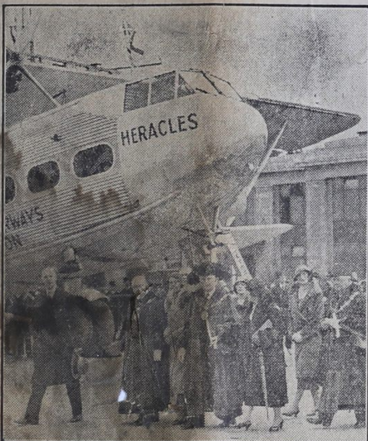
The Lord Mayor of London, Sir Maurice Jenks, accompanied by the Lady Mayoress and various civic dignitaries, are photographed as they prepared to leave the British capital by the Imperial Airways air-liner "Heracles" on an official visit to Morecambe, a holiday resort on the north-east coast of Lancashire, to perform the opening ceremony in connection with the new Town Hall. This was the first time a Mayoral party had used an air-liner for a civic journey in the British Isles.