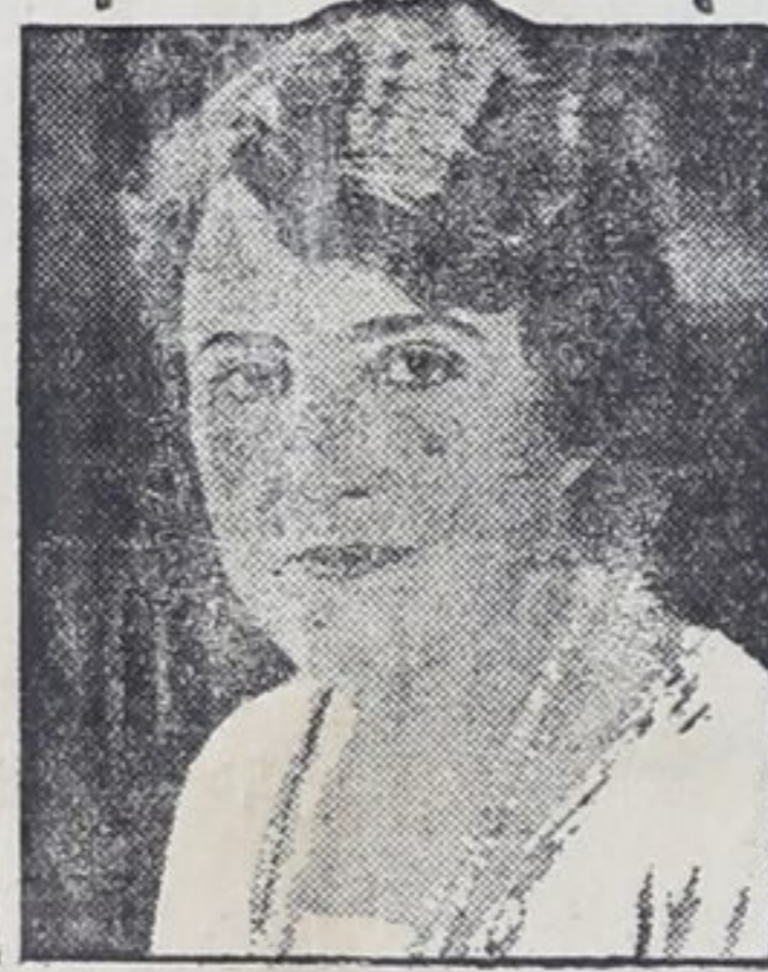
MARY ROBERTS RHINEHART

The most popular American novelist. The first instalment of Mrs. Rhinehart's story, "Sight Unseen," appears in this issue of The Haileyburian.