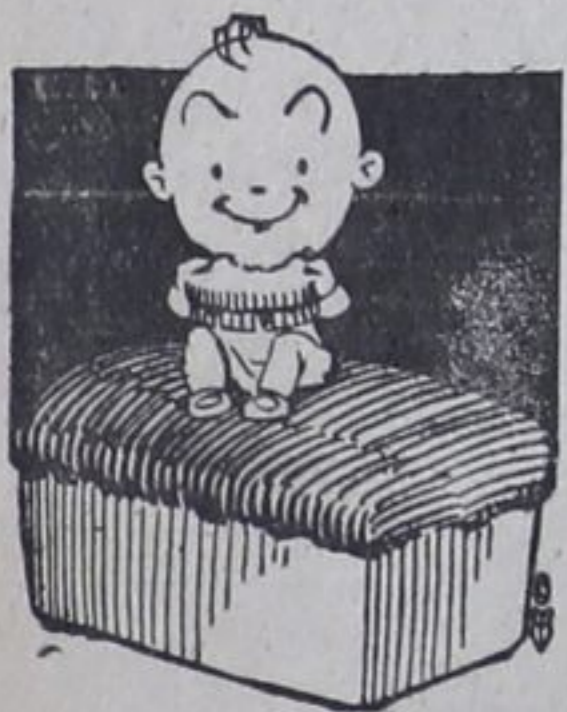
yum - yum