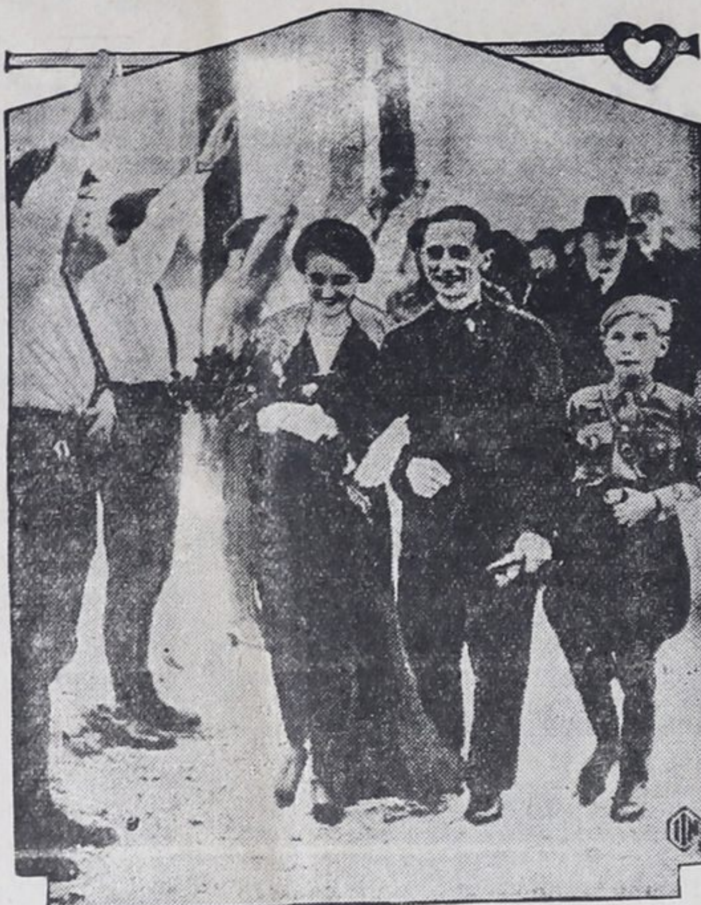
It is hard to imagine the doughty Adolf Hitler, leader of Germany's National Socialist Party, in the role of a follower of Cupid. But here he is shown aiding and abetting the little god with the bow and arrow. The photograph shows Dr. Goebbels, prominent in Hitler's Fascists, leaving Church following his marriage to Magda Quanti, in the little village of Severin. Walking beside the bridegroom is the son of his new bride, while Hitler is in the rear. Note the Fascists who lined the bridal route giving the familiar salute.