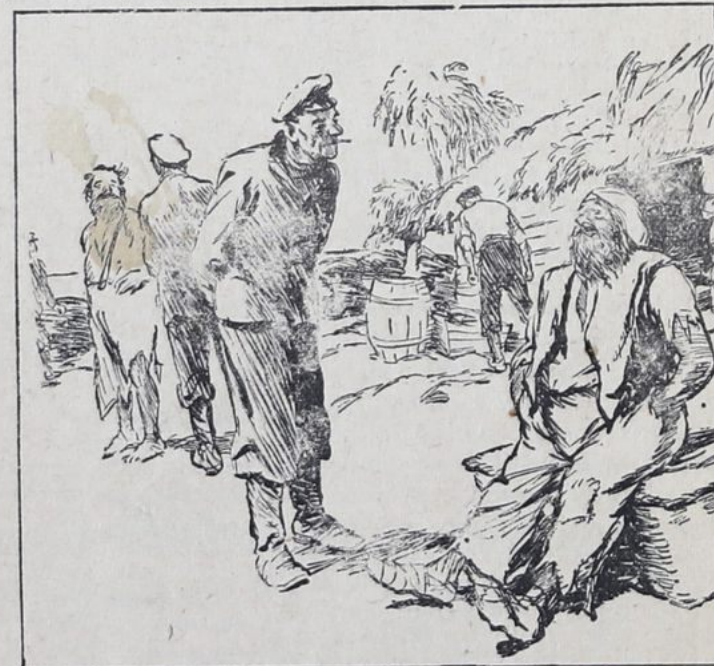
MEMBER OF RESCUE PARTY (to one of the castaways on tropical island): "How long have you been here?" CASTAWAY: "Well, we had been here six months an' four days before Joe discovered 'ow to make cider." —London Opinion