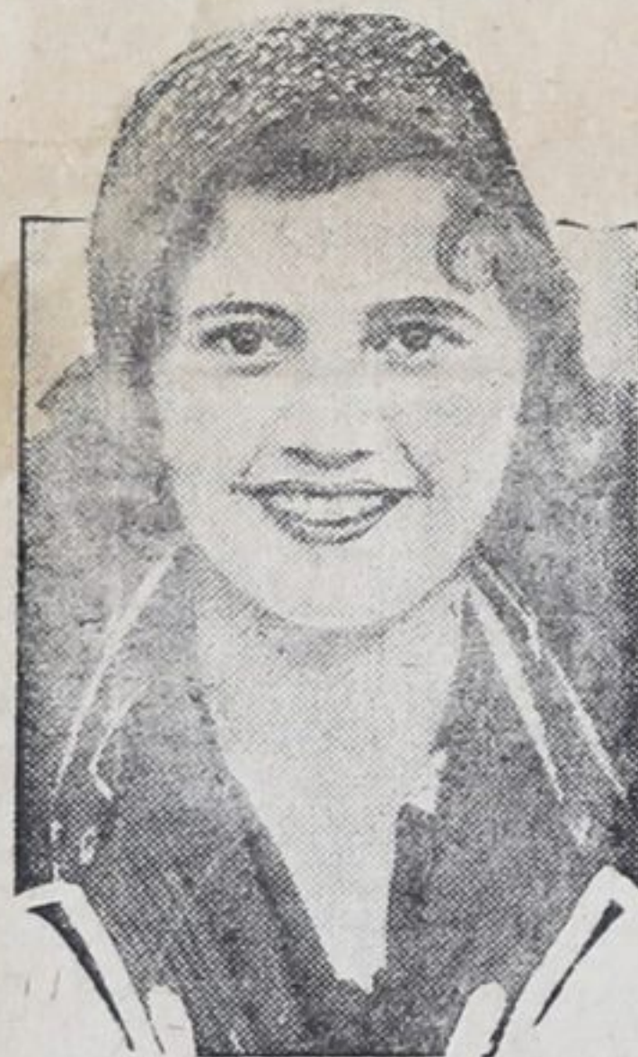
Promising (her opponent would say threatening), to run for office again, Miss Jennie Lee of North Lanark, Scotland, is shown on her arrival in Boston. Miss Lee is only 27, was a member of the British House of Commons at 24. She is in the United States for a lecture tour, when she will compare the present regime in Great Britain with that of the Cromwellian era.