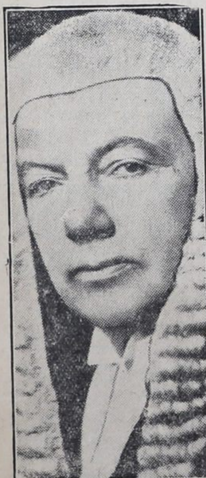
Lord Amulree, Chairman of the Royal Commission on Liquor Licensing in Great Britain, has just brought in the report of the Commission after two years and a half of investigation.