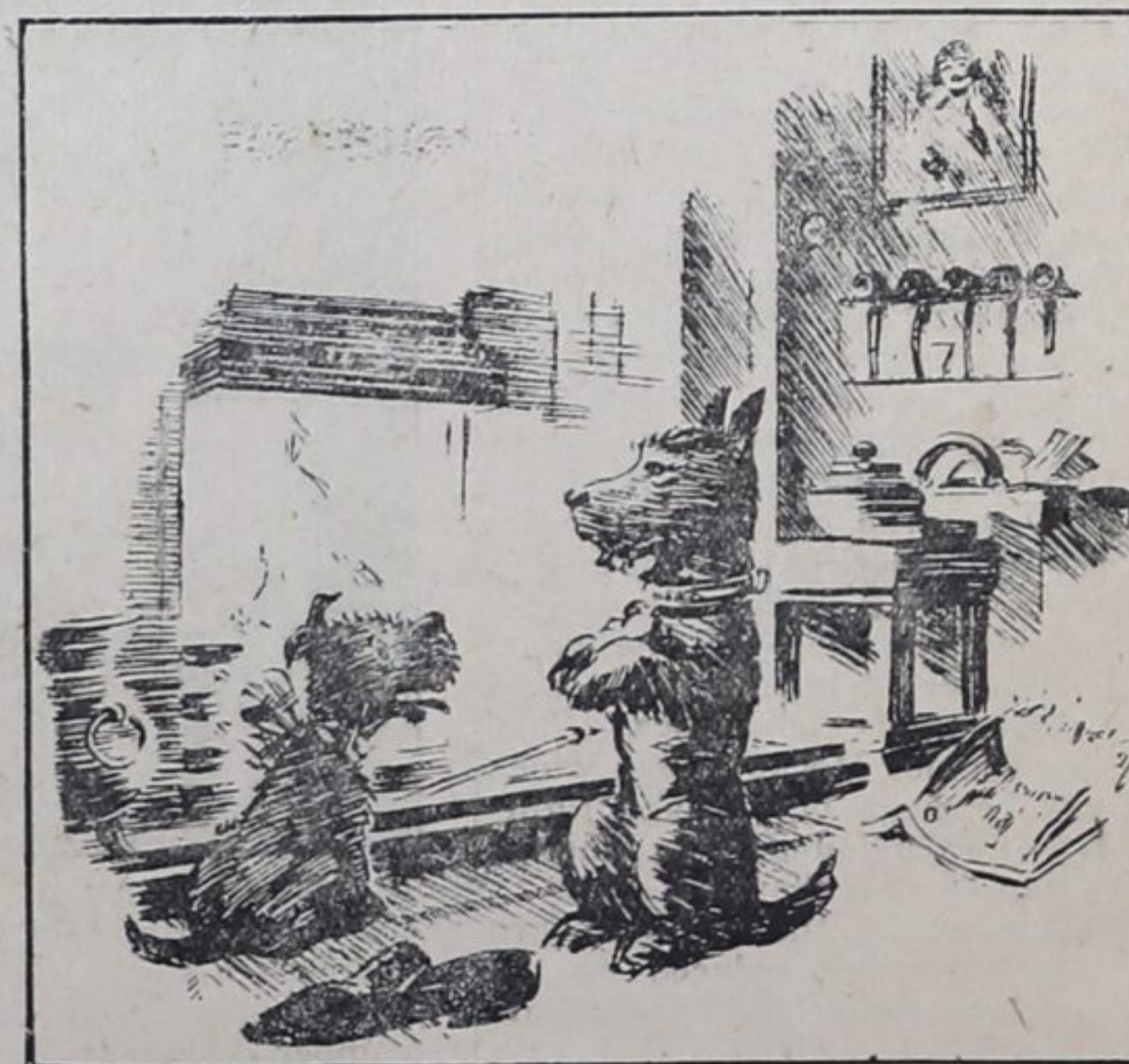
"Why do ye sit up like that, faither?" "Well, if yer lucky, ye get things given tae ye, and it also rests the feet!"