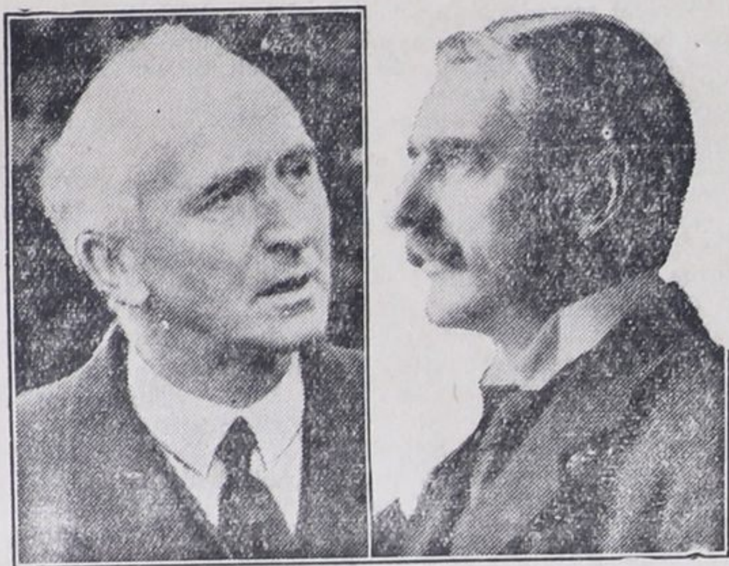
Sir John Simon, British Foreign Minister (left), and Right Hon. Neville Chamberlain, Chancellor of the Exchequer (right), who will lead the British delegation to the Reparations Conference at Lausanne, according to reports from London.