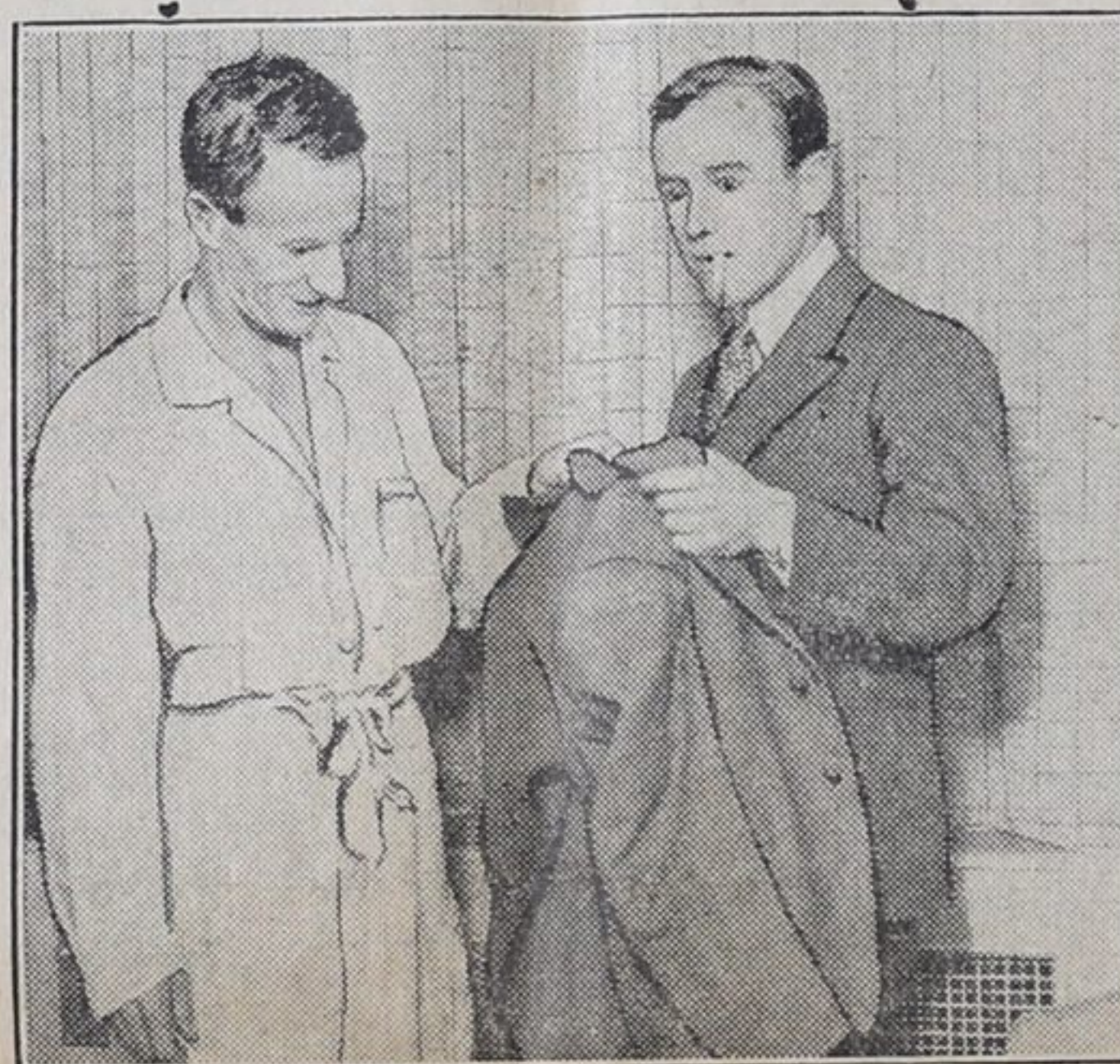
Captain Kingsford-Smith (left), who tried to break the time record for the flight from Australia to London, but was not successful, is here seen borrowing a suit of clothes from Mr. Mollinson, the Britisher, whose record Kingsford-Smith tried to beat. Mollinson covered the fifteen thousand miles in eight and a half days. Captain Kingsford-Smith did not finish, owing to illness.