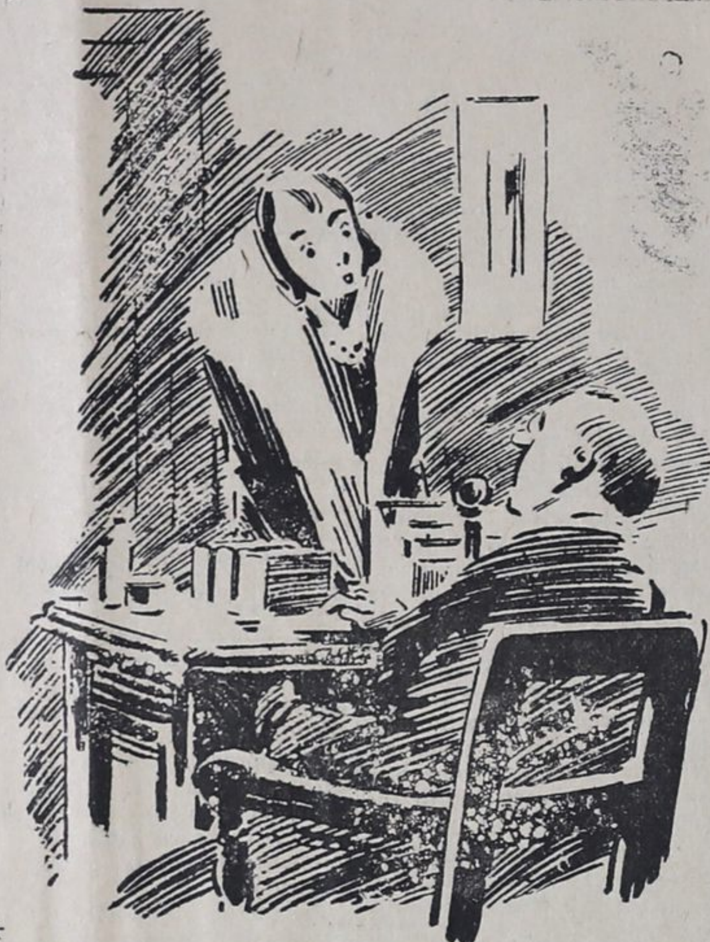
DINER: Waiter, this fish is awful; why did you recommend it? WAITER: "Because, otherwise, Monsieur, it would have been served to us in the kitchen." —The Passing Show, London

D. L. & W. Pennsylvania Anthracite Welsh and Scotch Anthracite Alberta Lump, Ford Coke Special Coal for Grates Birch, Tamarac and Pine Wood in 12 and 16-in. lengths Telephone 266a Clean Coal—Carefully Handled