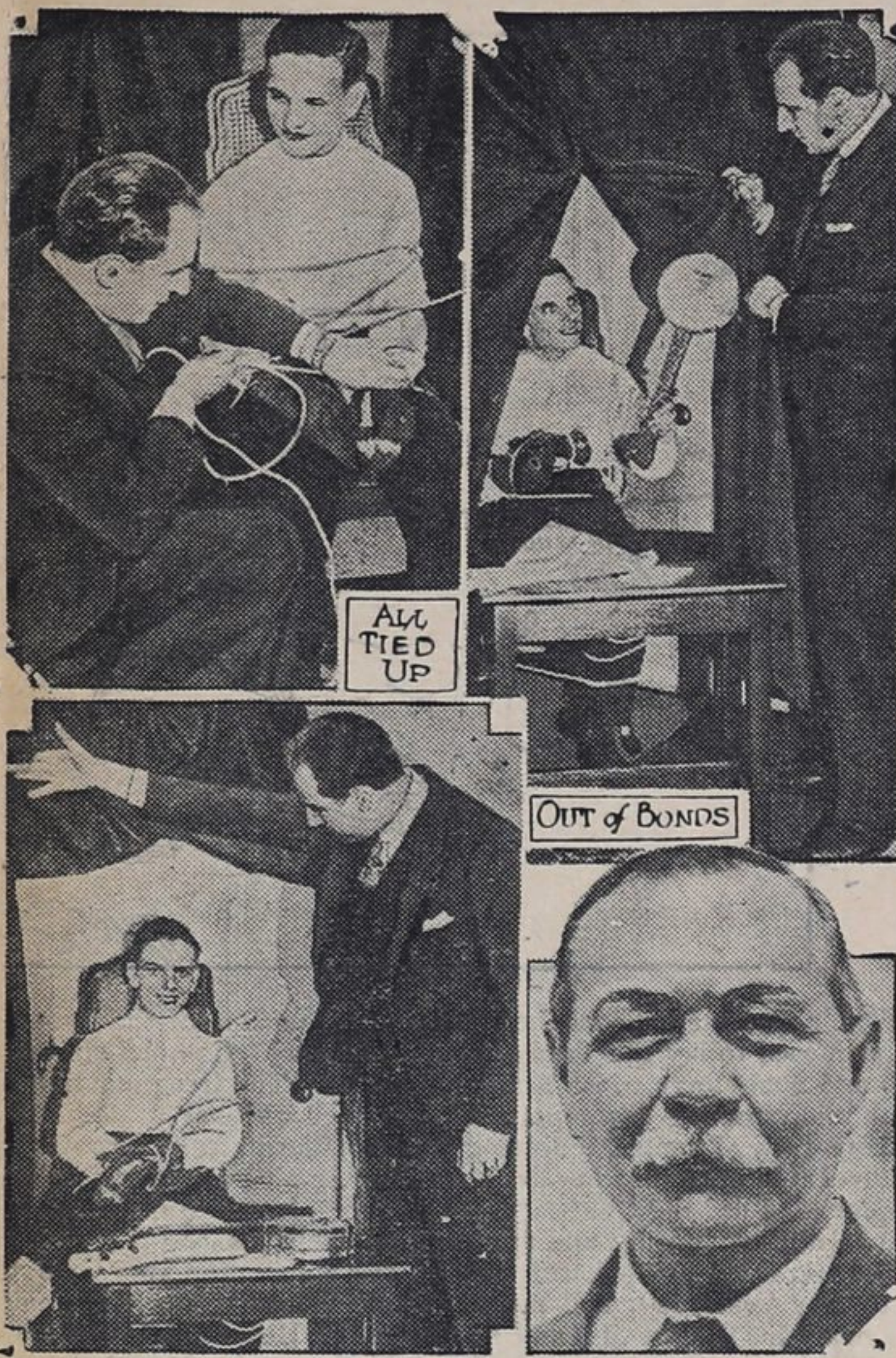
BACK IN BONDS AFTER PLAYING DANJO • THE LATE SIR A. CONAN DOYLE