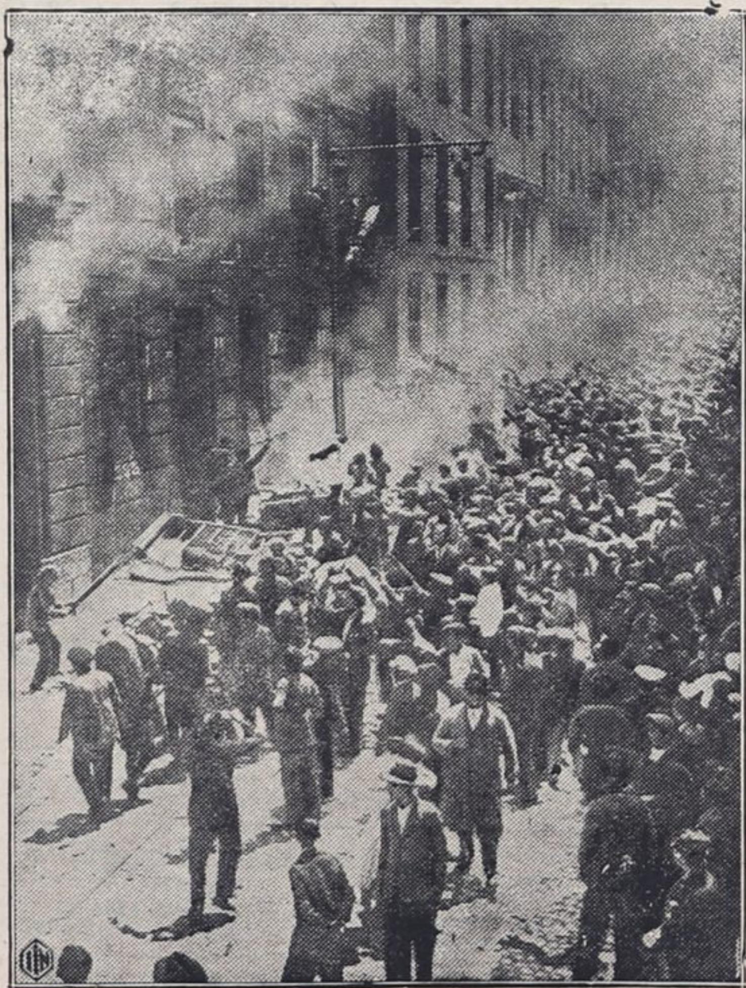
Mob Burning Jesuit Home

In this startlingly graphic picture, the first received in this country, a mob of anti-religious rioters is shown attacking and burning a residence of Jesuits in Madrid, capital of Spain. Violence in the streets of the city and against all that stood for the Church, was raging at its height as this picture was taken. Part of the frenzied mob is watching the Jesuit home on the left as it is consumed by flames, while others of their fellows are carrying on the work of destruction more actively.